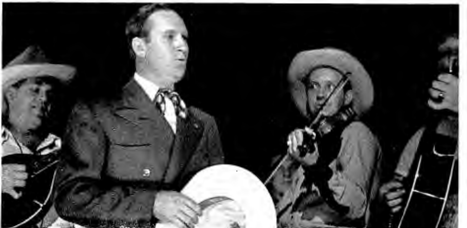
Gene Autry, now famous in the movies, comes back to sing as a guest on the WLS Barn Dance, where he got started a dozen years ago.