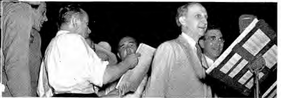
Governor Schricker of Indiana listens while Barn Dance crowd sings for his birthday, at Indiana State Fair.