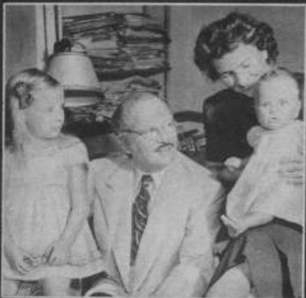
William K. Shirer's wife and children put him in the right frame of mind to work on his broadcast of the world situation.