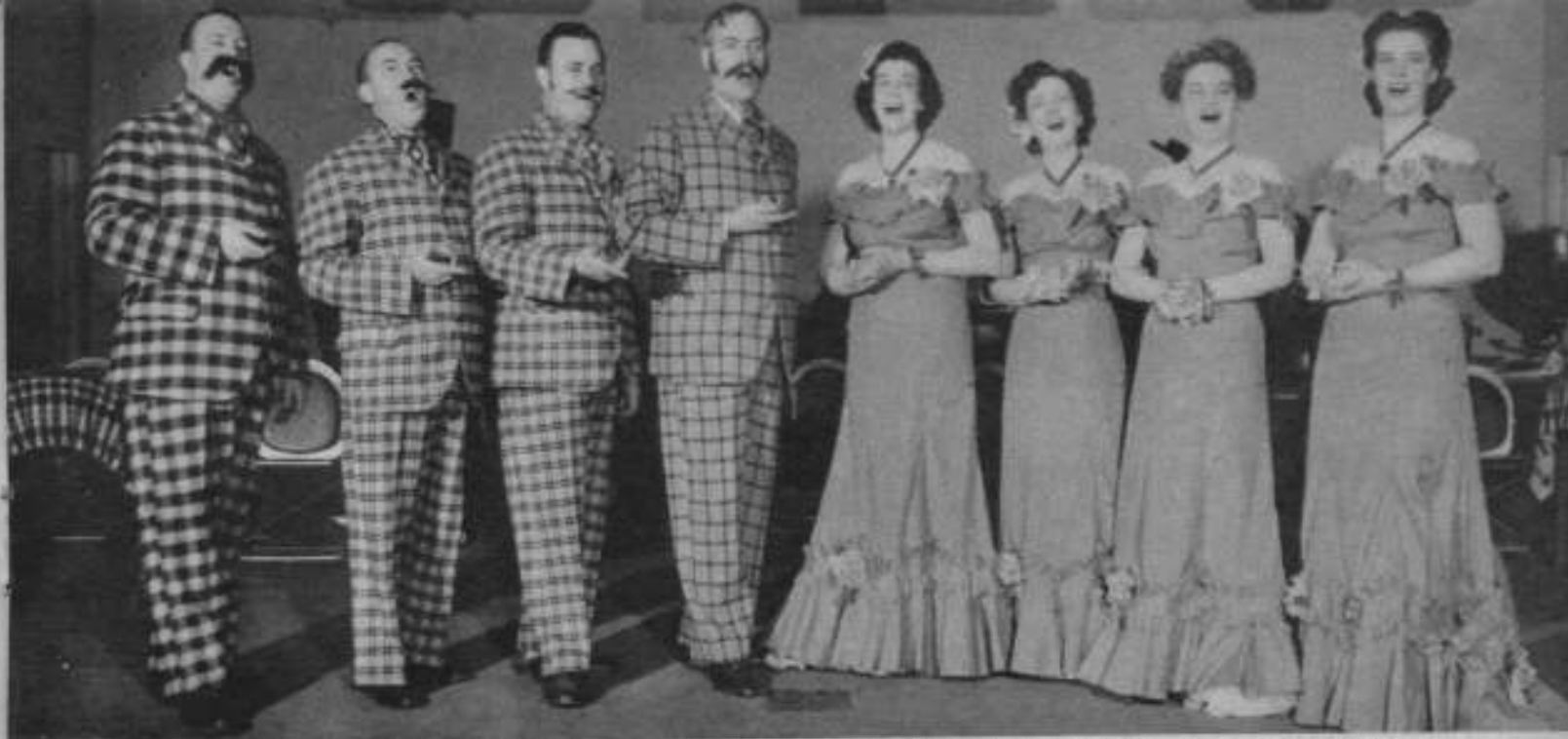
THE ELM CITY FOUR AND THE FLORADORA GIRLS LEND A COLORFUL TOUCH WITH THEIR RENDITIONS OF OLD-TIME FAVORITES