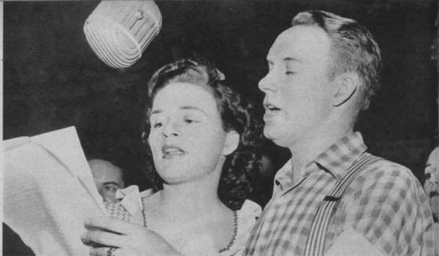
LULU BELLE AND HER HUSBAND, SKYLAND SCOTTY, RENDERING ONE OF THE MOUNTAIN FOLK BALLADS WHICH THEY HAVE MADE FAMOUS