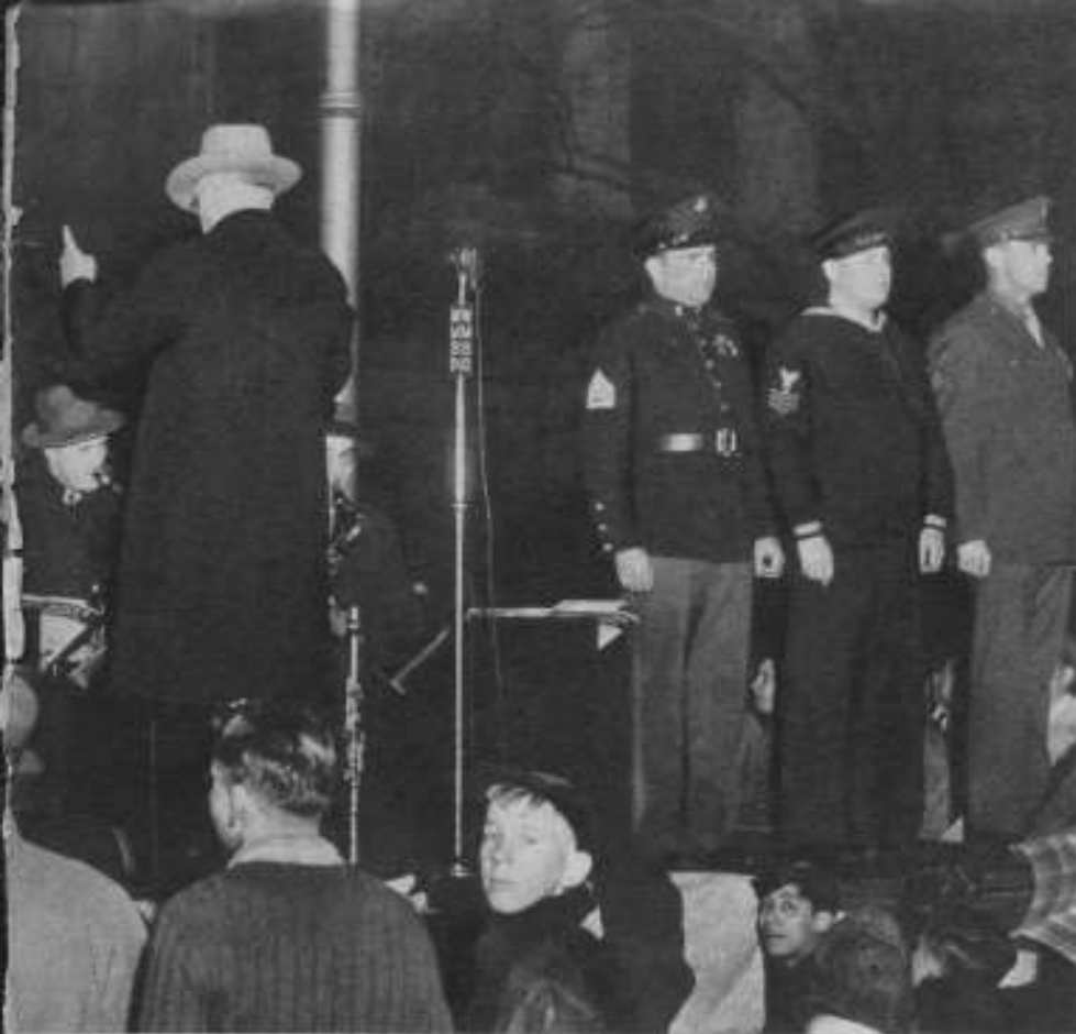
FURNISHING THE ENTERTAINMENT, SHOWS ENTHUSIASTIC PEORIAN TURNING OUT TO CONTRIBUTE