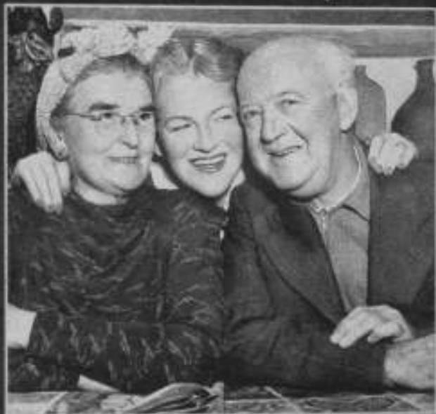
The whole Lancashire family of Gracie Fields lives with her in the Hollywood mansion. Here is Gracie with her parents.