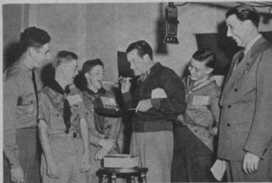
Los Angeles, Calif.—Station KFI—The Scouting Trail program, which is an important feature of this Southern California station, attracts distinguished personalities. Bob Hope, who has just been given the title of Scoutmaster, fried an egg at the station and is feeding it to a Scout.