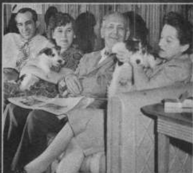
The Gabriel Heatters in their playroom. Gabe sits between his wife and daughter, while his brother Max lounges at the left.