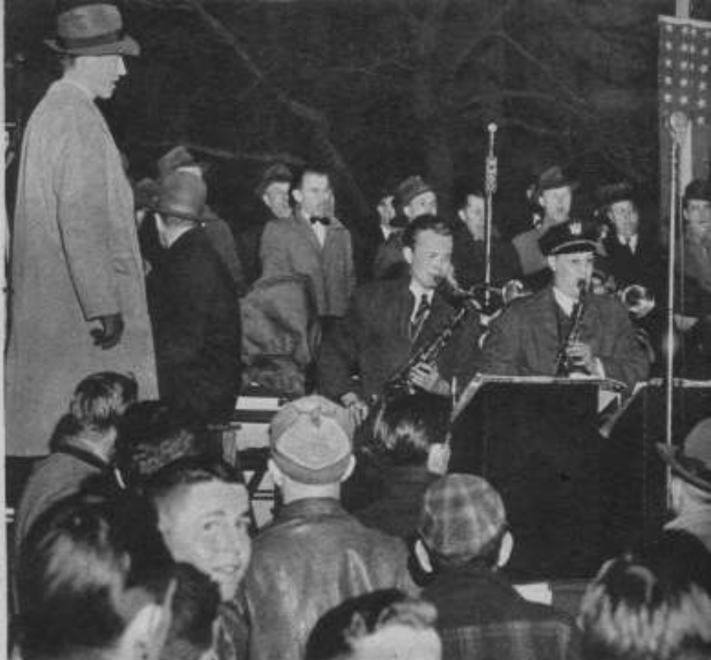
THIS NIGHT SCENE TAKEN OF WMBD'S SECOND WAR LOAN RALLY, WITH THE TRACTOR BAND

◆ A manual of foreign dialects—Chinese, British, German, Greek, etc.—has just been published for the use of radio comedians and villains. The book took fifteen years of research.