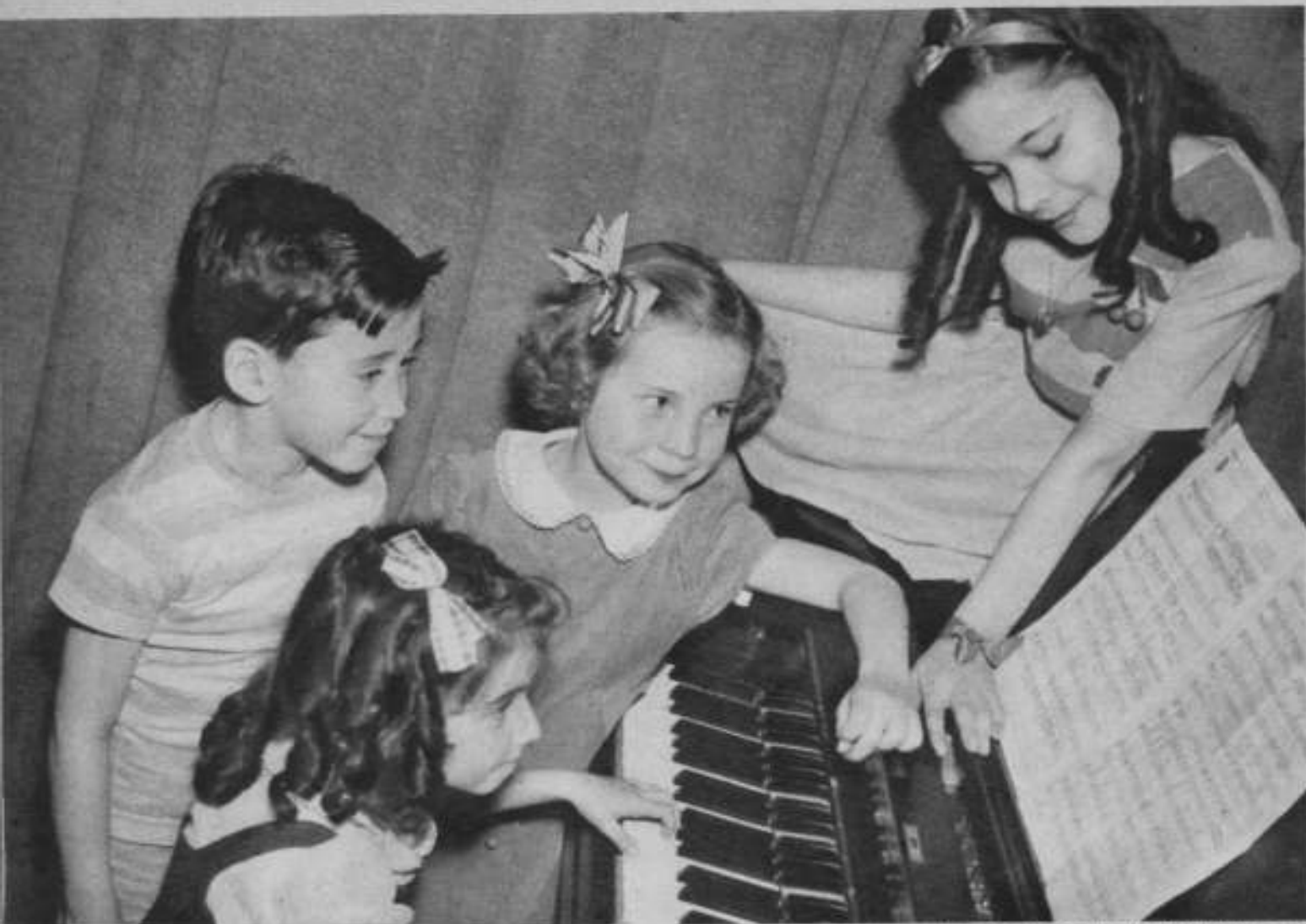
HERE ARE FOUR OF THE YOUTHFUL "REGULARS" ON WCAU'S INSTITUTIONAL "CHILDREN'S HOUR" AT ONE OF THE INFORMAL REHEARSALS