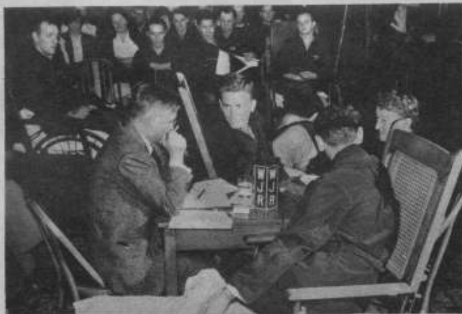
Detroit, Mich.—Station WJRH—They took their round table broadcast to the hospital, and Station WJRH says this is the first broadcast of the kind. It is the Percy Jones General Hospital at Battle Creek, Mich. The wounded men who took part had just returned from Guadalcanal.