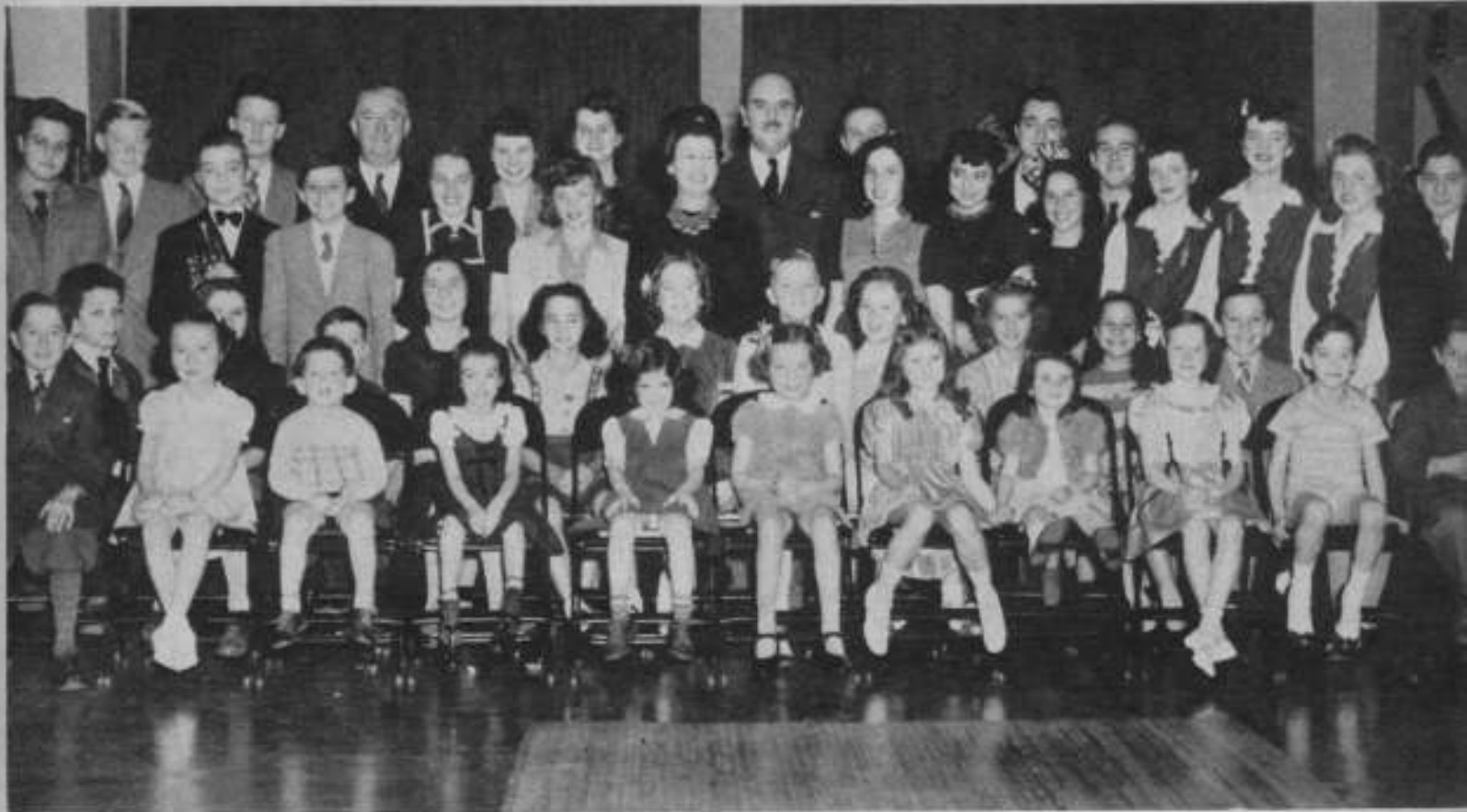
CAST Here is a large group of regular performers on the "Children's Hour" heard each Sunday morning over Philadelphia's station WCAU. They range in age from two to fifteen, and the Permanent Cast numbers over one hundred children. Writers are in back.