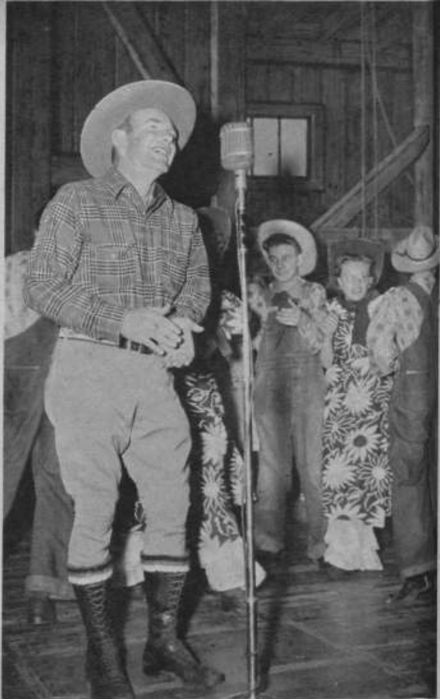
ARKIE THE ARKANSAS WOODCHOPPER, WHO CALLS ALL THE SQUARE DANCES