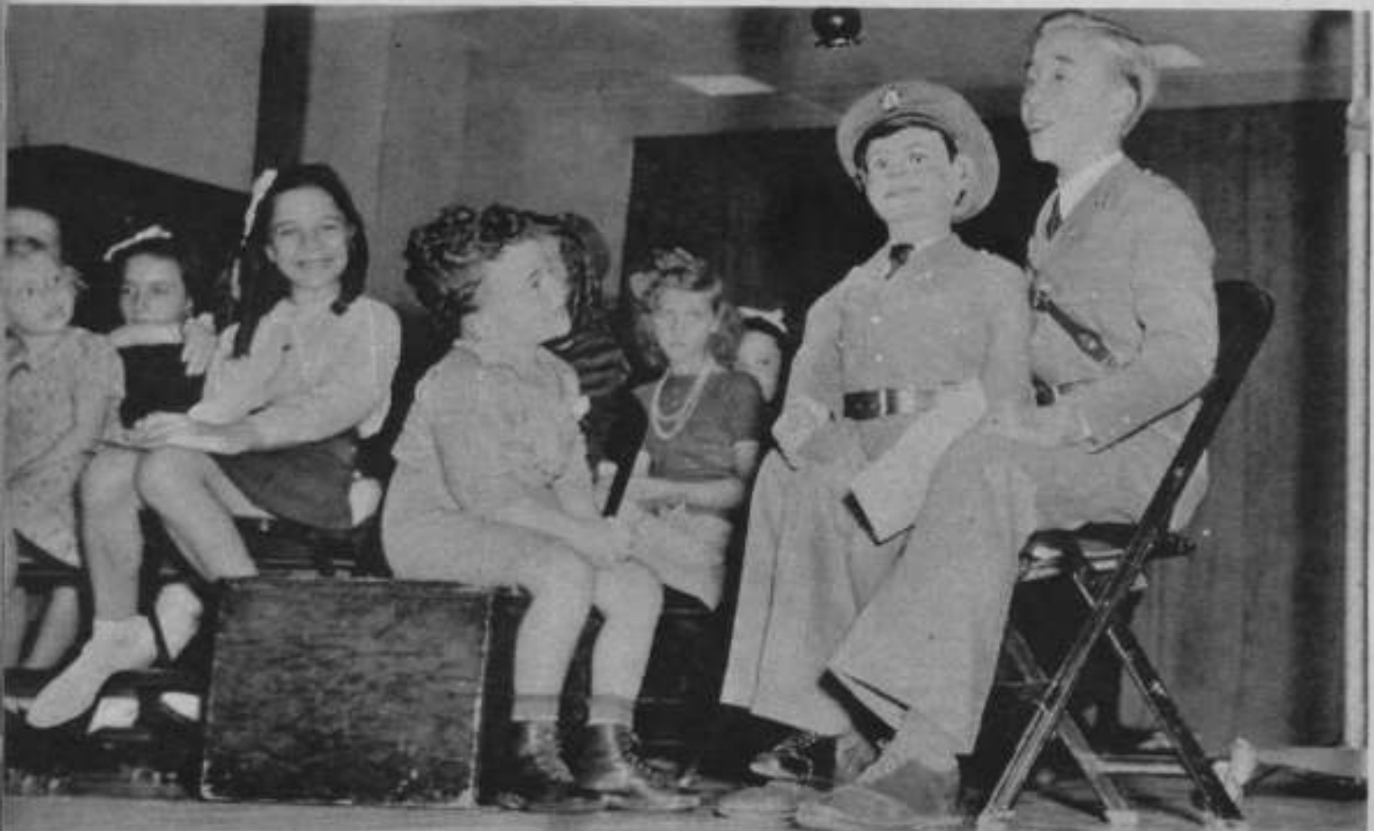
ON THE AIR A typical scene from the program when youngsters make their trial debut. There is no feeling of jealousy, such as you might perhaps expect, only a wholesome, enjoyable amusement on the part of each participant for a new performer.

And many other of its graduates are now in the biggest show of all—the Air Corp, the Bluejackets, Uncle Sam's Army, and the fighting Marines. Such is the record—and an excellent record it is too—of a Philadelphia Institution.