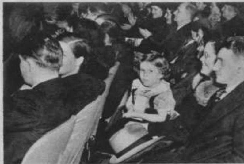
PART OF THE CROWD THAT COMES TO LISTEN TO THE BARN DANCE GANG