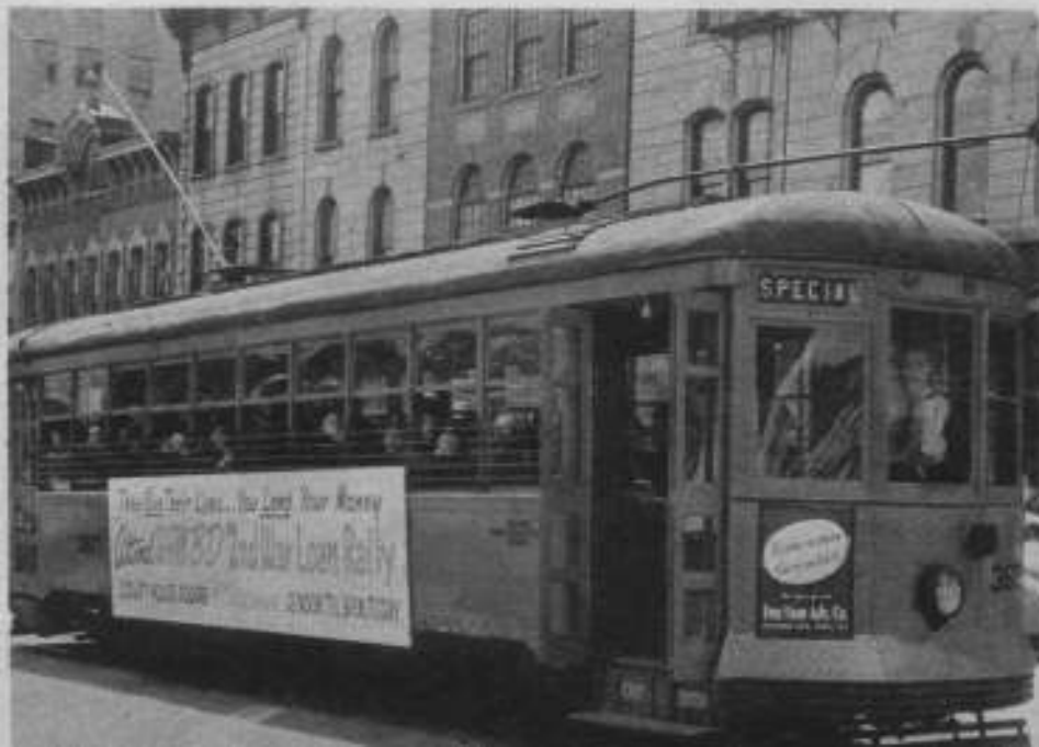
STREET CARS CARRIED BANNERS THROUGHOUT THE CITY OF PEORIA. THE SIGN WAS 16 FEET HIGH.