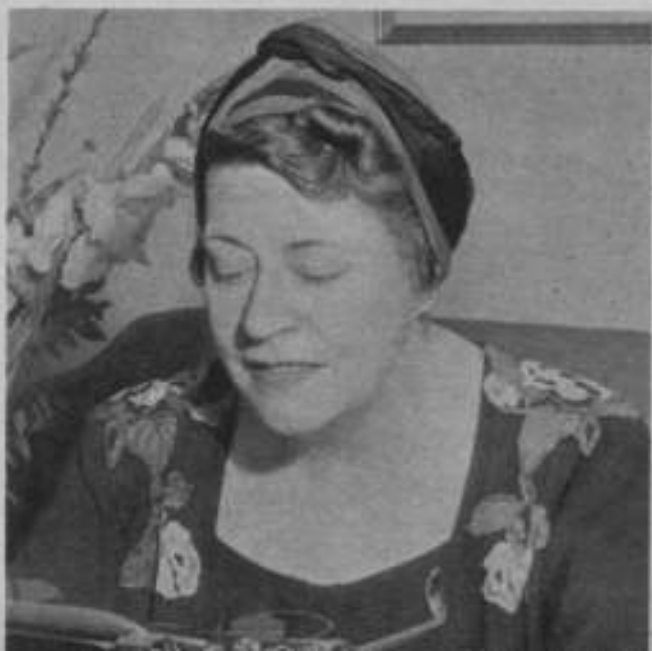
Anne Nichols absorbed in figuring out a new dramatic heart throb