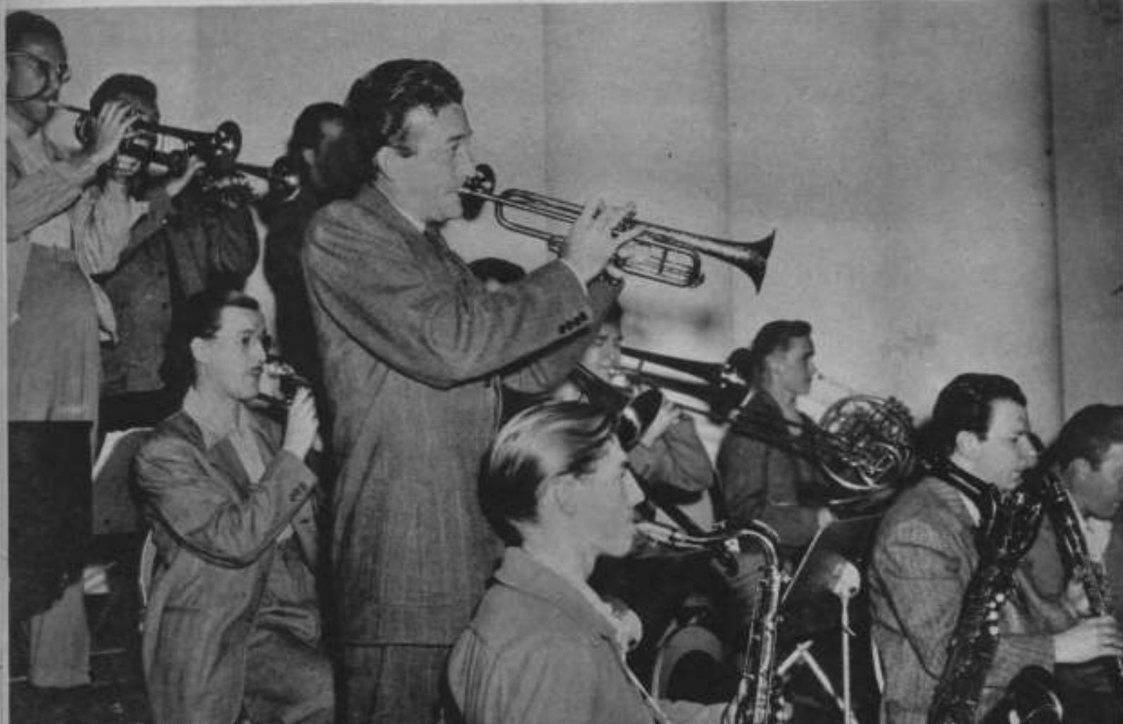
THE WORLD'S NUMBER 1 TRUMPETER STEPS FROM THE CENTER OF THE STAGE TO THE BRASS SECTION TO DO HIS SENSATIONAL STUFF

Good looking Harry James is married to Louise Tobin, former vocalist