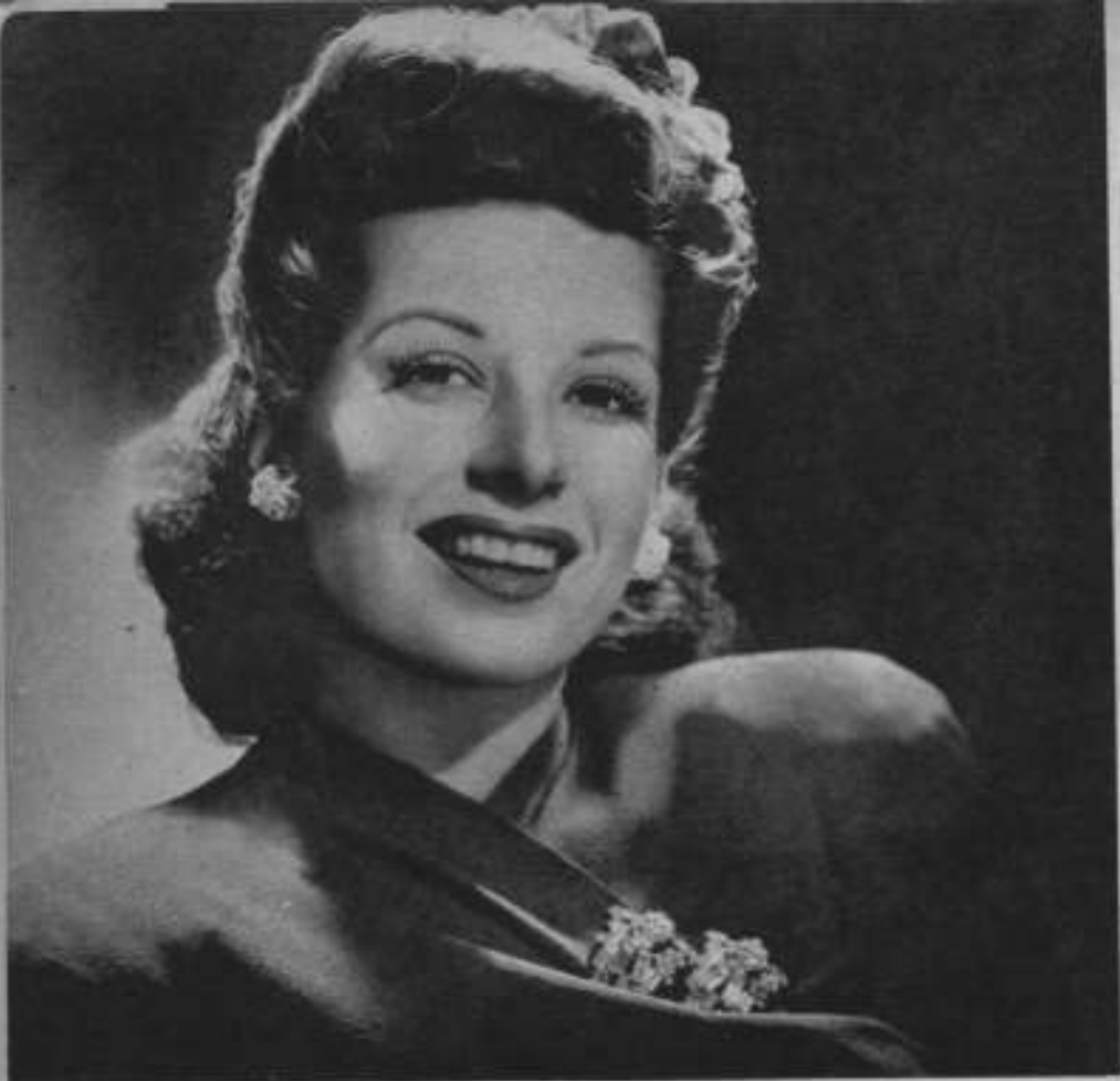
HELEN FORREST, BAND'S VOCALIST WHO RIDES THE CREST OF POPULARITY WITH JAMES