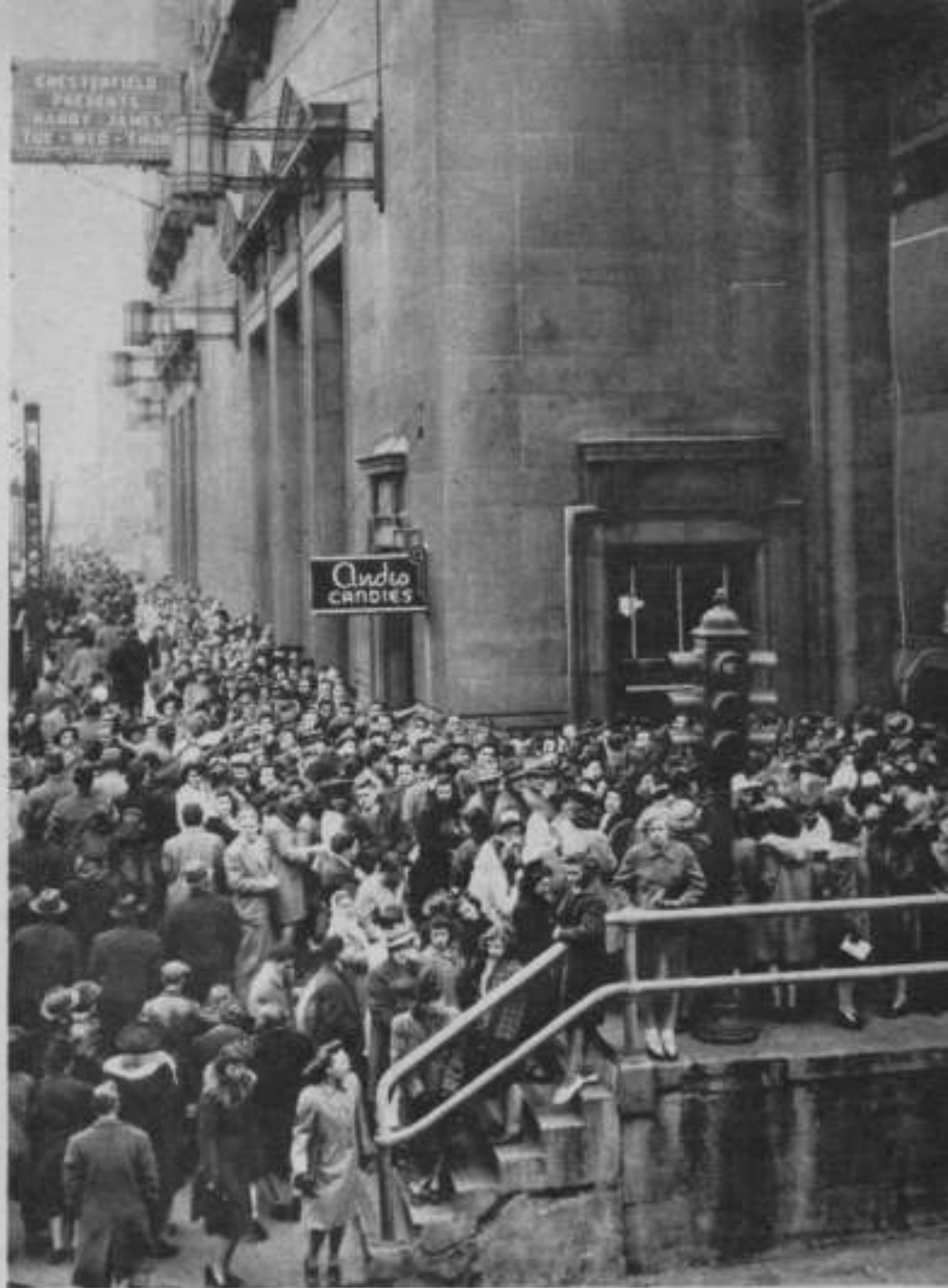
CIVIC OPERA HOUSE, CHICAGO. A TYPICAL SCENE DURING A HARRY JAMES ENGAGEMENT

THE POPULAR HARRY JAMES CONDUCTS A JAM-AND-JIVE SESSION FOR A SOLDIERS' CAMP ON A SPOTLIGHT BAND PROGRAM