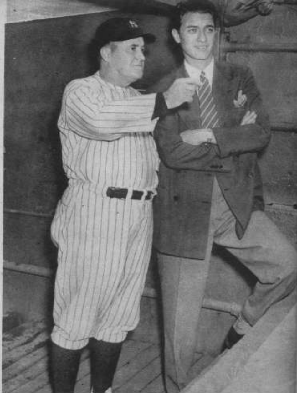
Manager Joe McCarthy gives Mel Allen some inside information before the game.