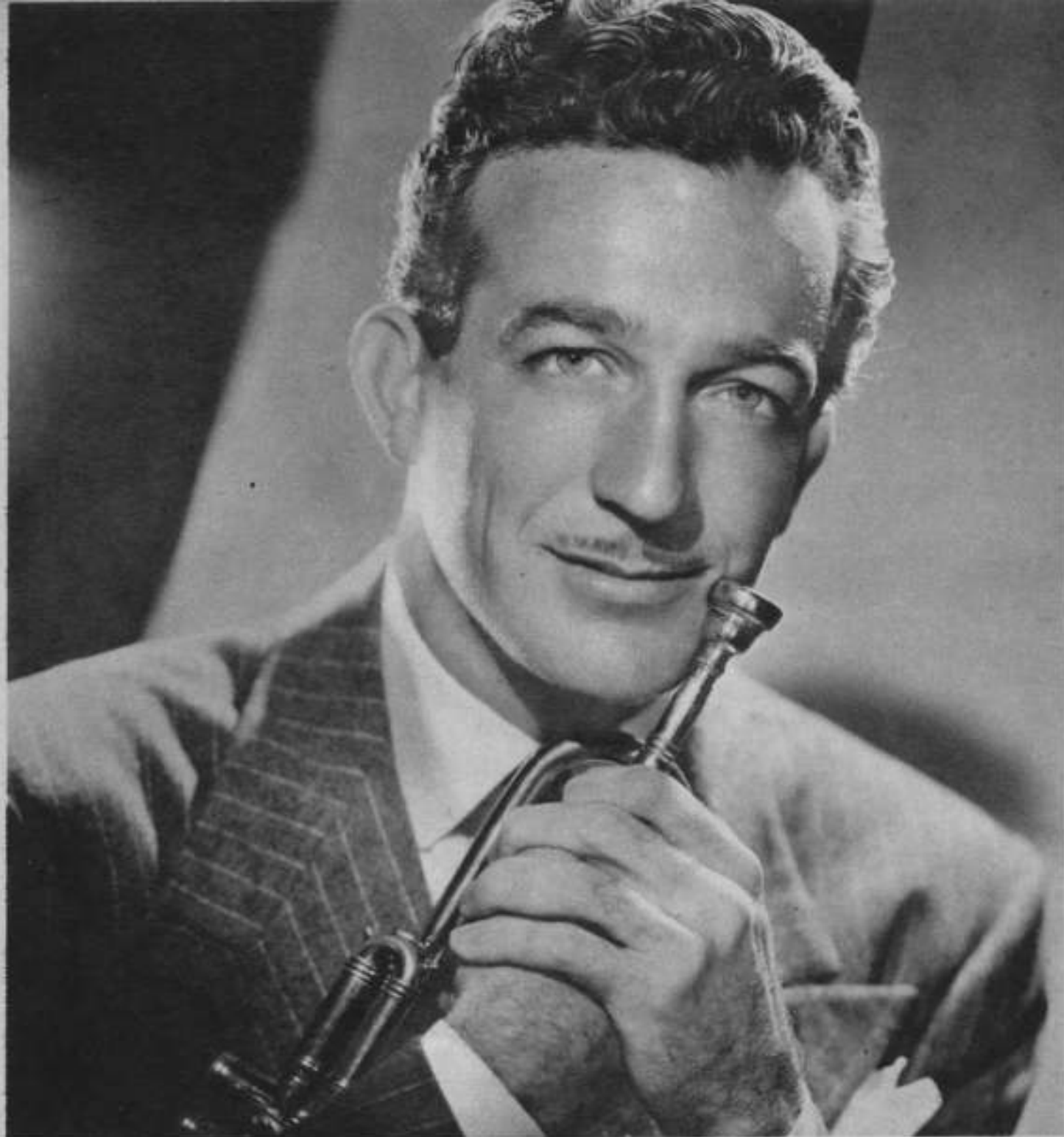
THE SWEET AND HOT MAESTRO HIMSELF WITH ONE OF HIS SPECIALLY MADE INSTRUMENTS, WHICH HE HOLDS WITH MUSICAL AFFECTION