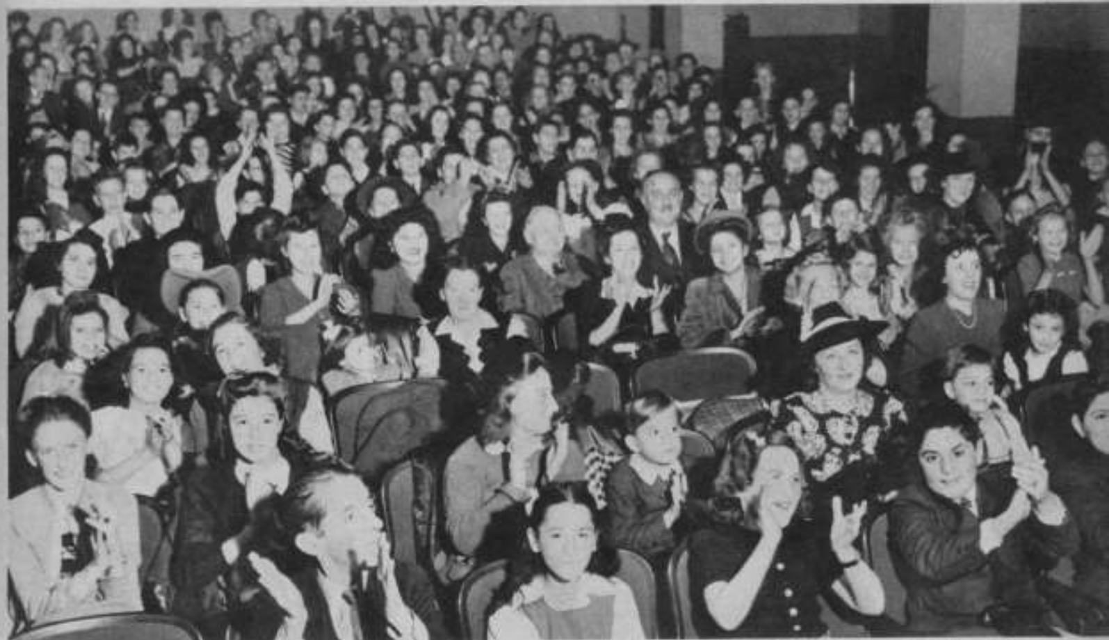
STUDIO AUDIENCE This is a typical audience that appears at every broadcast to applaud and lend encouragement to youngsters who have come from every walk of life to get their initial start in Radio. The Philadelphia program is a high goal.