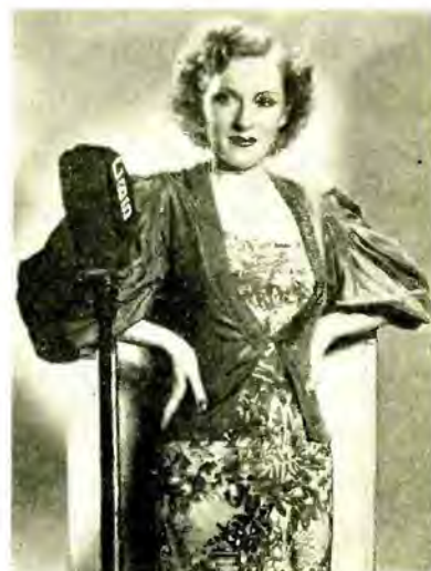
She likes taffeta and crepe.

The dress is very formal, cut low and trailing a bit in the back, with a panel from the knees that falls in-