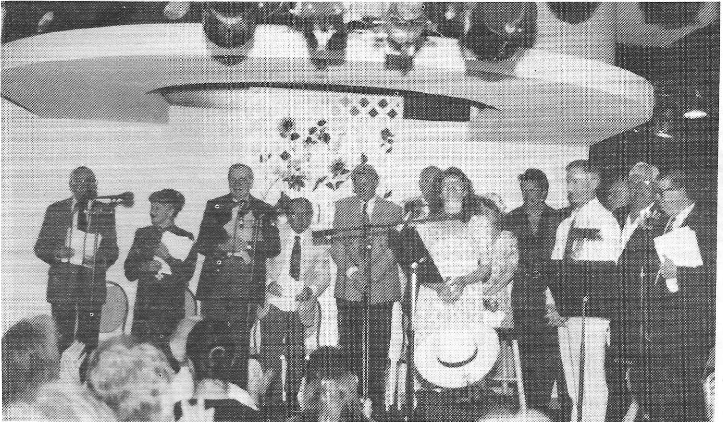
The cast of the California Artists' Radio Theatre production of "Alice in Wonderland" following their June 11 performance. CART has three performances of works by Norman Corwin planned for July 13 and 16. See ad on page 6 for details.