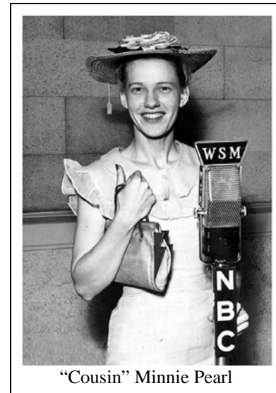
“Cousin” Minnie Pearl

“How-DEE! I’m jes’ so proud to be here.” That was the opening line of the comedy routine of Sarah Ophelia Colley Cannon, known for more than 50-years on The Grand Ole Opry as “Cousin” Minnie Pearl. Her gentle satire on the “hillbilly” culture was a favorite of the OTR listeners to the Opry .