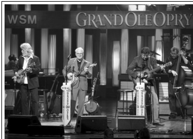
Same Opry, same station, new talent - Steve Martin

Just as the Golden Age of network radio ran its course, so did Opry offerings of music that is now called “classic country” music. Some individual stations and satellite services still carry the format. WSM 650 AM continues to broadcast the Opry . The music and complete shows are available through opry.com, and on iPhone and Android APs and, of course, recordings of original broadcasts by collectors.