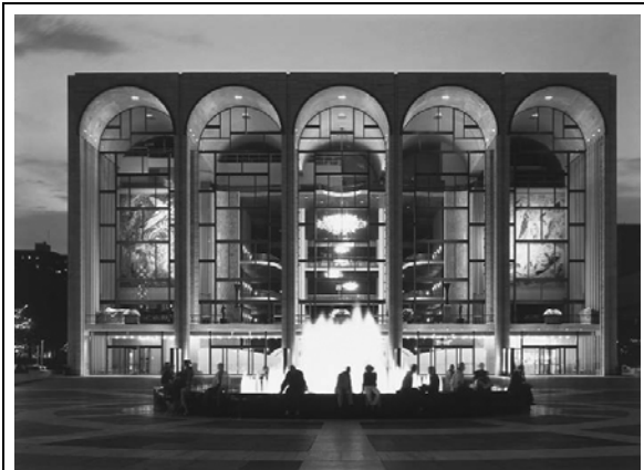
New York City Metropolitan Opera House

Incredible as it may seem, the Metropolitan Opera (fondly called “The Met”) was heard on the air for the first time in 1910 (on December 11 to be exact.) A few New Yorkers who had “cat whiskers” crystal sets and earphones were able to hear the classic operas Cavalleria Rusticana and Pagliacci . The Great Enrico Caruso was featured. Radio historians are not sure the entire performance made it on the airwaves. The broadcast aired directly from the Met stage and was one of the early experiments by broadcast pioneer Lee De Forest.