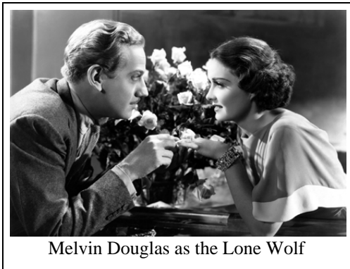
Melvin Douglas as the Lone Wolf