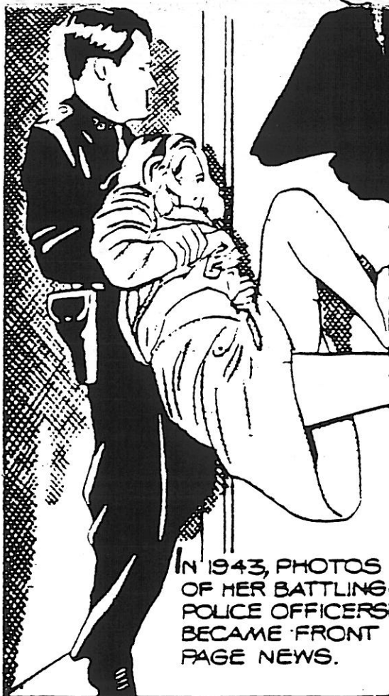
IN 1943, PHOTOS OF HER BATTLING POLICE OFFICERS BECAME FRONT PAGE NEWS.

THOUGH SHE BECAME BUSY IN FILMS, THE STAGE AND RADIO, CRITICS DID NOT HOLD FRANCES FARMER IN HIGH REGARD. BROKEN MARRIAGES LED TO HEAVY DRINKING AND RUN-INS WITH THE LAW. EVENTUALLY SHE WAS COMMITTED TO AN INSANE ASYLUM.