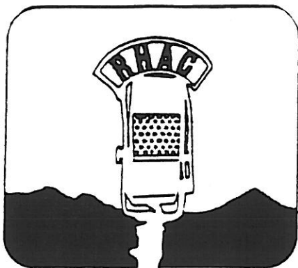
Radio Historical Association of Colorado