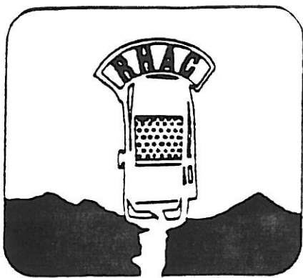
Radio Historical Association of Colorado