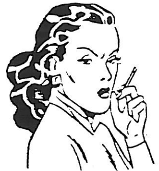
AGNES MOOREHEAD WAS THE DRAGON LADY