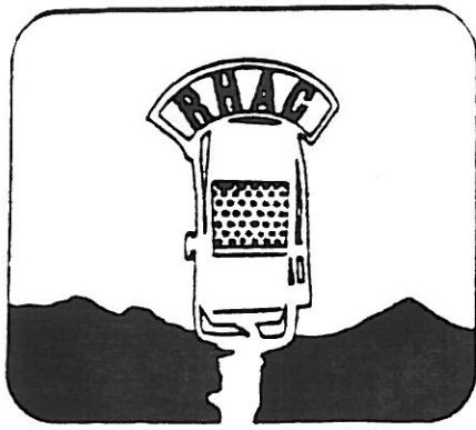
Radio Historical Association of Colorado