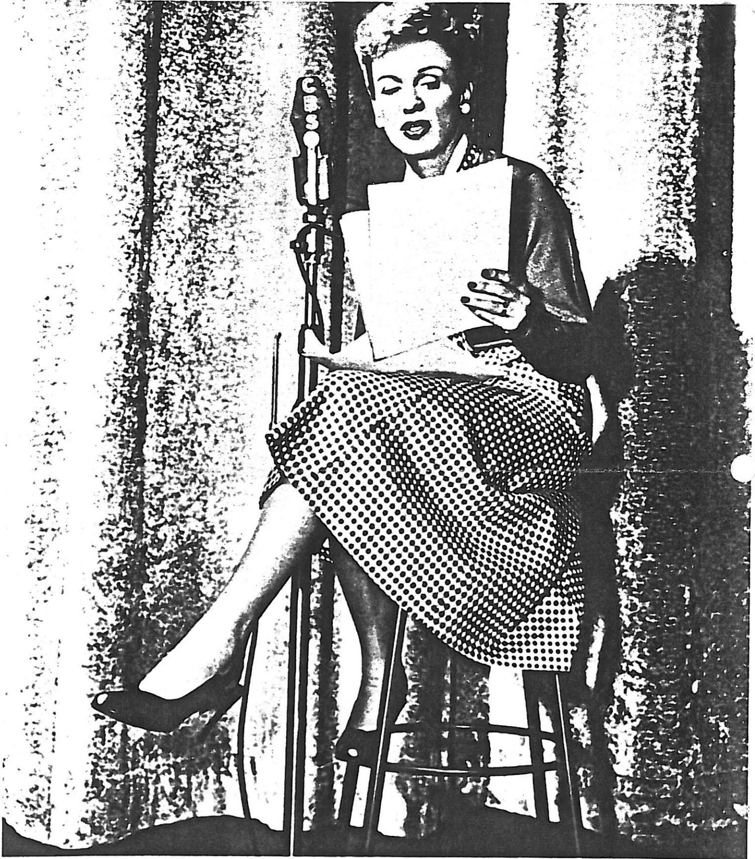
Photo 6 This popular comedienne made a career of playing a sharp, no-nonsense school teacher at Madison High School. The teacher later moved to television and, on one occasion, to the screen. Name the actress and the program.