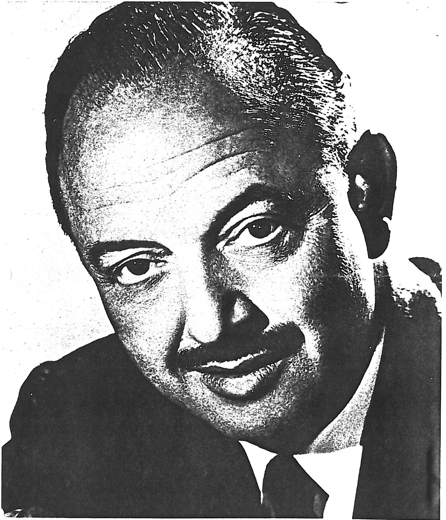
Veteran comic actor Mel Blanc, who contributed many voices to radio and is also the voice of the immortal Bugs Bunny