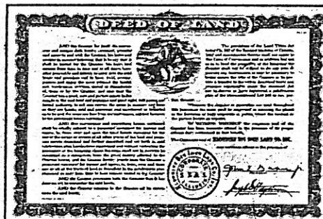
Legal deed to a free piece of Canada

ever, since his tiny land parcels were not adjacent.) Ultimately, the Canadian government reclaimed the land from Quaker for $37 in back taxes. The deeds themselves are prized today by collectors and are worth $25 to $40 each.