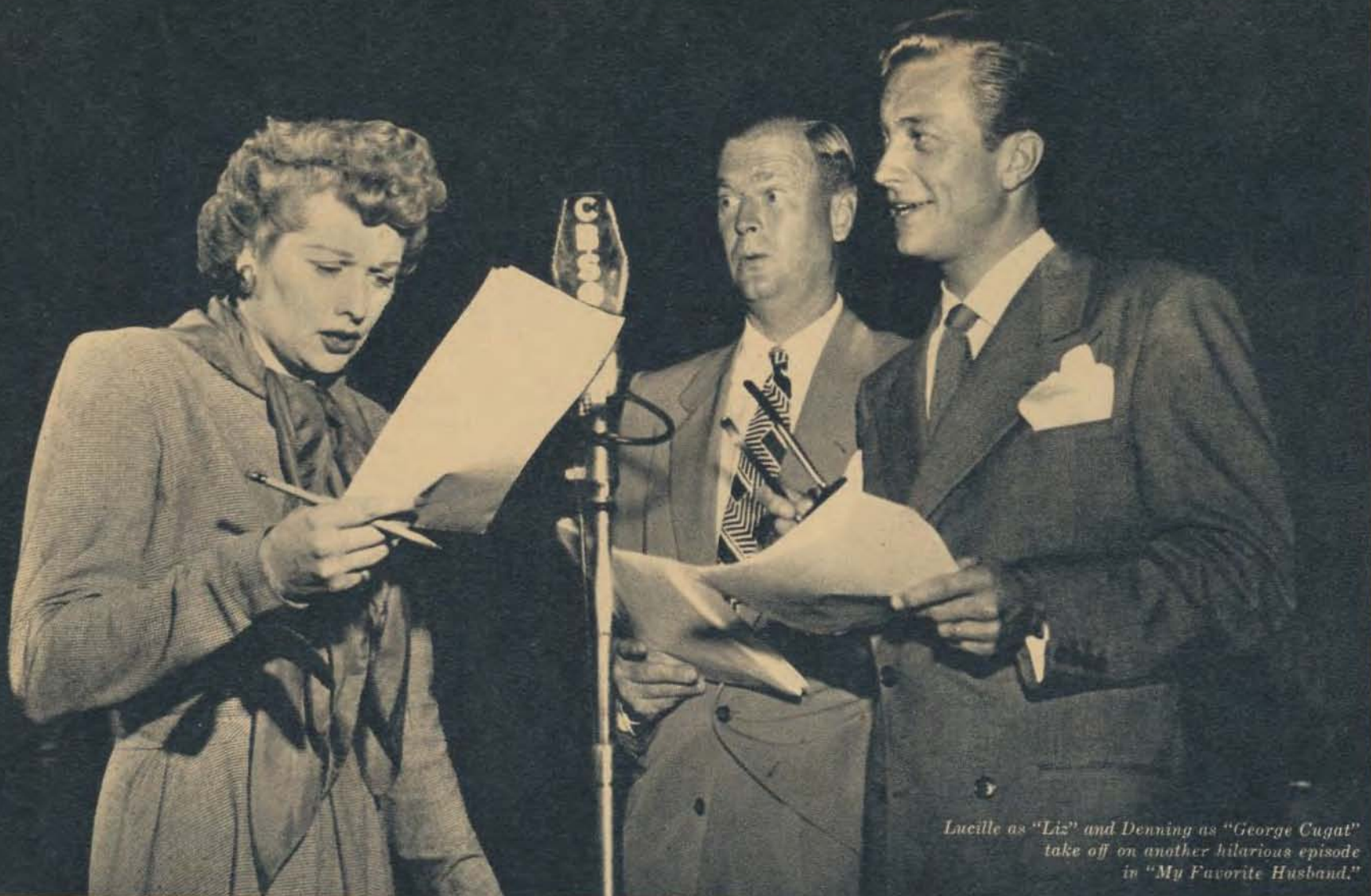
Lucille as "Liz" and Denning as "George Cugat" take off on another hilarious episode in "My Favorite Husband."

Pretty girls are a dime a dozen. It's what's inside that counts. That's why Lucille