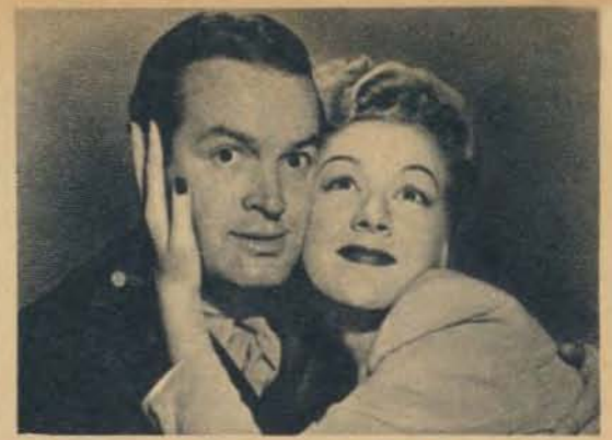
Bob enjoying a cozy moment with Betty Hutton, as a buck private in Paramount's "Let's Face It."

so busy that he has become a one-man industry—one of the biggest in America.