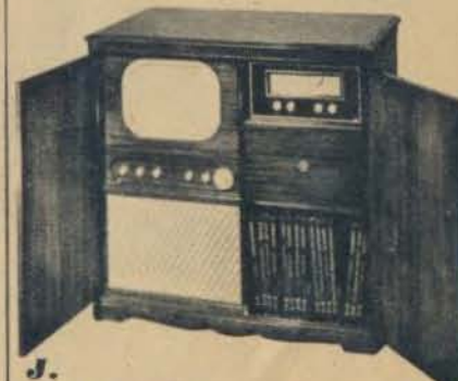
J. U. S. TELEVISION —15" direct view, AM-FM, phono, console. $895.00