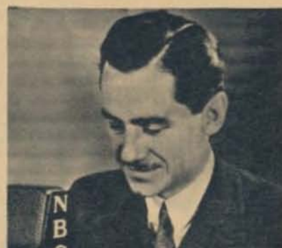
Commentator — placed second. Mel-low voiced traveler Lowell Thomas.