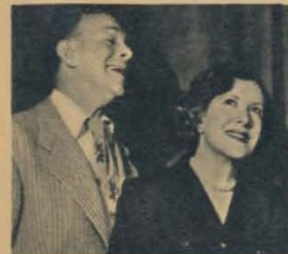
Top Husband-Wife Team — Burns & Allen nation's favorite radio couple.