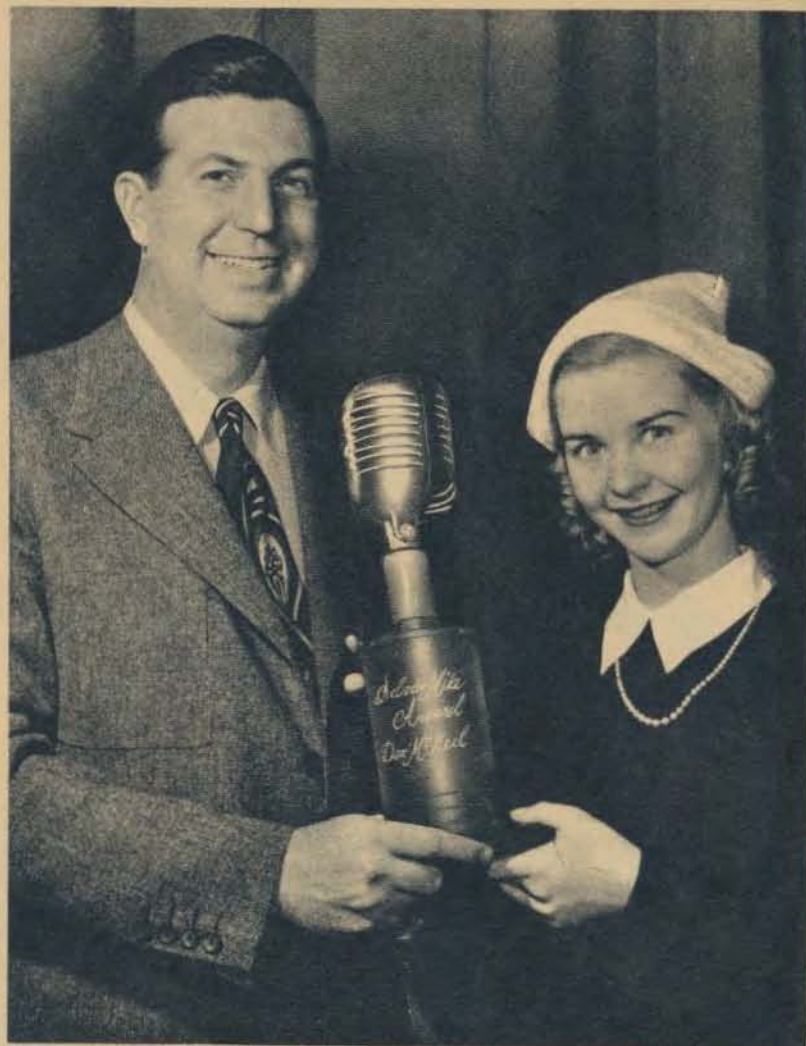
Don McNeil receives his Silver Mike from lovely Barbara Ann Scott of figure skating fame.

There may be those who have been around radio longer than Don McNeil, engaging impresario of ABC's Breakfast Club, but none can claim more appearances before the microphone as master of ceremonies. For on a very conservative estimate McNeil has spent over 5000 hours in this capacity since he took over the Breakfast Club in 1932. While this may be a distinction of a sort, it still does not explain the tremendous popularity of one of radio's most admired and imitated m.c.'s. Over the years McNeil has developed an informal, off-the-cuff style that is the wonder and despair of fledgling m.c.'s, for they appreciate the difficulty of mastering the utter simplicity of manner which is McNeil's forte.