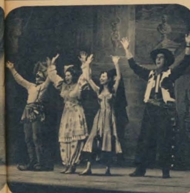
★ ADMIRAL BROADWAY REVUE Musical-comedy stars Sid Caesar—and stock company