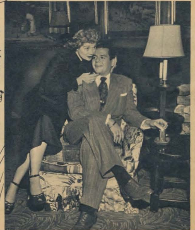
Lucille and Desi on a brief vacation in New York chattered eagerly about their ranch 25 miles outside of Hollywood, a big roomy place with lots of room for chickens and where you can curl up in a chair and take it easy.