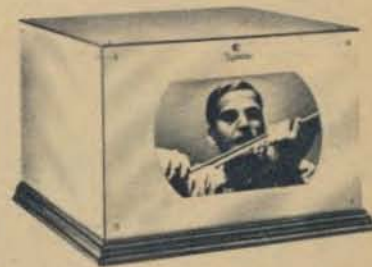
F. SIGHTMASTER —15" direct view, all mirror "Pandora 15" model $675.00