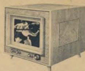
B. VIDEO CORP. —135 square inch, direct view, inspired cabinet design. $459.00