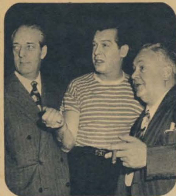
★ TEXACO STAR THEATRE Vaudeville-variety show starring Milton Berle