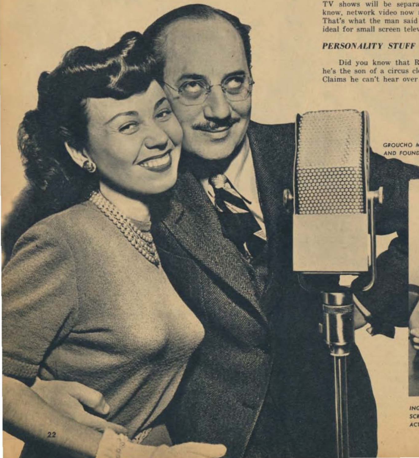
GROUCHO MARX MET PERT CONNIE HAINES IN STUDIO CORRIDOR AND FOUND IT PLEASANT TO POSE FOR CAMERAMAN.

Did you know that Red Skelton's first name is "Richard," that he's the son of a circus clown and that he won't answer a telephone? Claims he can't hear over the things, because "it always sounds like somebody is talking at the other end!"... The suave, sophisticated Basil Rathbone, the new star of CBS' "Tales of Fatima,"