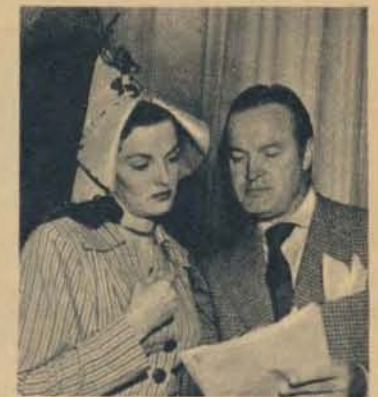
A solemn script moment with his 'Paleface' heroine, Jane Russell.