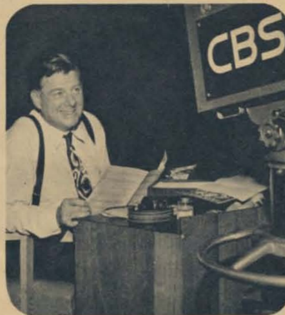
★ ARTHUR GODFREY'S FRIENDS Godfrey again, and his singing "finds."