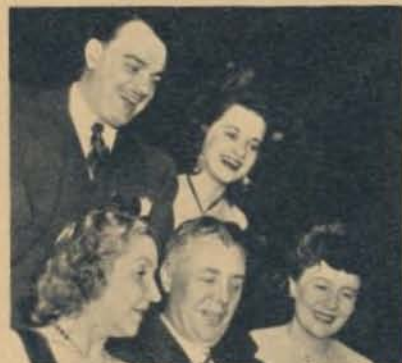
Over eighteen years on the air, Album of Familiar Music rated No. 2 spot.