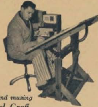
Words and musing by Mel Graff

More unique voice-impression sketches of the nation's jockeys,