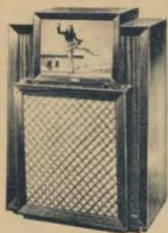
C. FADA —192 square inches, projection view, console mahogany. $849.50