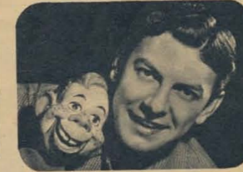
★ HOWDY DOODY —starring Bob Smith and his little friend "Howdy Doody."