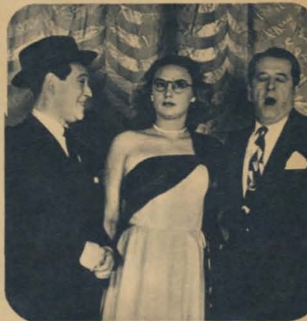
★ PHIL SILVERS SHOW Intimate variety starring comic Phil Silvers