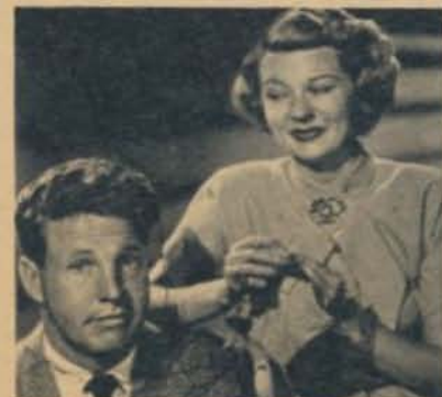
Husband-Wife Team — No. 2. Ozzie and Harriet Nelson tangled in second.