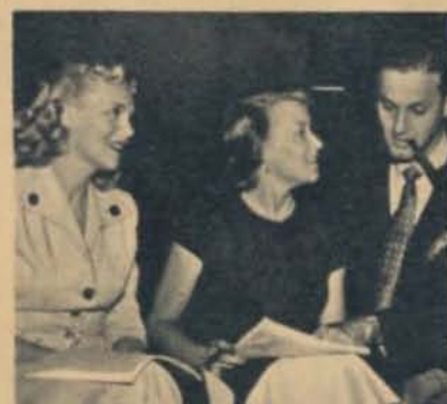
Comedy Show — placed third. Marie Wilson, Joan Banks, writer Cy Howard.