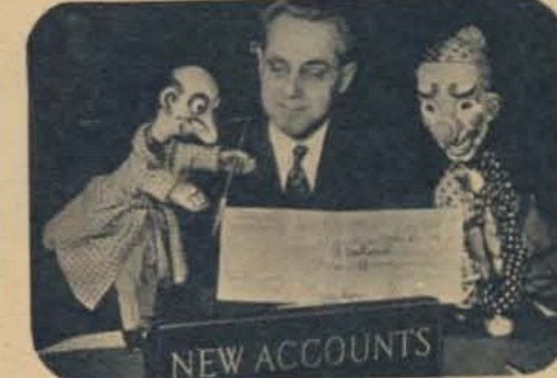
★ LUCKY PUP — two chief characters, Pinhead (left) and Jolo (right) open bank account.