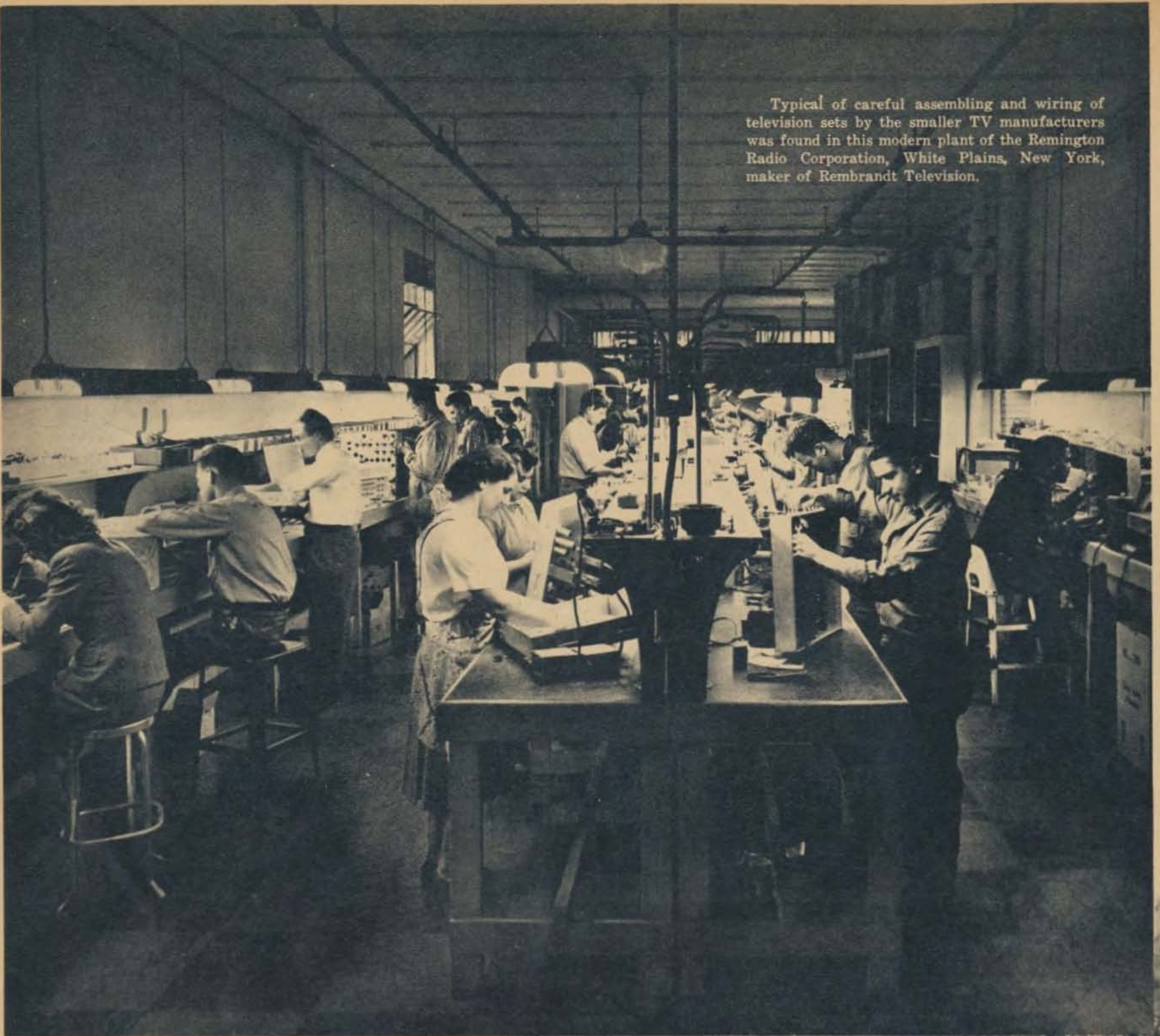
Typical of careful assembling and wiring of television sets by the smaller TV manufacturers was found in this modern plant of the Remington Radio Corporation, White Plains, New York, maker of Rembrandt Television.