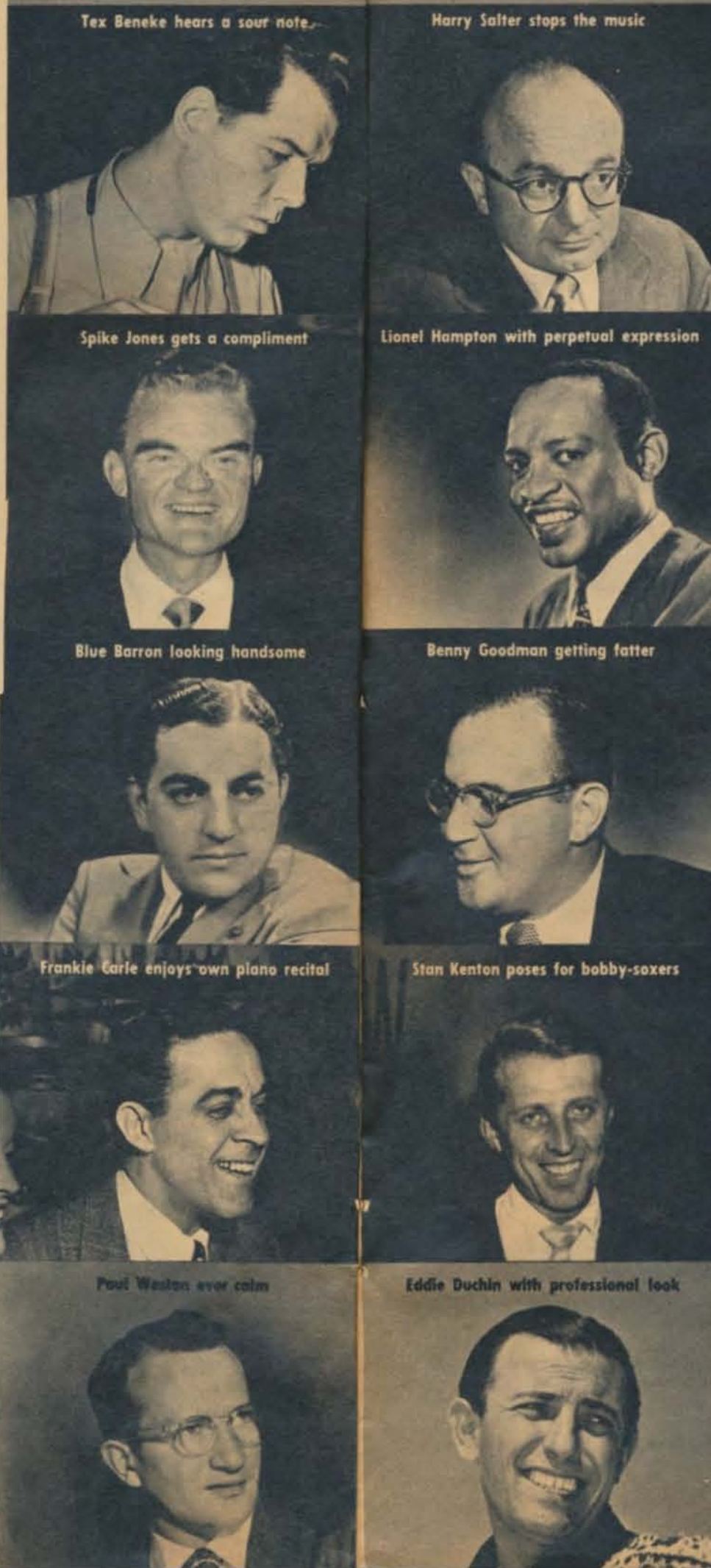
Tex Beneke hears a sour note.