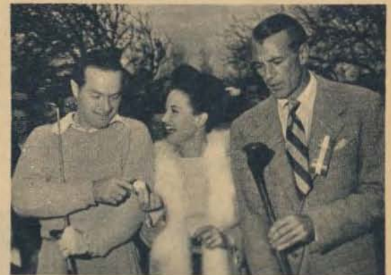
Gary Cooper takes a close look at Bob's clubs as Dorothy Lamour hands him his tee-off pill.

Bob sneaks a glance at the notes Doris Day, RADIO BEST's gal warbler queen, is warbling so prettily.