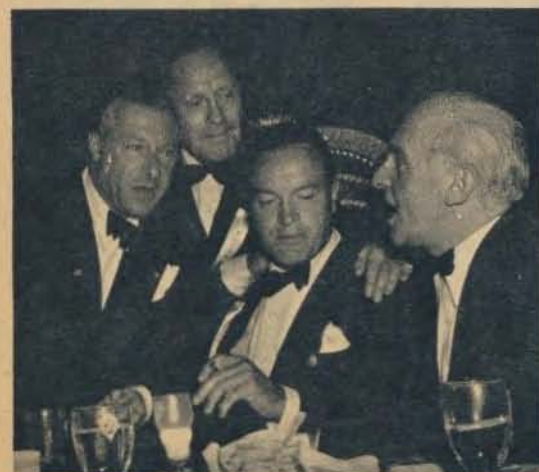
George Jessel, Jack Benny and Bob get an earful of exclusives first hand from Walter Winchell.