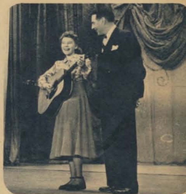
★ ORIGINAL AMATEUR HOUR Amateur-variety with Ted Mack, (Major Bowe's successor)