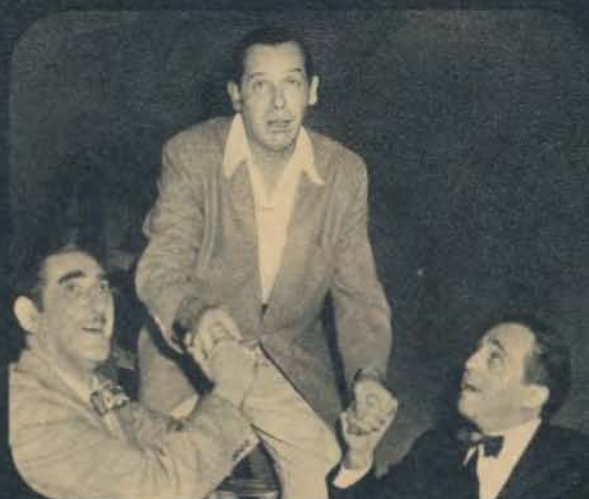
Vaudeville's famous team of Smith and Dale tried this bit of horseplay with Milton Berle during rehearsal of Texaco Star Theatre program.