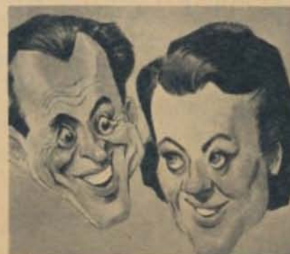
Husband-Wife Team — No. 3. Fibber McGee and Mollie placed third in race.