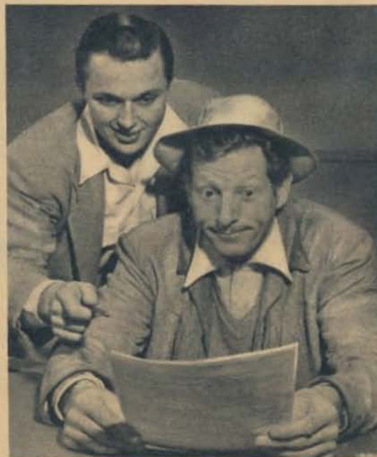
COMEDIAN DANNY KAYE IS A LITTLE PERPLEXED WITH INTERVIEW SCRIPT PREPARED BY BILL STEWARD OF "MEET THE STARS" SHOW.