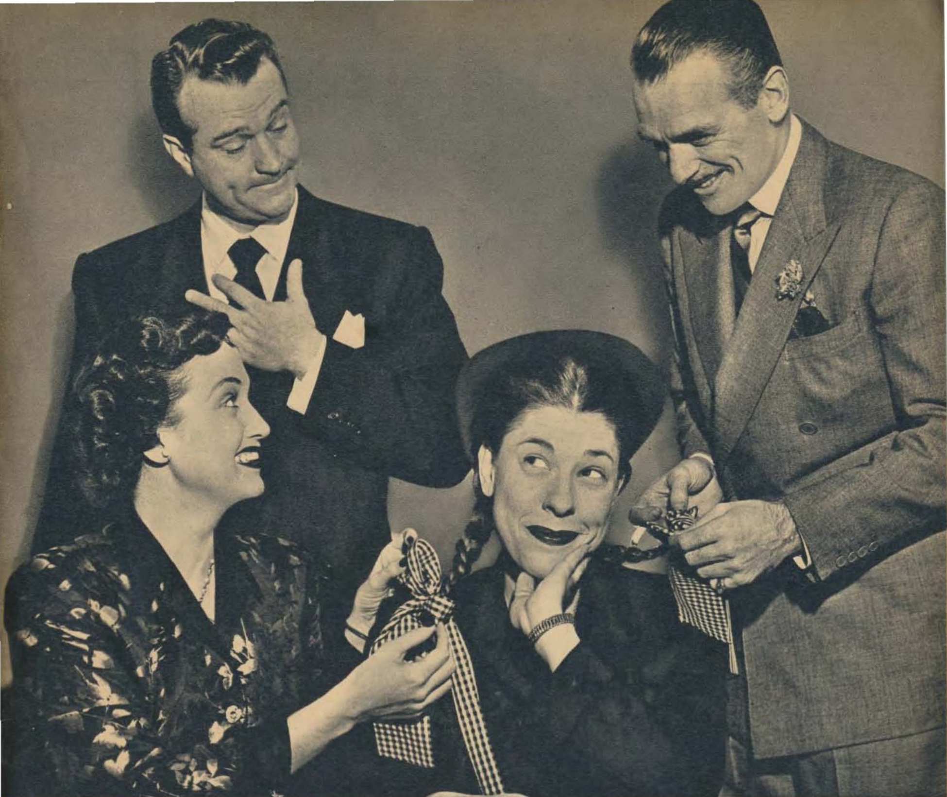
DOTTIE LAMOUR (SEE COVER) AND DOUG FAIRBANKS FIX JUDY CANOVA'S PIGTAILS TO DELIGHT OF RED SKELTON.