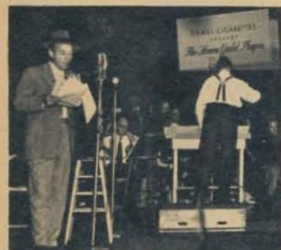
Bing Crosby was star of this one on Screen Guild Players, rated No. 3.