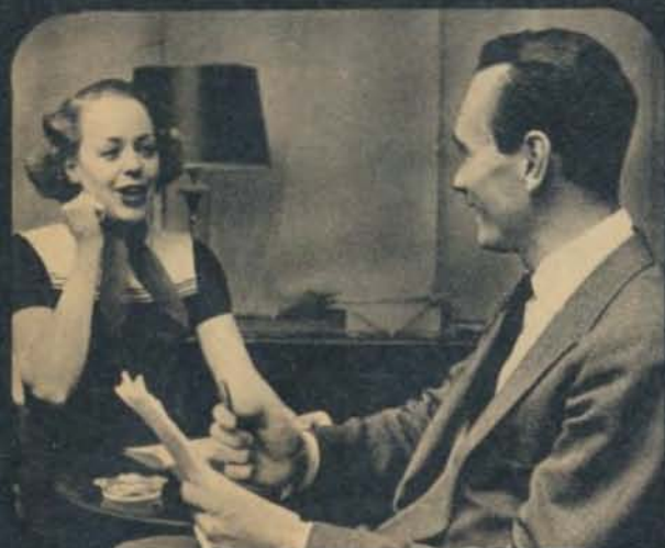
Actress Virginia Gilmore and her husband Yul Brynner team up for TV's first daily "Mr. and Mrs." program. Their show is called "We're On," and they still were on at this writing.