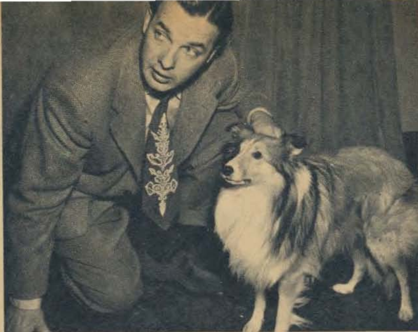
BOB CROSBY FOUND A NEW ADMIRER DURING ONE OF HIS RECENT REHEARSALS. SHETLAND SHEEPDOG DIDN'T ASK FOR AUTOGRAPH.

Where the day Edward "Mr. President" Arnold was served with papers in the divorce suit filed by his Missus, he was facing the cameras in a new movie called—yes, "Dear Wife" . . . Where an actor who is something of a hobbyist admitted that his favorite "collectors items" were just a few things like money . . . Where it's Sam Goldwyn who insists that "any man who bothers with a psychiatrist should