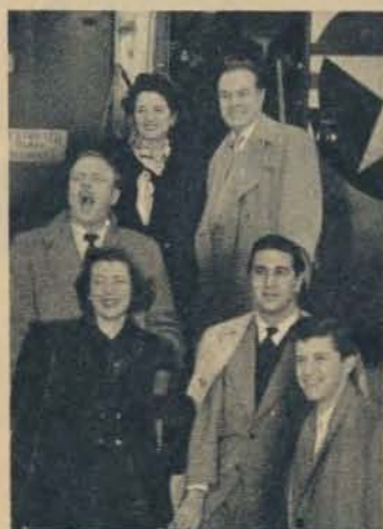
Off again, this time to Germany to entertain our air lift crews.