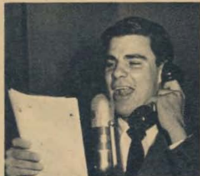
Emcee Bert Parks, top quizmaster, also heads Break the Bank, No.2 quiz.