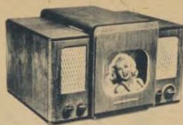
A. AIR KING —52 square inch, direct view, veneered mahogany cabinet. $369.50