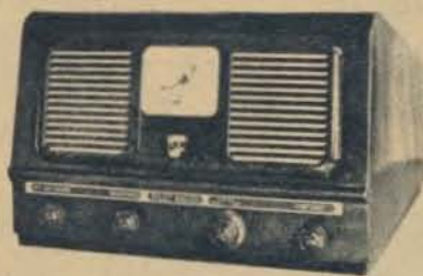
D. PILOT —low priced portable. Small direct view. AC only. $99.50