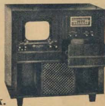
K. INDUSTRIAL —72 square inch, direct view, AM-FM, phono. $695.00