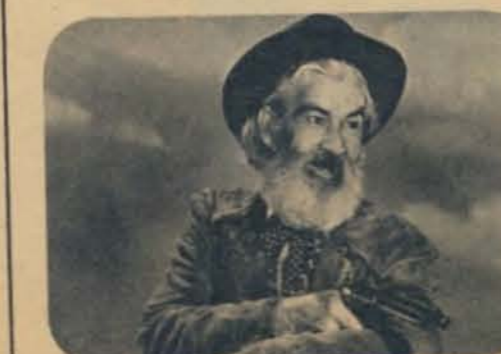
★ WESTERNS — Straight-shooting cowboy pictures are kids' favorite. Here's Gabby Hayes.