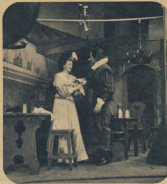
★ PHILCO PLAYHOUSE Drama program featuring nation's top stars