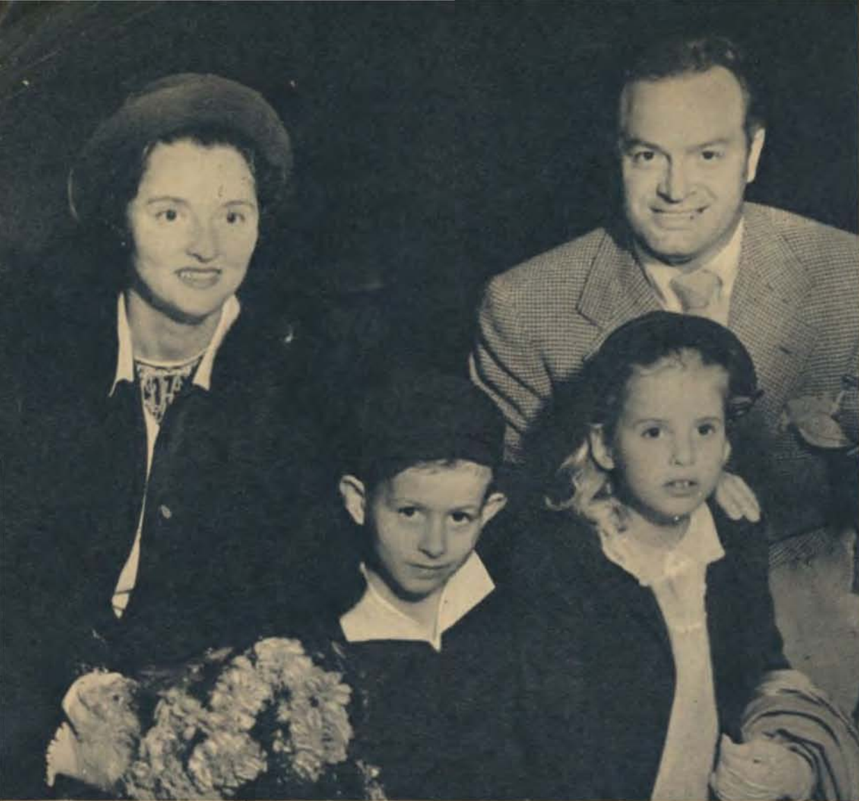
With Bob hopping off on one tour after another, it's not the easiest thing to get the Hopes together, but here they all are, the globe trotter, his wife, Dolores, and the two young Hopes, Tony and Linda.