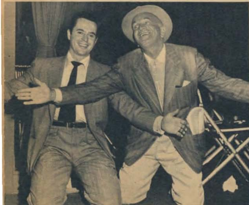
FIRST PHOTOGRAPH OF LARRY PARKS TOGETHER WITH AL JOLSON. LARRY WAS GUEST ON AL'S SHOW.

There's no truth to the rumor that ABC's Anna Roosevelt has established a Hollywood residence as a prelude to running for public office. Says Anna, "I'm doing a radio program three times a week, editing a national magazine and my free time is spent with my