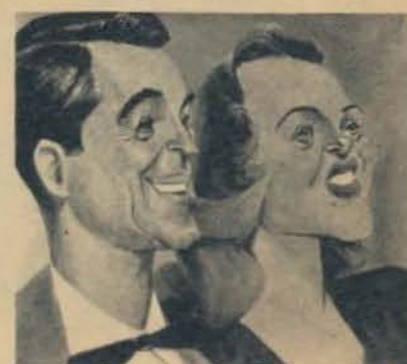
Perry Como and Jo Stafford, popular singers of third place Supper Club.