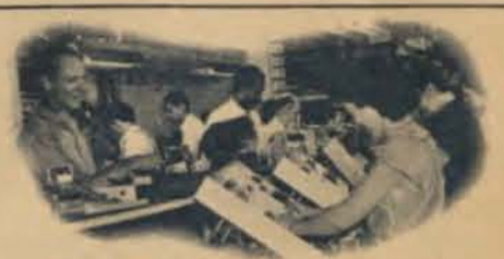
Trained technicians test component parts for many hours along special assembly line. Latest equipment, some developed in the Remington plant, re-tests parts for faultless reception.

The tubes are counted out for the visitor. "... twenty-two, twenty-three, twenty-four!" It is Mr. Kramer's contention that television started with too many tubes, just as radio did a full generation earlier. Remember when some radio manufacturers loaded their sets with dummy tubes to give an awesome impression of power? While some buyers are still impressed by a large number of tubes, the path of progress is towards ever fewer tubes. Fewer tubes make for better performance, a cleaner job and less breakdown. The first commercial T-V sets were nearly all 30-tubers. But back in 1946, before the first Rembrandt set was sold, Mr. Kramer's engineers were working on 24-tubers and that is what has been coming off the assembly benches in White Plains. It wasn't until last