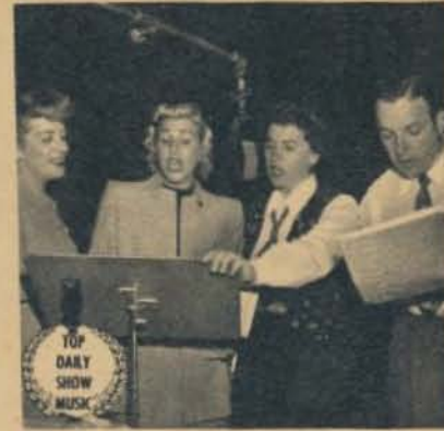
The Andrew sisters and Bob Crosby are popular stars of Club 15, daily musical show chosen first in its class.