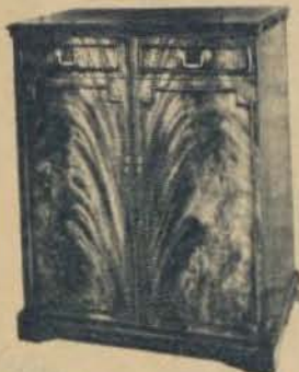
G. STARRET —12" direct view, AM-FM, radio and phonograph. $795.00