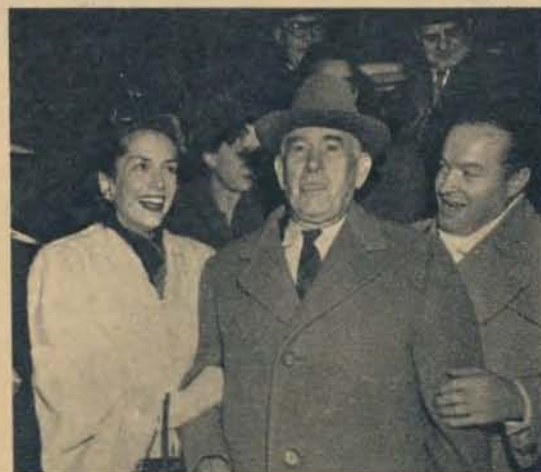
Jinx Falkenburg and Bob drop out of skies with Vice President Barkley on return from overseas.