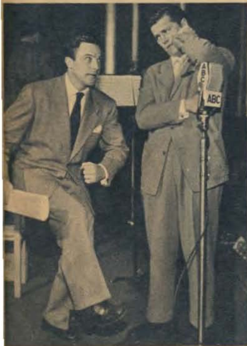
GENE KELLY SHOWS GORDON MacRAE HOW TO GET OFF ON THE RIGHT FOOT WHEN BREAKING INTO A DANCE.