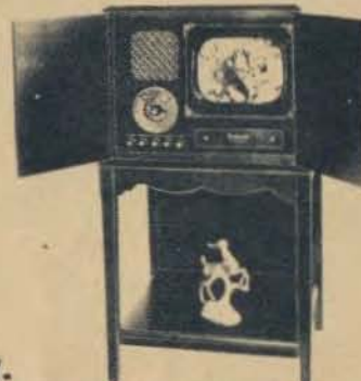
I. REMBRANDT —12" direct view. FM radio. Five cabinet styles. $425.00