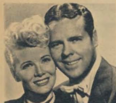
Comedy Show — placed second. Blondie with Singleton and Lake.