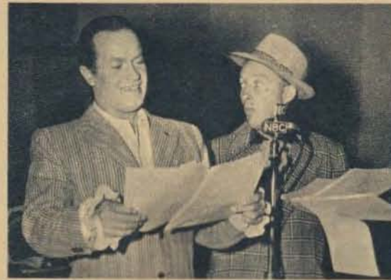
Even Der Bingle was shocked when Bob showed up in this version of today's smartly dressed man.