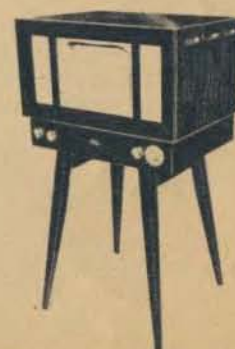
L. MARS —80 square inch, direct view, FM, table model, legs extra. $449.50