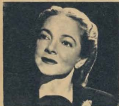
Helen Hayes represents calibre of stars on Theatre Guild on the Air, rated No. 2.