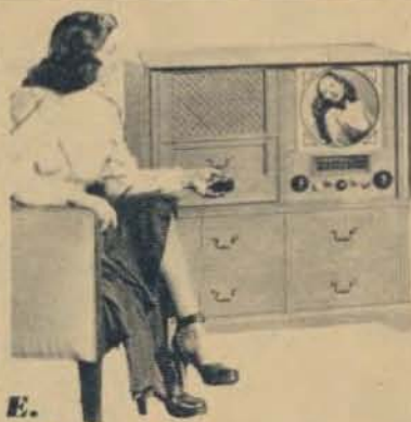
E. GAROD —Many features, remote control, record player, etc. from $599.50