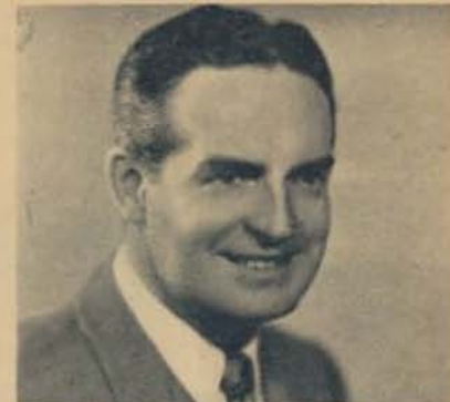
The Fred Waring Show, starring the maestro himself, came in second.