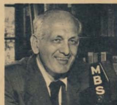
Commentator — placed third. Optimistic news reporter Gabriel Heatter.