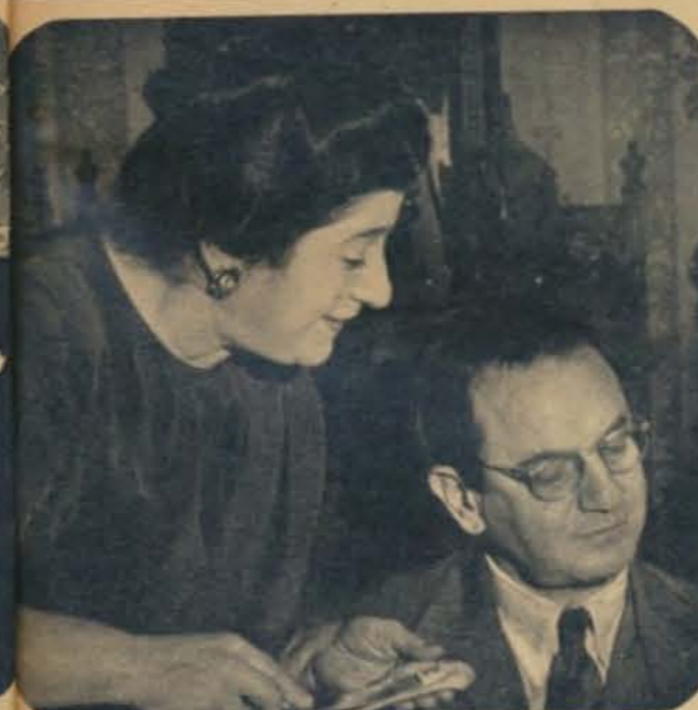
★ THE GOLDBERGS Comedy-drama stars Gertrude Berg and Philip Loeb