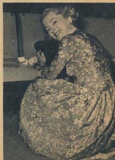
JOAN FONTAINE SEARCHES FRANTICALLY FOR A PENCIL DURING REHEARSALS ON CBS' RADIO THEATRE.