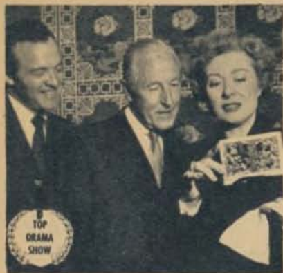
Stars like Van Heflin and Greer Garson, shown with producer William Keighley, make Lux Theatre No.1 favorite.