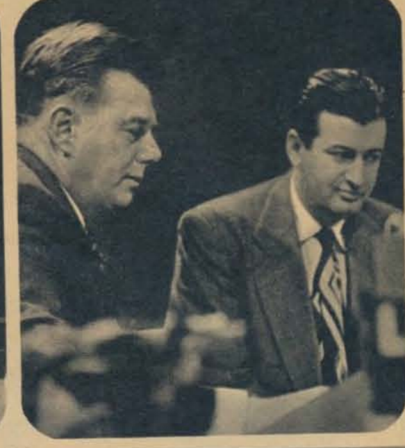
★ TALENT SCOUTS Professional-variety emceed by Arthur Godfrey