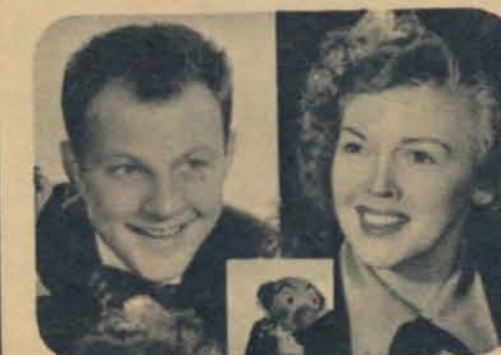
★ KUKLA, FRAN & OLLIE —Burr Tillstrom is puppeteer, Fran Allison, emcee.