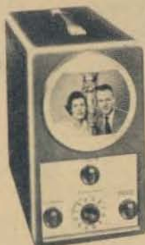
H. TELEPHONE —Low priced portable. 7" direct view. Built-in aerial. $149.95