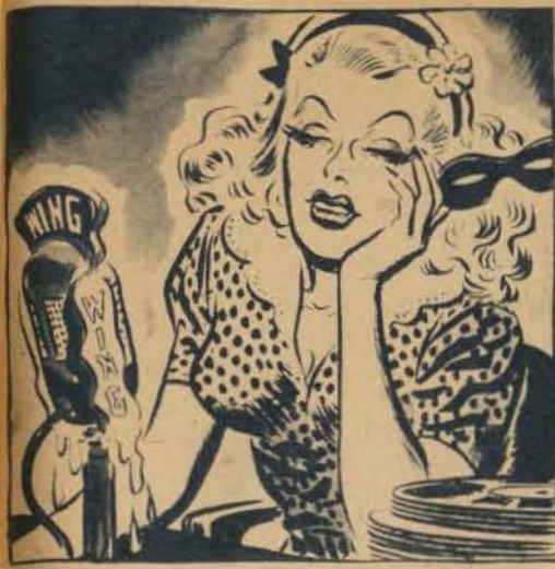
"Lonesome Gal"... WING, Dayton, Ohio