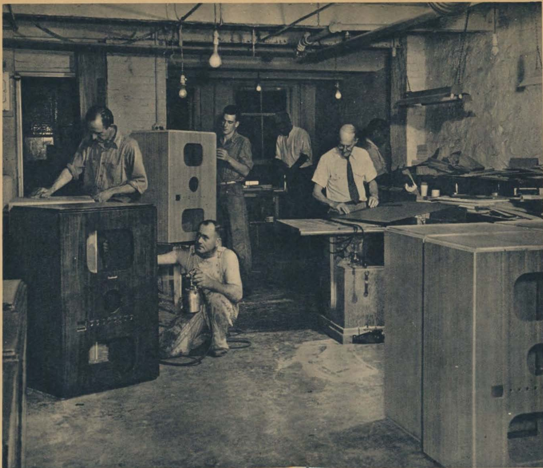
Competing with the tremendous resources of nationally advertised products, the small manufacturer takes special pride and care in the almost lost art of cabinet making. Here Remington craftsmen put finishing touches to Rembrandt cabinets.