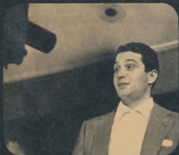
Crooner Perry Como has successfully brought his famous "Supper Club" show to the video screen. Perry's easy, informal style is a TV click.