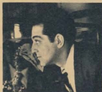
Robert Merrill, star of third place classical program, RCA Victor Show.