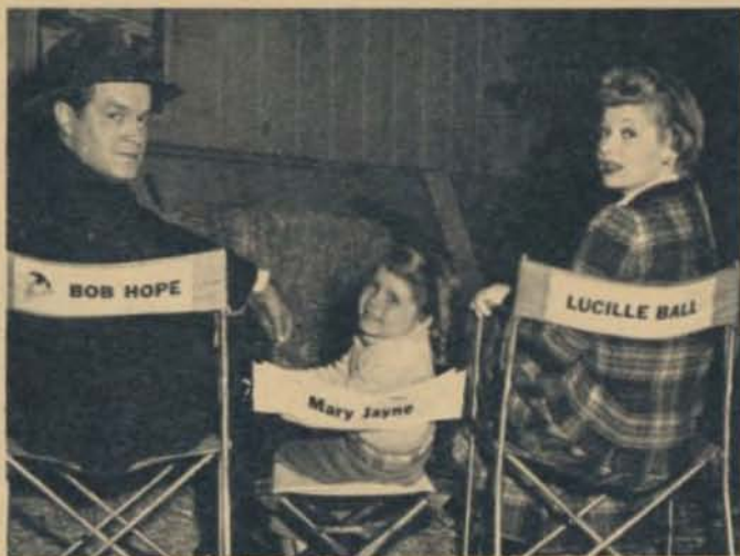
Three principals in movieland's humorous saga of "Sorrowful Jones" based on late Damon Runyon's story about Broadway.