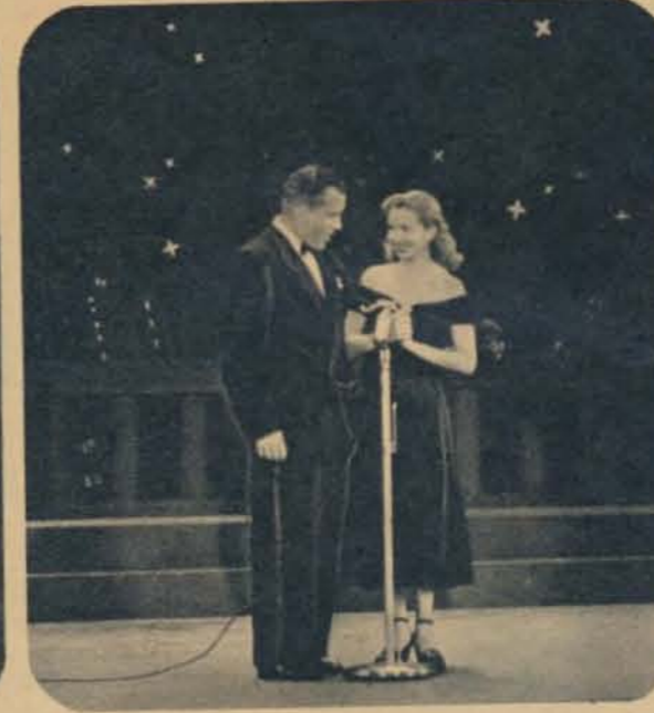
★ TOAST OF THE TOWN Vaudeville-variety originated by Ed Sullivan