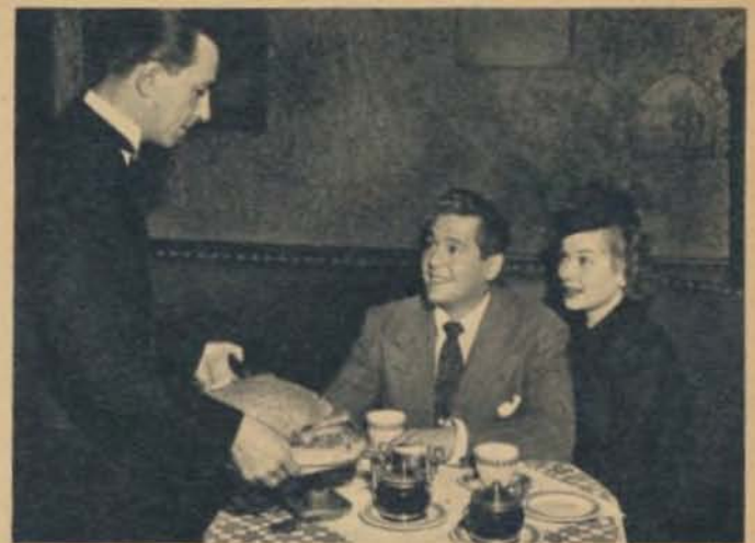
Lucille joining her favorite husband in New York for a brief whirl about the metropolis dine out at the "Twenty One" club.