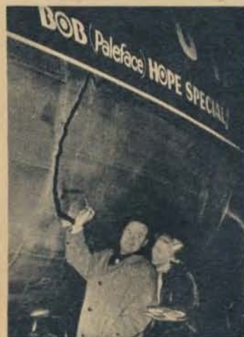
He's in the air so often, they've even named an airliner after him.

He labors indefatigably at being funny and, unlike other comics, derives a vast joy out of it. He is a great gagster, an incomparable ad libber, a man with a bright and brassy humor who is unhappy in repose. Luckily, he is kept