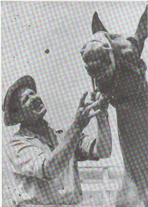
It must have been an Uncle Fud story that made this mule Hee-Haw.