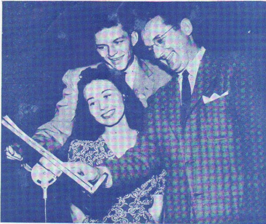
Tommy Dorsey (right) NBC's "Sentimental Gentleman of Swing," goes over the script of his new series with his featured vocalists Connie Haines and Frank Sinatra. Tommy and his popular gang are heard over the NBC-Blue network Thursdays in a musical show called "Fame and Fortune."