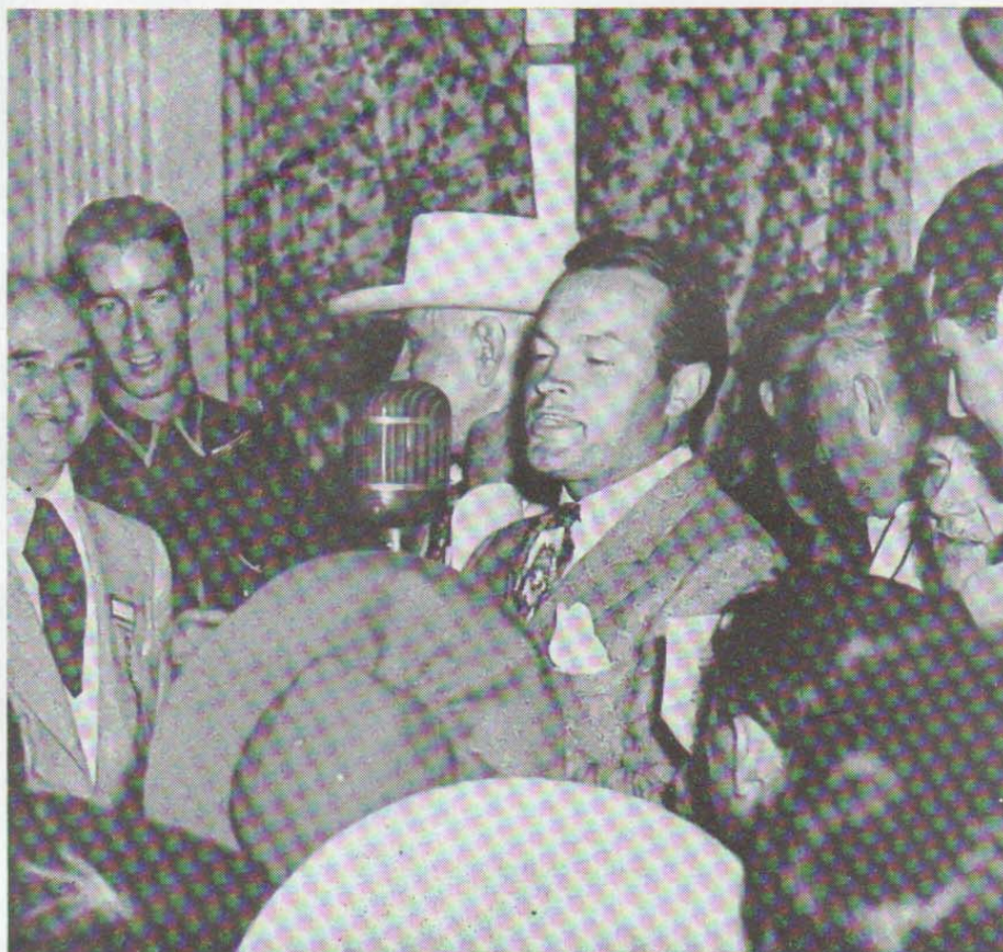
Bob Hope, Pepsodent's ether salesman, speaks his part while the slightly baldish gent on the left looking on is Samuel Goldwyn.

weeks ahead. The entire reception crew of local dignitaries were on hand to greet the three airplanes and their platinum-plated contents. Texas Rangers sat astride their steeds with alertness while the mayor and his company hung on to their steeds for dear life and hoped for the best.