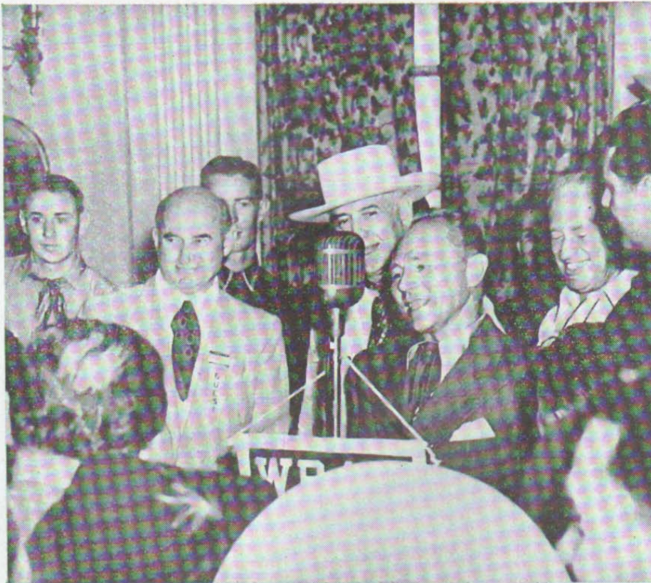
Here we see Film Star Charlie Ruggles with Publisher Amon Carter in white hat.