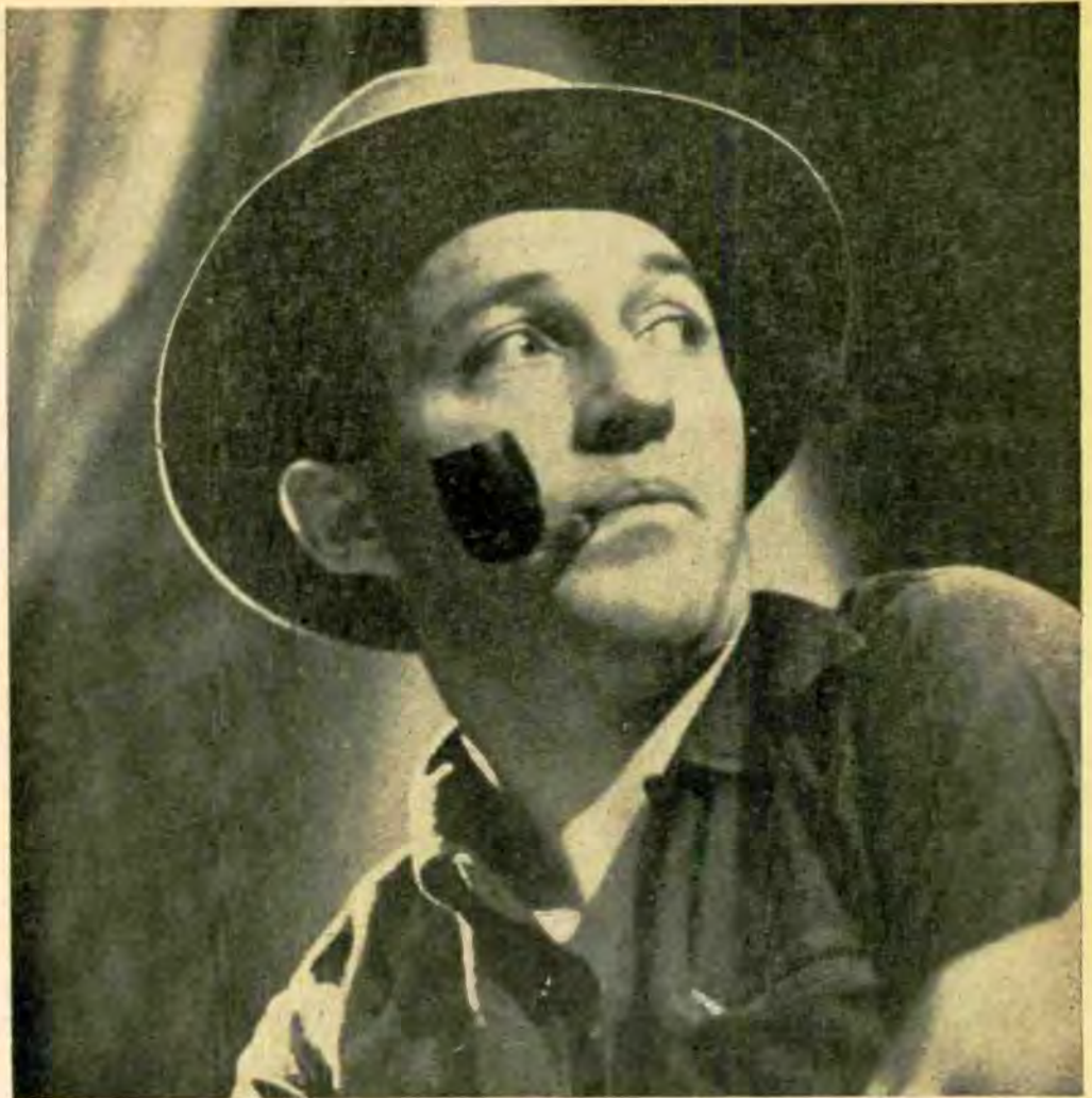
Bing Crosby, star of the Kraft Music Hall which is heard over NBC each Thurs. at 9 p.m. (CST).