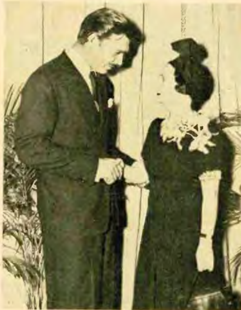
Margaret Mitchell, author of "Gone with the Wind" meets her real-life Rhett Butler. Clark Gable pronounces her "the most fascinating woman I ever met".