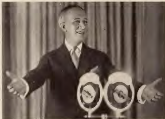
Former Governor Smith before the Mike

The thrill of hearing voices and music on the other side of the Atlantic was but one phase of activity in the greatest year of radio. For the first time, the ceremonies incident to the inauguration of a President of the United States were carried