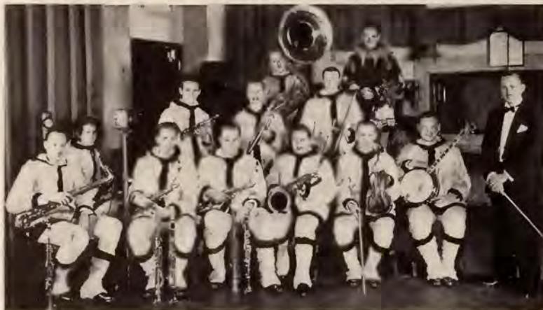
The Clicquot Club Eskimos, Whose Dance Music I Enjoy

However, radio in those days was in a purely experimental stage. As yet no definite radio technic had been evolved, and little had been learned of the real possibilities of this new medium. For this reason, the majority of programs consisted of vocal or