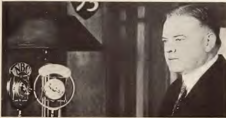
President Hoover Addresses the Nation

Company, had its premier over the air, with a distinguished audience of critics and musicians. Sir Harry Lauder made his microphone debut, John McCormack returned to the microphone after an absence of three years, and practically every opera and concert star and almost every distinguished musician performed