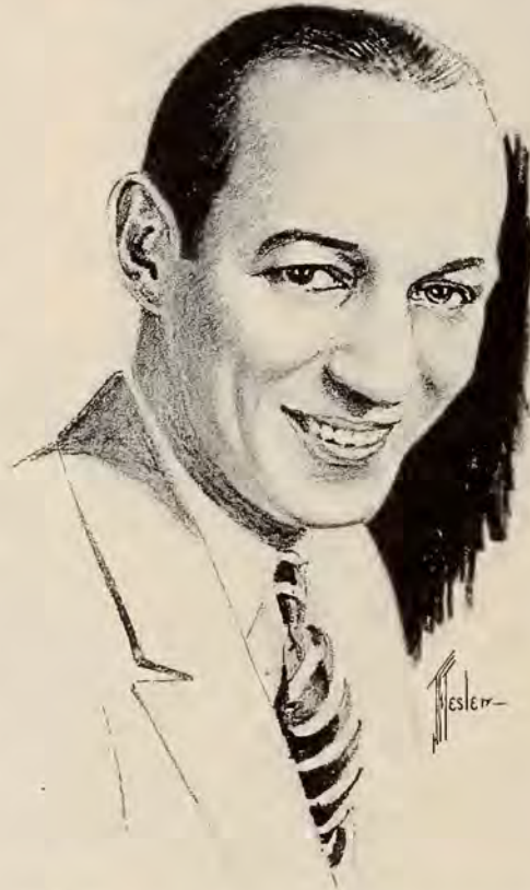
Ted Husing, who covers sporting events better than anyone on the air