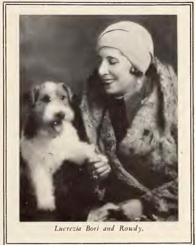
Lucrezia Bori and Rowdy.

"I like radio broadcasting enormously," she told me the other day. "I think it is the best reproducing medium we have. And I have received so many thousands of pleasing letters from great distances. Instead of the applause that is generally, I am very happy to say, bestowed