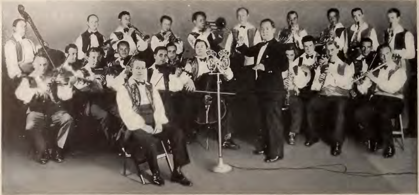
The Gypsies as They Now Appear, One of Radio's Finest Salon Orchestras