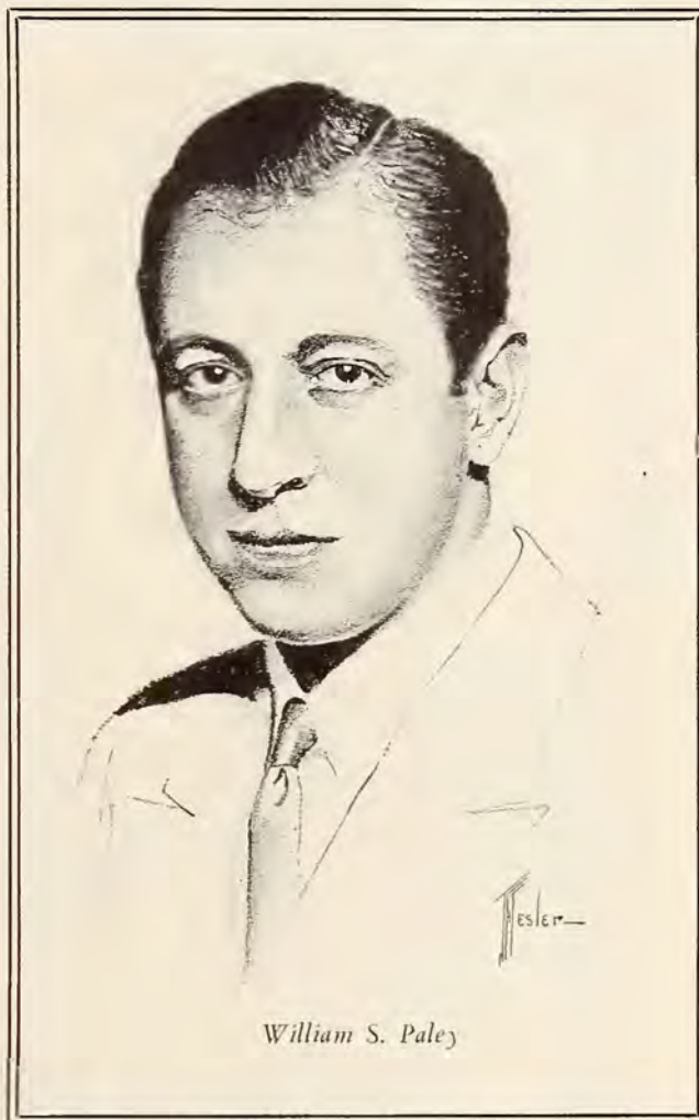
William S. Paley

With the recent granting of a license for increased power to WABC, key station of the Columbia network,