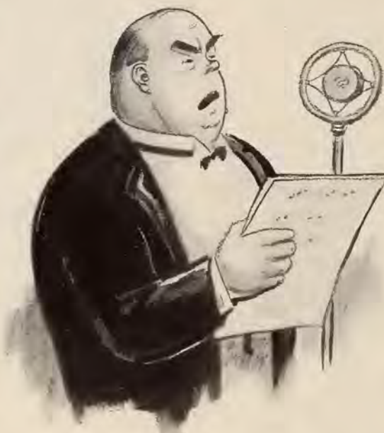
The Sweet-Voiced Tenor of the Air.

to be thrilled as greatly as I was when I saw her in Manon . She was superb.