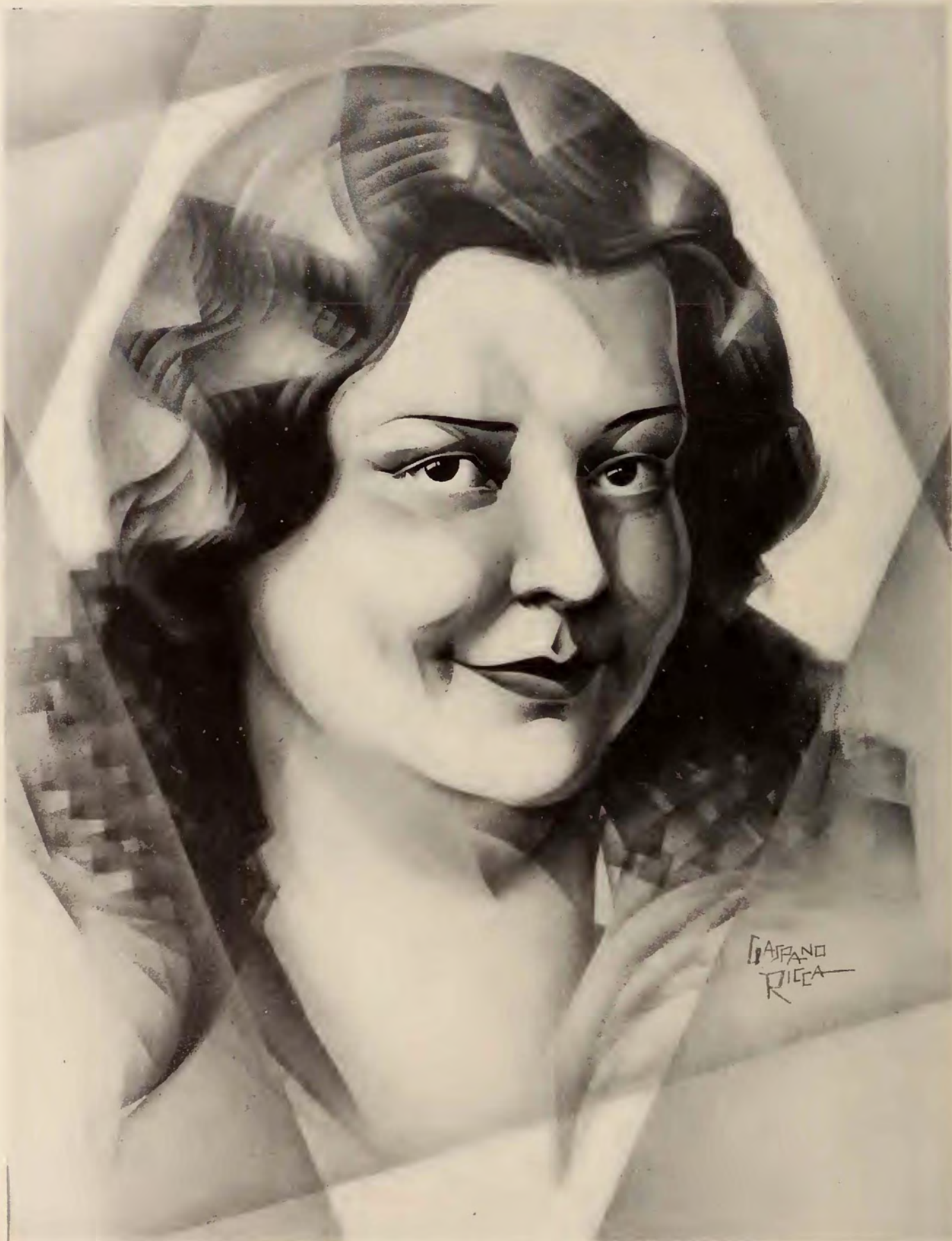
Vaughn de Leath, the "Original Radio Girl"