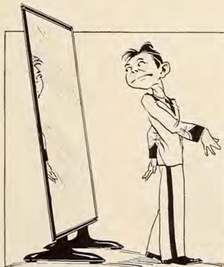
I've been getting fitted into my new uniform

Even after she made the trip to California and found everyone out