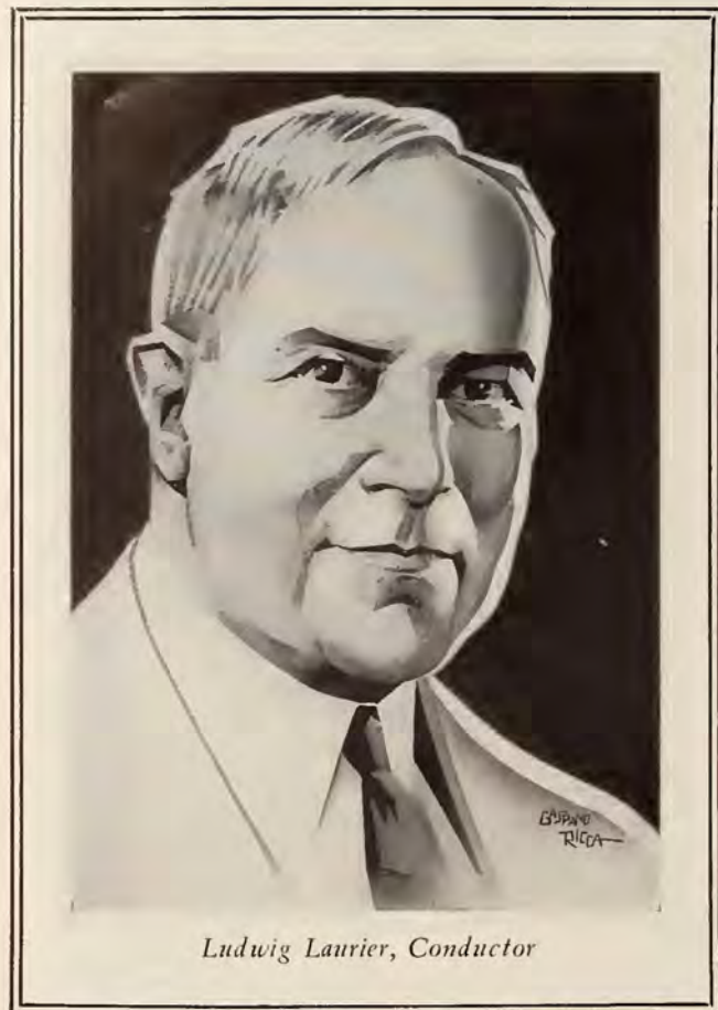
Ludwig Laurier, Conductor

“‘SLUMBER MUSIC’ is it? Why I’d stay up all night to listen, if they’d play that long!” That’s the comment of one discriminating listener on the alleged soporific effect of the NBC’s nightly “Slumber Hour.”