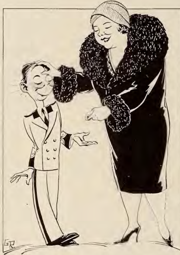
She looked at me and gave me a great big smile.