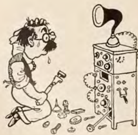
Mr. Hansom in a characteristic pose

handed condenser microphone and that only the carbon type of "mike" could be used. Yet, so great is the superiority of the left-handed mike over the type generally in use that it has been considered practicable to junk