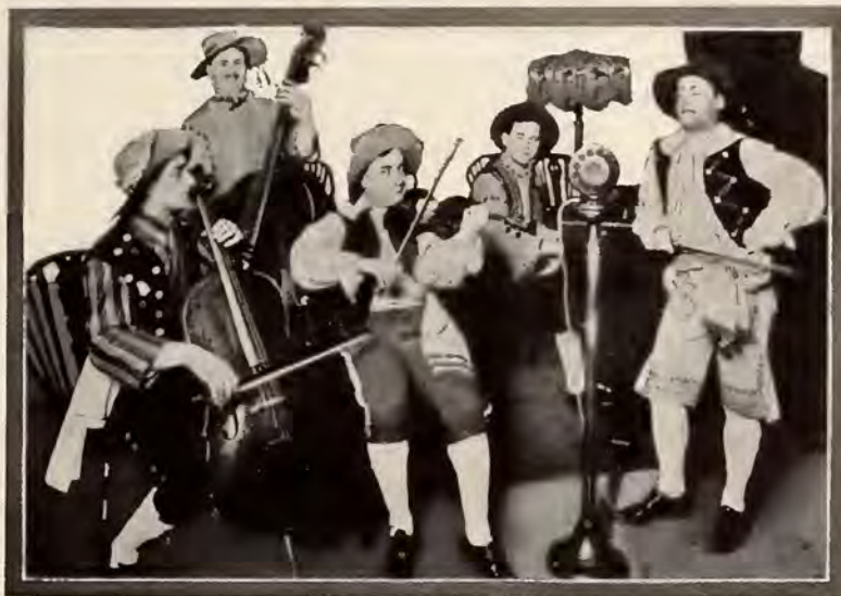
The A. & P. Gypsies as They First Went on the Air

The A. & P. Gypsies, as they were christened, first appeared on the air in the Spring of 1924. Their programs were made up entirely of these Russian and Hungarian