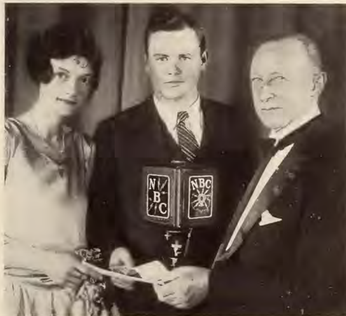
A. Atwater Kent Presenting Checks to Winners.