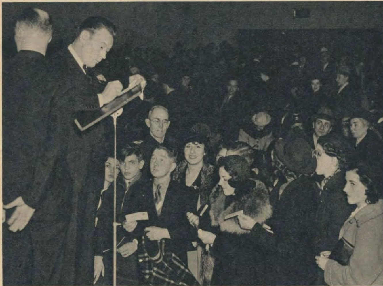
First thing Fred Allen himself does at the close of his 9 p.m. (EST) Wednesday evening broadcast from New York is to sign autographs for the scores of admirers who

cluster around the stage of the studio from which the show is aired. This usually takes ten minutes. Meanwhile other members of Town Hall have hastened away