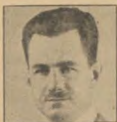
LOWELL THOMAS "Sun Oil" news commentator Tues. 5:45 pm CST (4:45 MST)