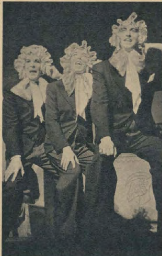
Among guests were "The Tune Twisters," who hurried to appear on Broadway in "Between the Devil" between their two Town Hall shows