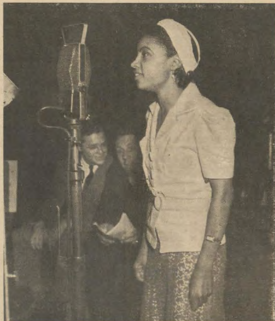
Maxine Sullivan, the Negro entertainer in New York's Onyx Club who raised such a rumpus over her swing version of "Loch Lomond," will do a bit of hot warbling with the Steinie Bottle Boys Swing Club on NBC-B Thursday