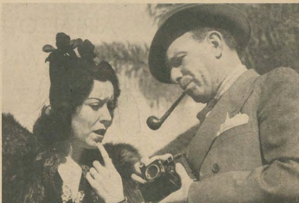
George Burns shows Gracie Allen the self-timing gadget of his camera which permits a person to photograph himself. These comedians introduce a new bandleader to their audience Monday at 8 p.m. EST and 7:30 p.m. PST on NBC-Red. That's the date Jan Garber succeeds Ray Noble