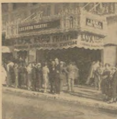
The Lux Radio Theater, presided over by Cecil B. DeMille, was voted second. It is on CBS Mondays at 9 p.m. EST

This week the poll for singers of popular songs is being held. The ballot for this poll appears on the inside front cover of this issue. Your votes can help your favorites win!