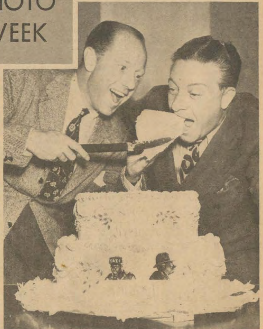
A couple of ten-year-olds, Amos 'n' Andy eat cake to celebrate a decade in radio as the famed dusky pair. Amos (Freeman Gosden), at left, and Andy (Charles Correll) were honored with a plaque signed by CBS & NBC heads