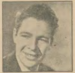
KENNY BAKER "Jell-O Program" tenor Sun. 6 pm CST (5 MST)