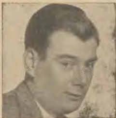
ARTHUR GODFREY "Barbasol Program" vocalist Fri. 6:15 pm CST (5:15 MST)