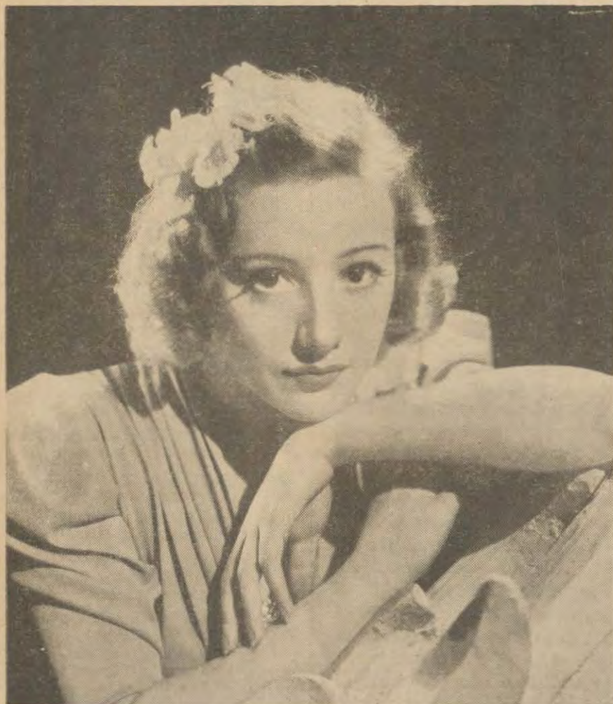
Franciska Gaal, young Norwegian movie actress who played opposite Fredric March in "The Buccaneer," will be Al Jolson's guest Tuesday at 8:30 p.m. EST on CBS. Victor Young, as usual, makes music for the gang