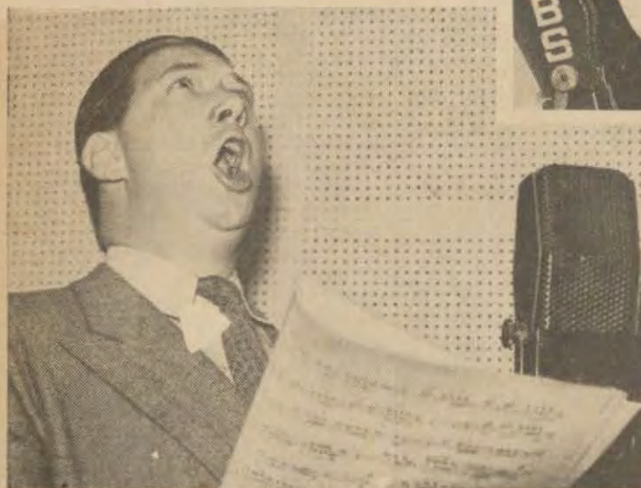
When Harry von Zell first went on the air it was as an announcer. Since then he's become an excellent foil for Fred Allen; acting, stooging, and trying to sing!