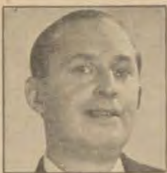
BEN BERNIE "U.S. Rubber" orchestra leader Wed. 7:30 pm CST (6:30 MST)

Stations which will broadcast these programs may be found in the adjacent program columns at the time hereunder indicated