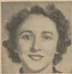
SYLVIA CYDE "Benay Venuta's Program" soprano Sat. 2 pm CST (1 MST)