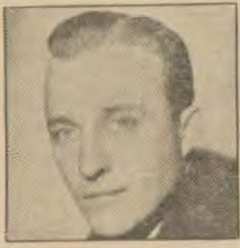
BING CROSBY "Music Hall" singing m.c. Thurs. 9 pm CST (8 MST)