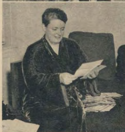
She has worked as a journalist in the world's capitals, studied and traveled widely, but still uses typical mid-western phraseology and inflections in her broadcasting