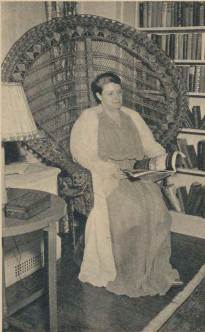
Born on a Missouri farm, Mary Margaret McBride ignored family's wish that she teach, went into newspaper work, now ranks as topnotch radio columnist