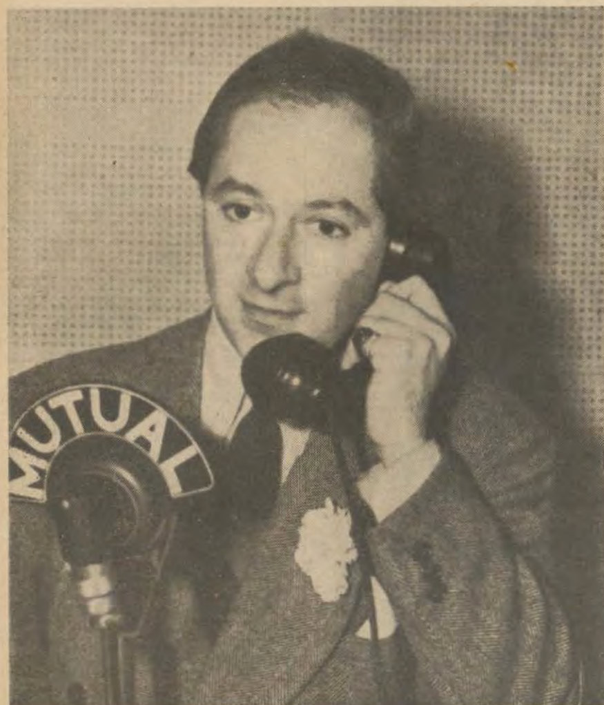
George Jessel's option has been renewed and he is guaranteed another 13 weeks on the air starting Sunday. His program this week, with Norma Talmadge, his wife, will originate in Detroit and is on MBS at 6 p.m. EST