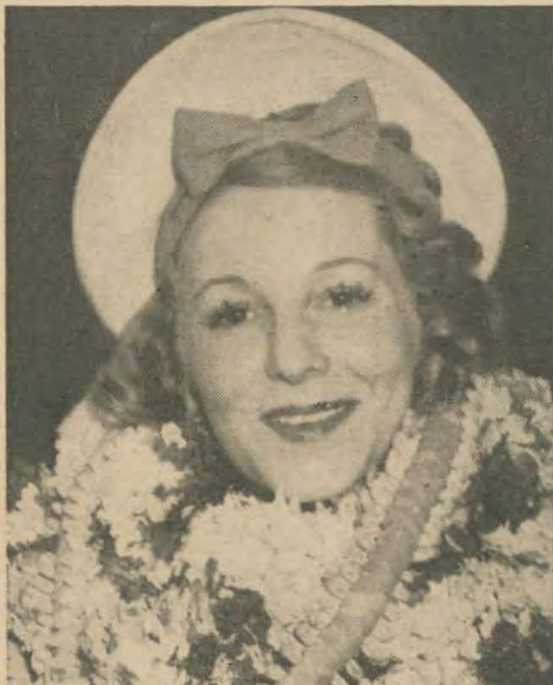
Jessica Dragonette, on her first long vacation after 12 consecutive years on the air, is making a concert tour. Above, as she appeared while in Honolulu