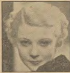
HARRIET HILLIARD "Baker's Broadcast" vocalist Sun. 6:30 pm CST (5:30 MST)