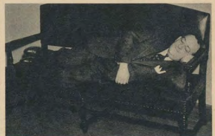
Comedian Charlie Cantor, versatile radio actor, dashes for the nearest lounging-place and stretches out for a nap. Cantor has roles in about twenty major airshows