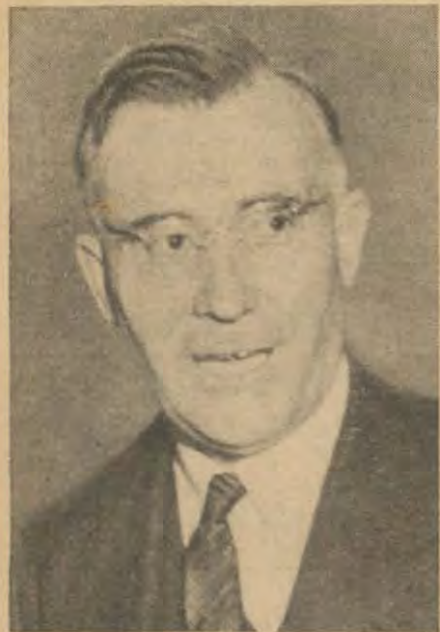
At Station KHJ Dr. Charles Fuller leads the new way to an old faith

S INCE then Dr. Fuller's "congregation" has grown by leaps and bounds, until it is now estimated that he reaches well over five million people each Sunday. He receives from five to seven hundred pieces of mail daily and it increases weekly. Most of it is from listeners who correspond weekly or monthly. All letters request-