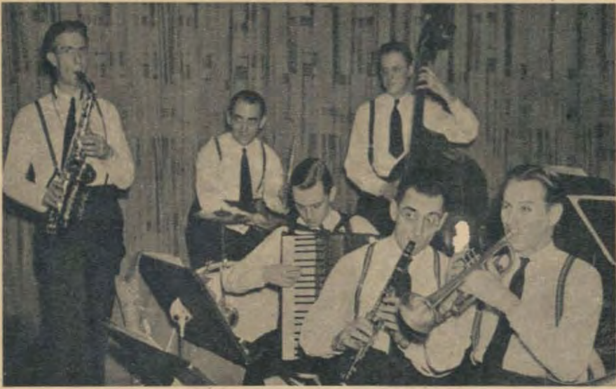
Assorted bandsmen organize a jam session at one side of Town Hall stage, which is in same studio the NBC Symphony used under the baton of Toscanini. Other musicians drift out between shows to 52nd Street night clubs