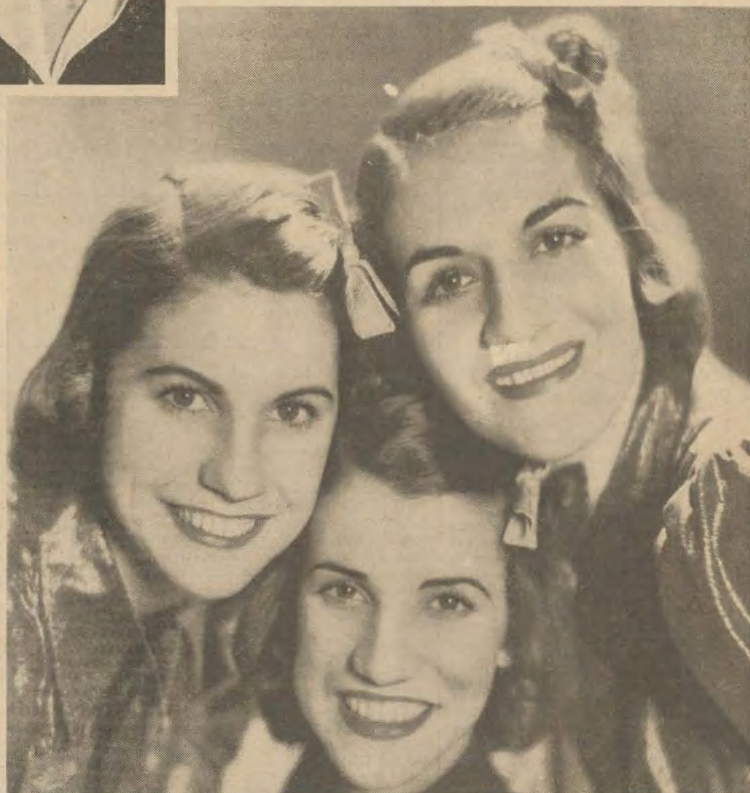
Three girls who are nearing the zenith once reached by the Boswell Sisters trio are the Andrews Sisters, who skyrocketed to nation-wide attention with their recording of Bei Mir Bist Du Schoen. La Verne, Patty and Maxene landed on the "Just Entertainment" show