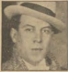
PHIL SPITALNY "Hour of Charm" orchestra leader Mon. 8 pm CST (7 MST)