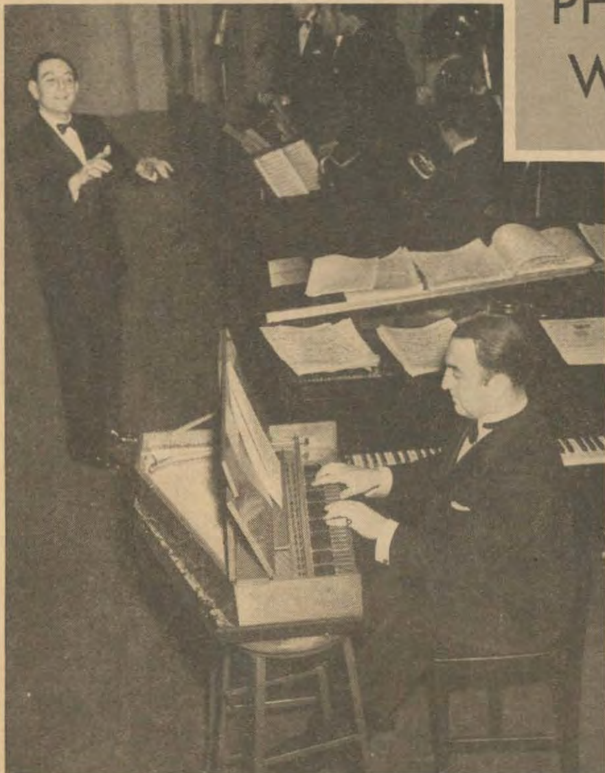
Frank Vigneau, of Guy Lombardo's band, plays a new and unnamed gadget while Lombardo stands in the background, pleased with the results. The Lombardo orchestra is heard Sundays over CBS from 5:30 to 6:00 EST