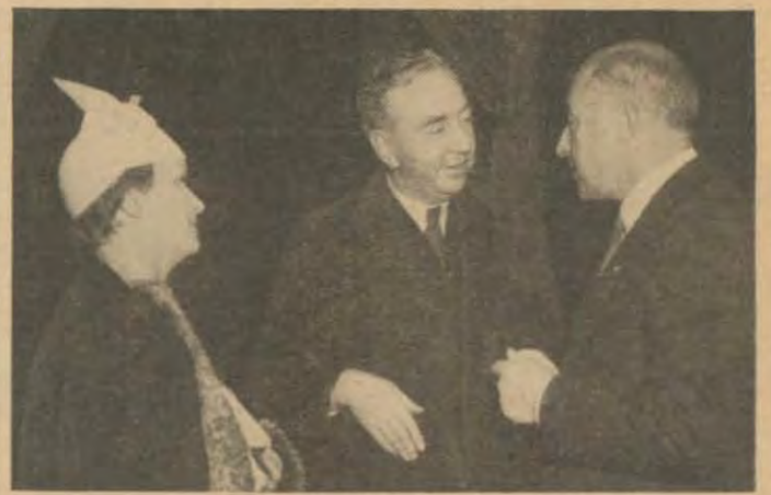
Cecil B. DeMille (right), movie and radio producer and presiding genius of Lux Theater, chats with Lord and Lady Leverhulme, sponsors of the show. He was really delighted