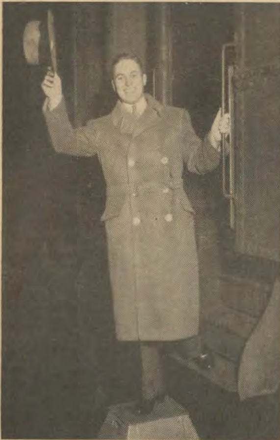
Lanny Ross, whose last program is vacationing, will be on "Your Hit Parade" over CBS Sat.