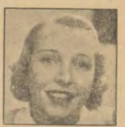
JANE ACE Jane of "Easy Aces" Wed. 6 pm CST (5 MST)