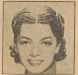
FRANCES LANGFORD "Hollywood Hotel" soloist Fri. 8 pm CST (7 MST)