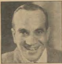
AL JOLSON CBS Comedian Tues. 7:30 pm CST (6:30 MST)