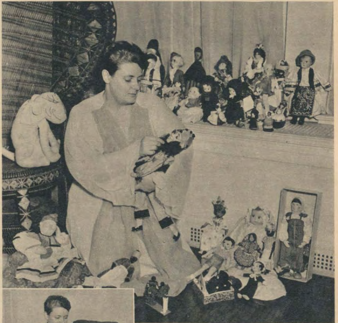
One of the busiest women in radio, she still finds time to indulge a fondness for collecting dolls. Her collection contains more than 200, gathered from many lands