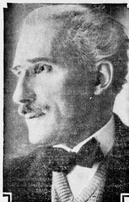
ARTURO TOSCANINI the celebrated musician is guest conductor of the Cadillac symphony in its concert on Sunday, Feb. 11, at 5 p. m. CST over an NBC-WJZ network. Mme. Lotte Lehman, operatic soprano, is guest vocalist.