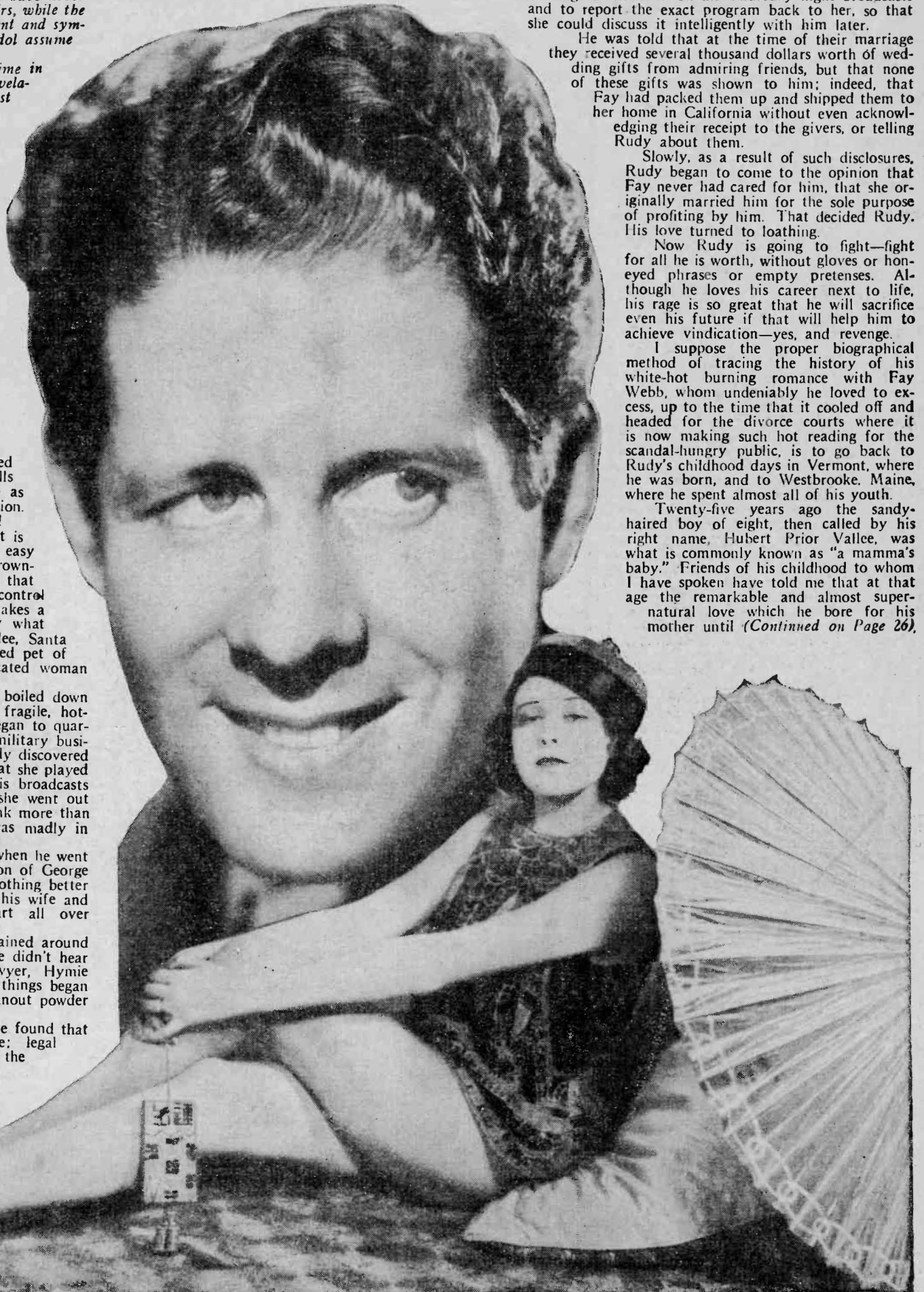
Rudy Vallee, idol of millions, "the crooner with ten million sweethearts"—and the one sweetheart he wanted to hold and couldn't, Fay Webb Vallee

Twenty-five years ago the sandy-haired boy of eight, then called by his right name, Hubert Prior Vallee, was what is commonly known as "a mamma's baby." Friends of his childhood to whom I have spoken have told me that at that age the remarkable and almost supernatural love which he bore for his mother until (Continued on Page 26),