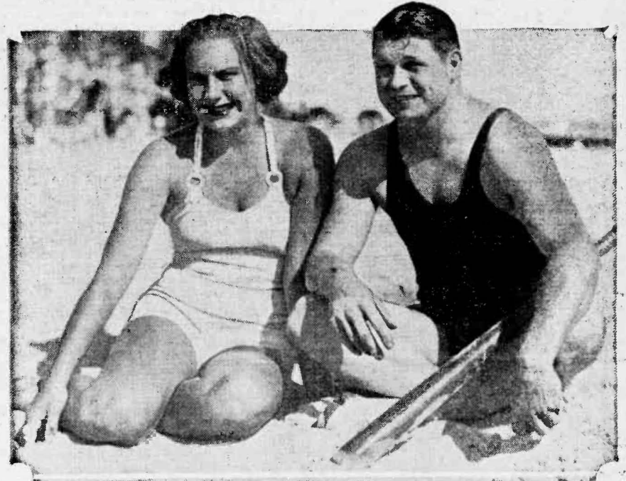
Helene Madison, swimming champion, and Jimmy Foxx, American League home run king, sun on the beach at Miami just prior to their joining four other sports notables as guests of Old Maestro Ben Bernie next Tuesday evening, Feb. 13, at 8 o'clock CST, via NBC.