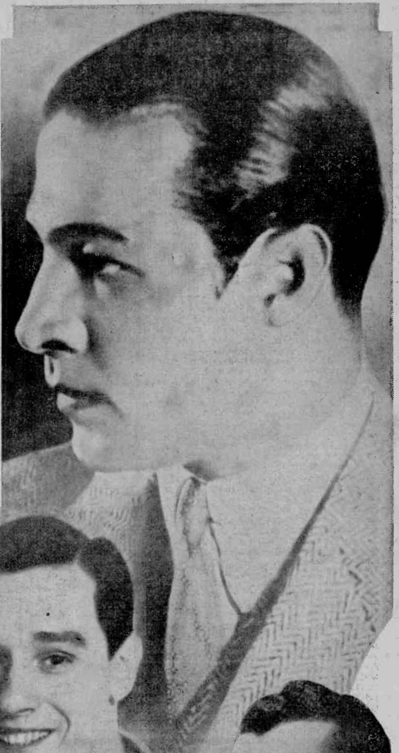
Rudolph Valentino, idol of the entertainment world.