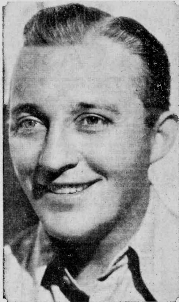
Bing Crosby in the lead for the title, "Star of Stars"