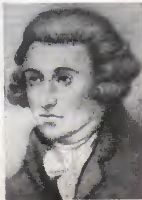
Franz Joseph Haydn's life contradicted that of many of the early masters, in freedom from worry and ease of living—so allowing his genius to blossom in full flower

In 1760, Haydn married a wigmaker's daughter, who succeeded in keeping him profoundly unhappy.