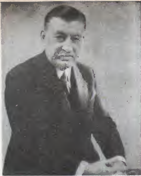
Major Edward Bowes celebrates his twelfth anniversary on the air with the Capitol Family Sunday, November 18th. Tune in any Sunday at 11:30 a. m., NBC-WEAF net

One of the really nice, refined touches you find in the broadcasting business is the idea of the studio hostess. Studio hostesses are different from the regular run-of-the-mill hostesses such as Emily Post describes. They don't meet you at the door, or take your hat and coat, or ask you whether you take lemon or sugar, or any of those things hostesses do in ladies' magazines. They don't wear hostess pajamas, either—more's the pity. And they don't preside at dinner tables, that is, unless you date them out for dinner. No, the studio hostess sits at a desk instead of a tea table, and pours questions and answers instead of tea. Questions like Whom did you wish to see? Does he know you? What broadcast is he on? Will you have a chair? And answers like His line is busy now. She isn't in, He's at a rehearsal and can't be disturbed, That's on the fourth floor, Studio G is occupied, You'll have to write for an appointment.