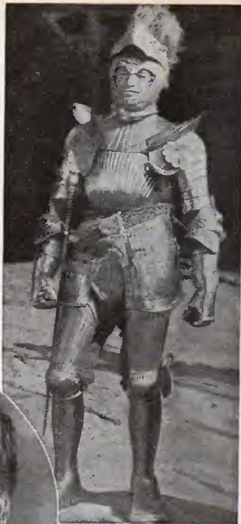
Will as he looked in costume (above) for his screen riot, The Connecticut Yankee . Even his armor could not repress his inimitable quips

Rogers' verve on that memorable afternoon is still the talk of the theater. He gave the "greatest show" of his career, made pointed quips which only his good friend out there would comprehend, and even