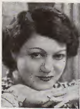
Rosa Ponselle, whose unusual voice may be heard every Monday evening at 9 p. m. EST, over a CBS-WABC network

Rosa Ponselle Is Another Fortunate Person Whose Chosen Vocation Is Her Best Medium of Activity. Let the Doctor Tell Why