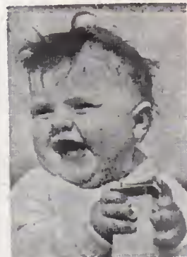
When a child succumbs to stage fright, it is more pathetic than in a grownup. See that your child avoids it

Does Your Child Suffer from Timidity? Its Cause and Cure Are Well Known to Miss Mack