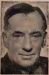
Edgar A. Guest: "I think the American Home is staging a comeback — thanks to radio"

And what has happened? We began to invite people to our homes for an evening of bridge with music or just an evening of music and comedy. They came and they liked it. Our parties took on a new note of warm informality. (Continued on Page 23)