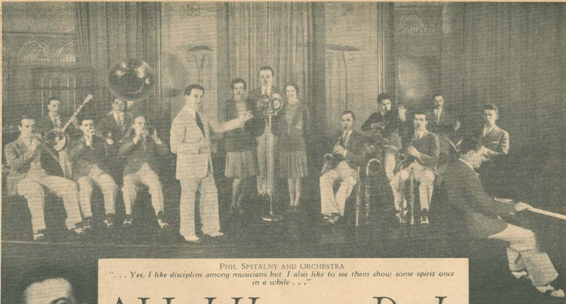
PHIL SPITALNY AND ORCHESTRA

"... Yes, I like discipline among musicians but I also like to see them show some spirit once in a while..."