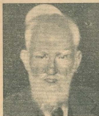
GEORGE BERNARD SHAW

S TOOPNOCRACY may sweep the world! This conclusion may startle and amaze you. And much as I dislike to foment revolution and strife in the ranks of the Stoopnocrats . . . high as my respect is for Col. Lemuel Q. Stoopnagle, I feel that he is in danger, grave danger of being disenthroned.