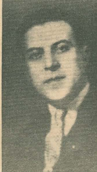
PHIL SPITALNY ... Popular music fascinated me ...

"... Yes, I like discipline among musicians but I also like to see them show some spirit once in a while..."