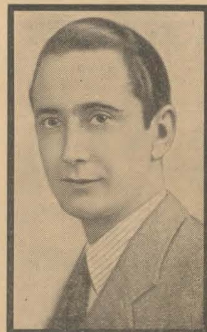
Born in Verona, Italy, was Nino Martini, romantic young tenor on the Columbia network with Howard Barlow's symphony. His range is extremely high.

IN August of 1930, he returned to Italy, with the Zenatellos to prepare an extensive operatic repertoire. After another period of arduous study, he returned to America and made his debut with the Philadelphia Grand Opera Company, singing with Josephine Lucchese and John Charles Thomas in "Rigoletto." So thunderous was the ovation given Martini's rendition of the aria, "La Donna e Mobile," that he was forced to break a precedent of long standing and interrupt the performance of the opera with an encore. When he next appeared with the same company, singing Bizet's "The Pearl Fishers," the program of the evening bore in large letters the inscription, "No Encores Allowed."