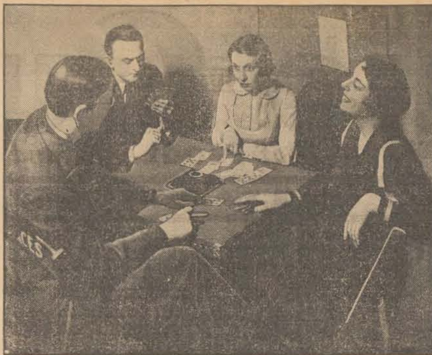
You've often wondered what they look like—the four characters heard during the CBS "Easy Aces" program. Here they are, from left to right: Ace, Jack, Marge and Jane, looking just as they do when their skit takes the air each Monday, Wednesday and Friday at 6:30 p. m. over the Columbia chain.