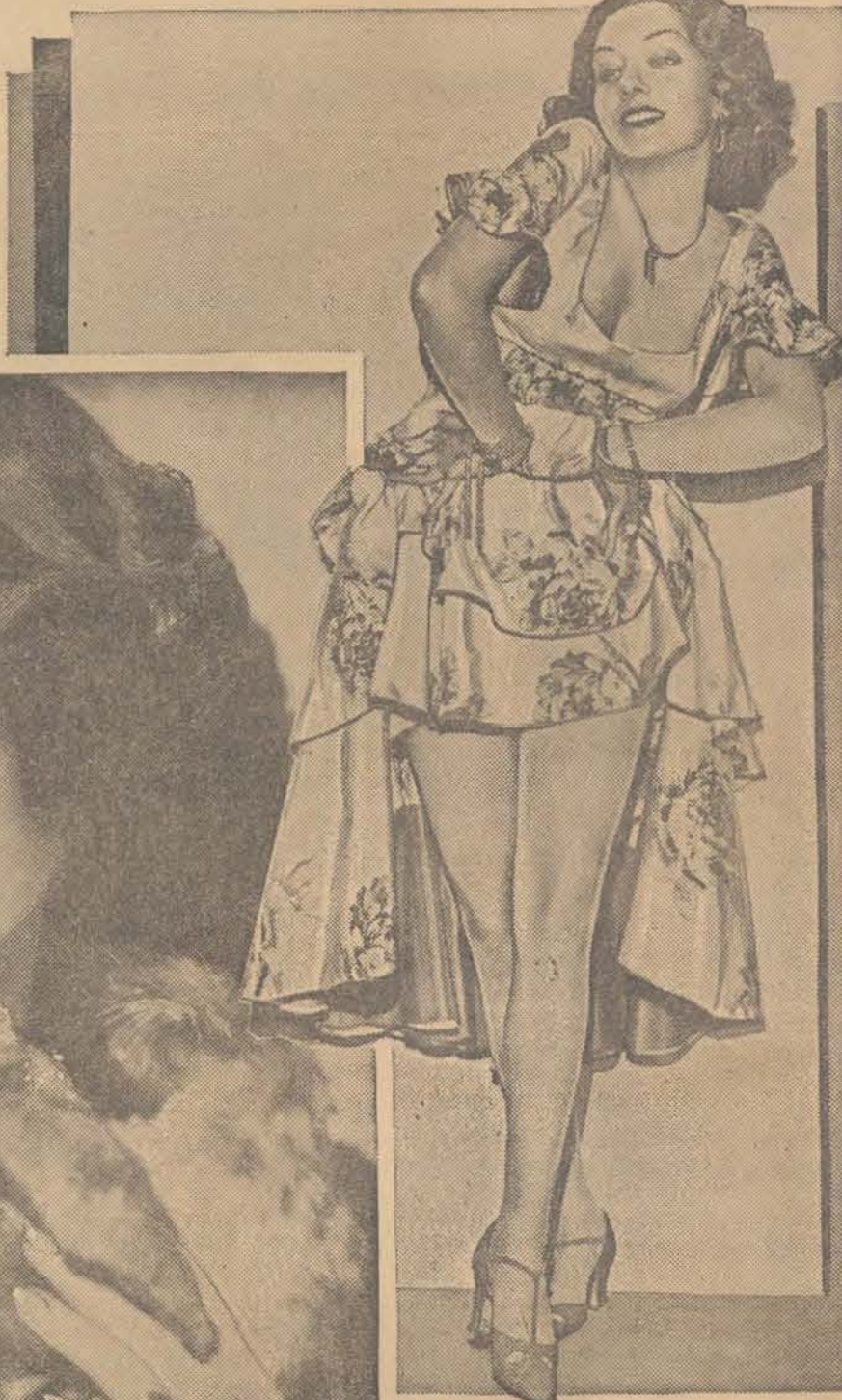
(above) LUPE VELEZ