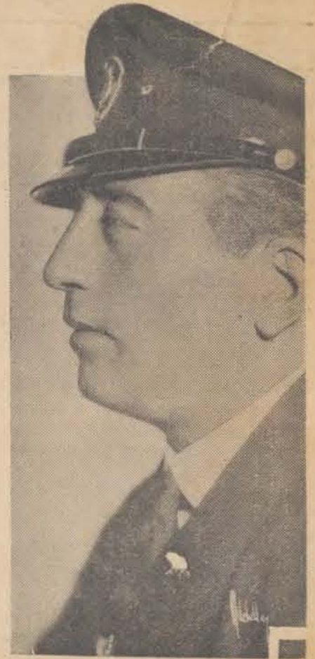
COUNT FELIX VON LUCKNER , erstwhile German Naval Commander, and popularly known as "The Sea Devil," who is now being heard on a new series of programs known as "Adventuring with Count Von Luckner."