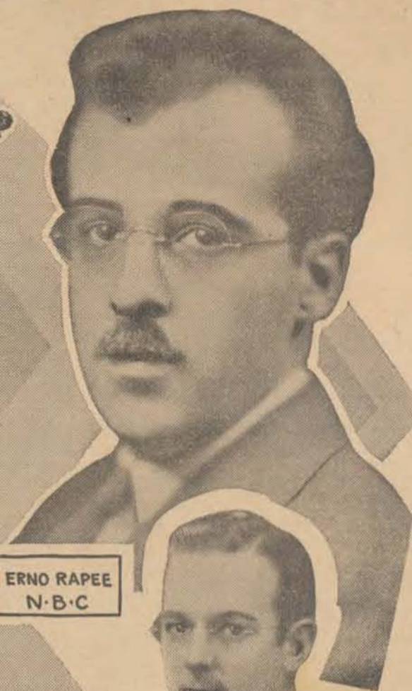
ERNO RAPEE N·B·C