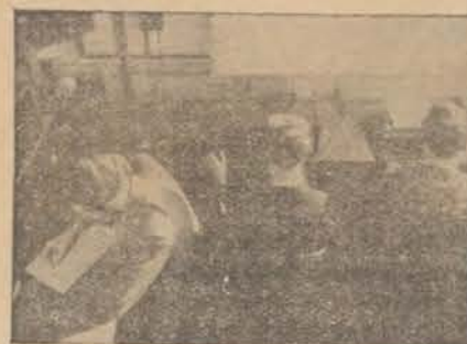
LEARN any phase of radio!

The Chicago school is located in spacious quarters in the Merchandise Mart. Visitors are welcome. Whether you have fully decided on a career in radio or not—come to the school. Inspect our equipment and facilities. Talk with a staff member. You will be