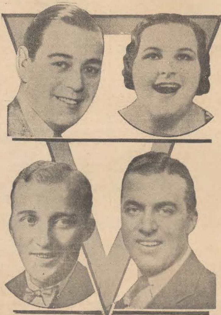
Columbia's Big Four—Morton Downey, Kate Smith, Bing Crosby and Arthur Jarrett

Look at Morton Downey. Exactly twelve months ago the Irish tenor made his inconspicuous debut on the