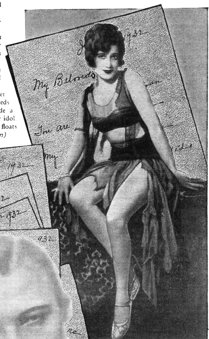
Rudolph Valentino (in center) never received so much torrid fan mail as some of the radio stars of today. In this picture you see excerpts from the letters sent to Norman Brokenshire (left) from The Mystery Girl. Right, Ruth Etting, who sometimes receives proposals through the mail.