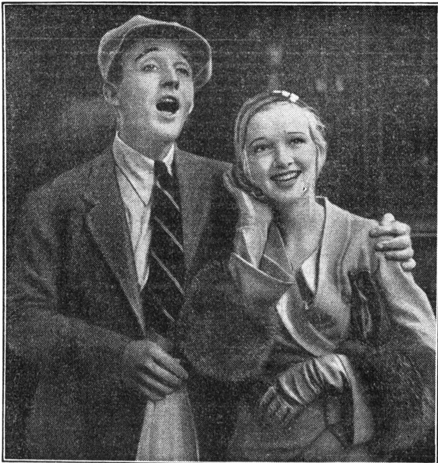
Bing Crosby, it seems, has got the habit and can't stop singing—even in railroad stations. He is shown here with his comely wife, Dixie Lee of the films, snapped on their arrival in Hollywood. Bing is going to appear in a picture, and he'll be back on the air in September.