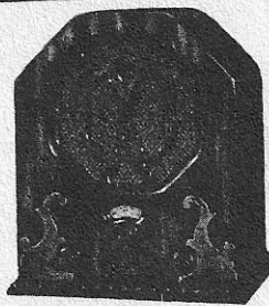
New REMLER Minuette Radio—Value $29.50