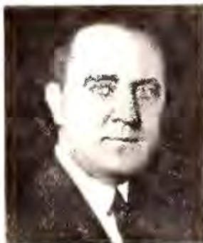
Built up NBC in the middle west .....

Born in Marietta, Ga., July 6, 1894, he is a member of a well-known Southern family.