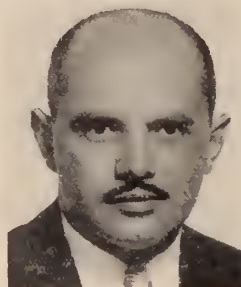
Feeds CBS' Web