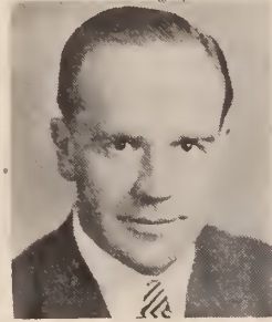
A 1926 all-American at Carnegie Tech...