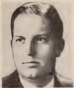
Claims championship in football miking.....