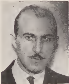
Trailed by his first love, singing.....