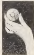
Weight 1¼ oz.

For 35 years Acousticon's world-wide organization has been working to bring hearing to deafened ears. During that time it has sold more hearing aids than all other firms combined. Now comes our latest and greatest triumph, the Coronation Acousticon.