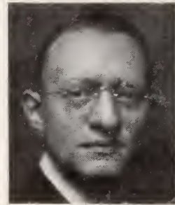
A typical "small town boy" who made good.

Born in the village of Beallsville, he later moved to the little town of Clarrington, and then to Ravenna—all in Ohio. His training included a period at Case School of Applied Science in Cleveland, and one at Kent State University, from which he was graduated. He is a real example of the small town boy who made good.