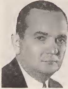
Sales promotion ability attracted attention ...