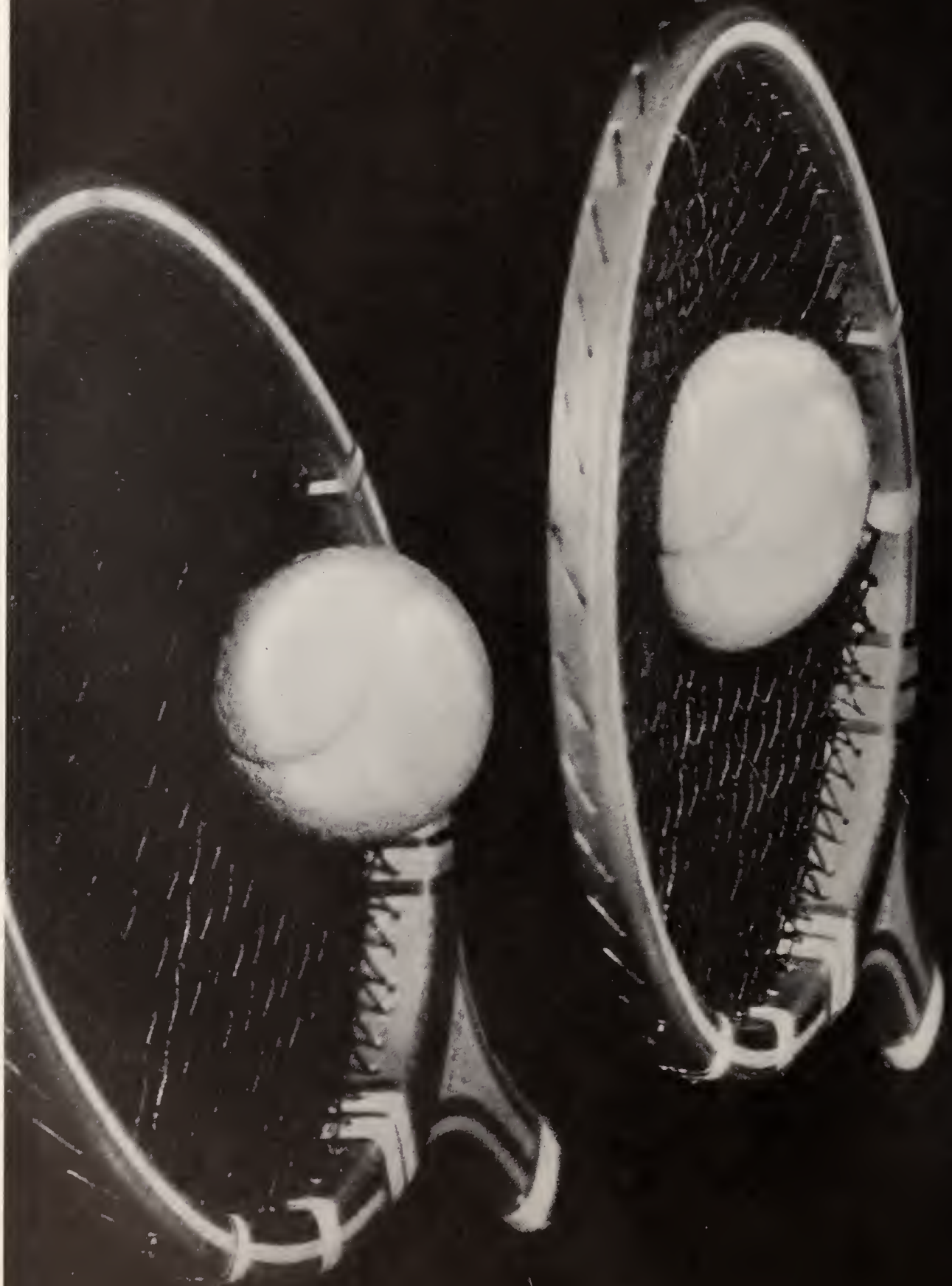
Taken at 1/100,000th of a second.