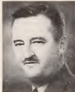
Has been around a bit in the radio field....