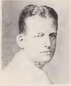
BBS 50,000 Watter Is His Baby .....