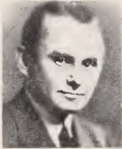
Taught Paris, Milan, Radio Showmanship ...