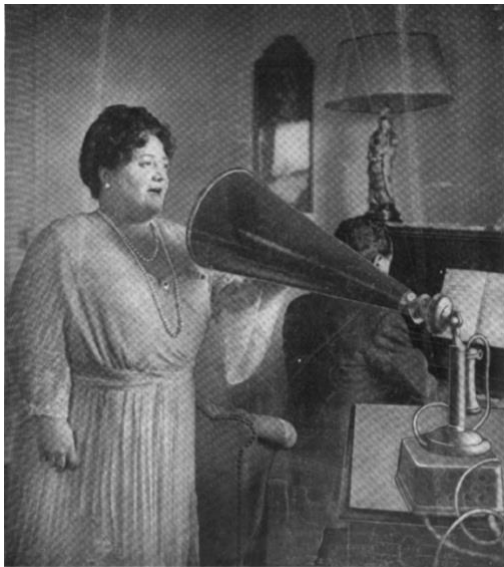
Mme. Luisa Tetrzzini, Operatic Soprano, Singing by Radiophone to Sailors of the American Navy Aboard Ship

Enjoy a look back at what was going on in the world of broadcasting 100 years ago.