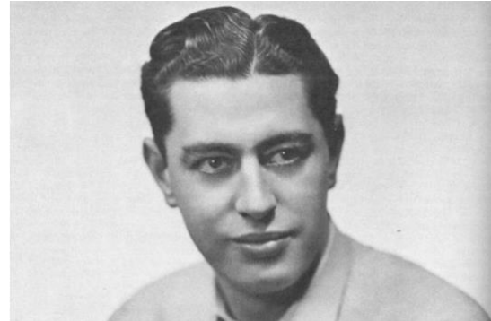
Fran Striker (Radio Hall of Fame)