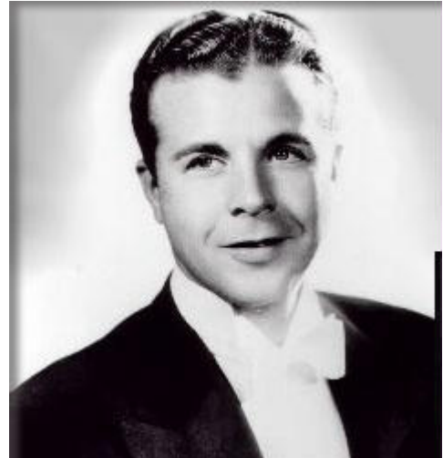
Dick Powell – Rich Diamond ( Richard Diamond, Private Detective )