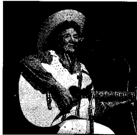
PATSY MONTANA on stage at the Grand Ole Opry House in Nashville, Tennessee, 1990

indefatigable entertainer, has never been able to find time to retire from the business. There have been television appearances, recording sessions, and extensive touring in the United States and Europe where she is particularly popular.