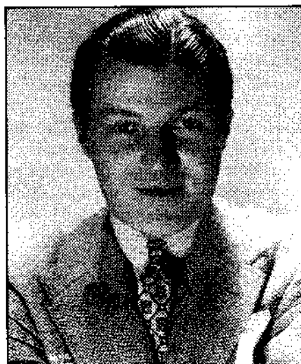
BANDLEADER CHARLIE BARNET

Charlie Barnet was born in New York City on October 26, 1913.