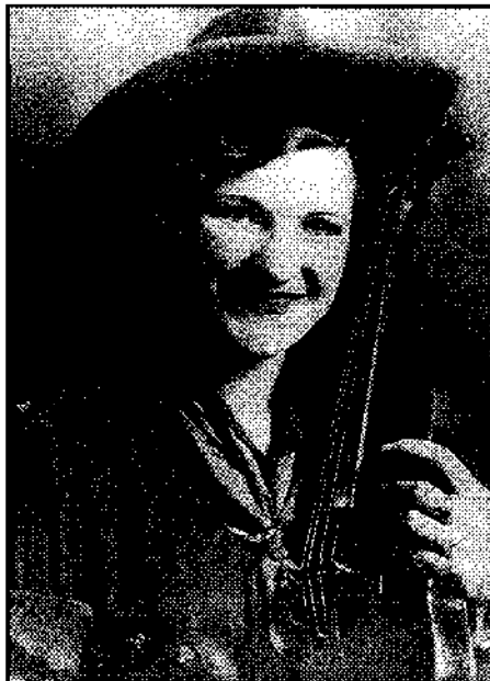
PATSY MONTANA'S first publicity photograph. (Circa 1930)

Sixty years later, Patsy speaks fondly of her time at WLS. She says that the