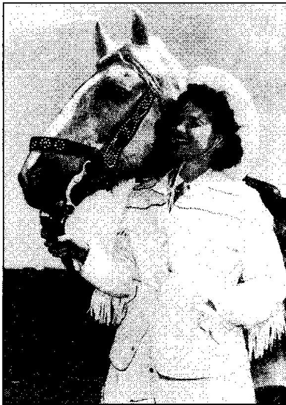
PATSY MONTANA AND FRIEND. (Circa 1945)