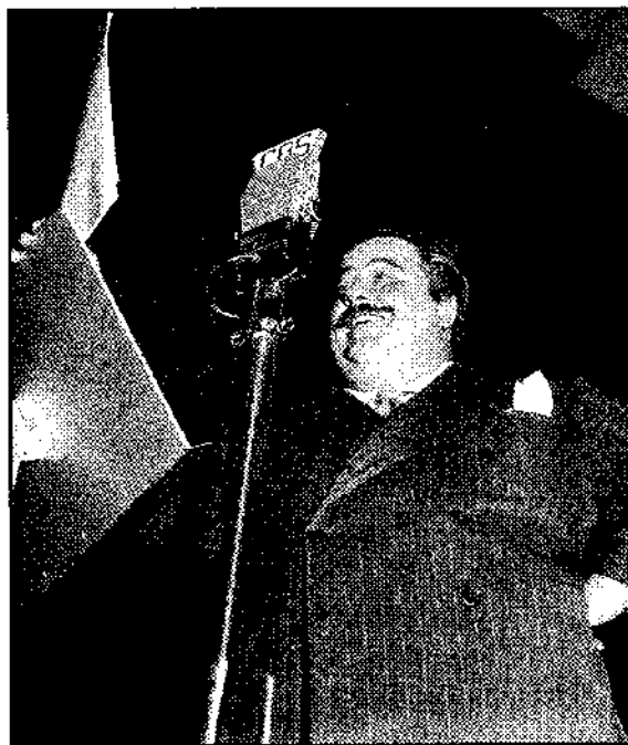
J. SCOTT SMART also known as THE FAT MAN