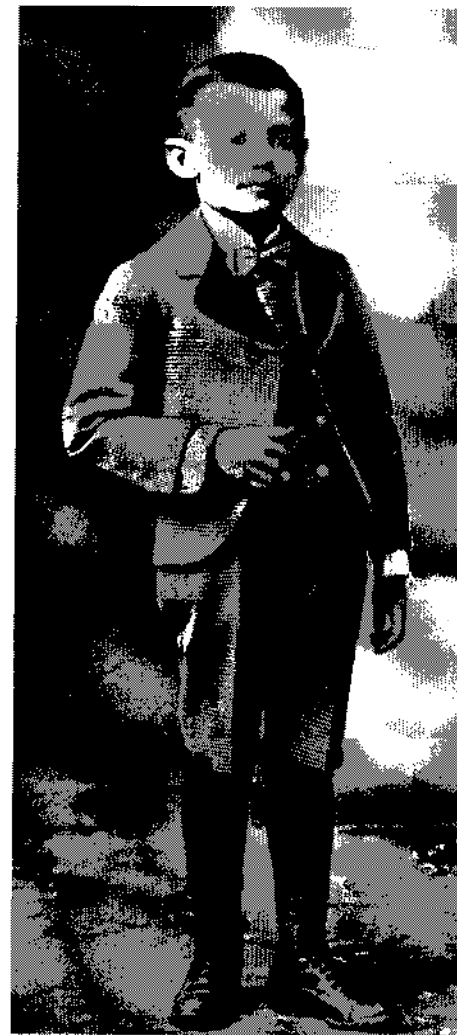
JACK BENNY, Age 4

reaching downtown Evanston in 1899 and Milwaukee in 1908. The Waukegan city system that formed the nucleus of the interurban was also enlarged, and a branch was built westward from Lake Bluff to Mundelein in 1905. In 1908 Chicago's 'L' system was extended northward to a direct connection with the interurban line in Evanston.