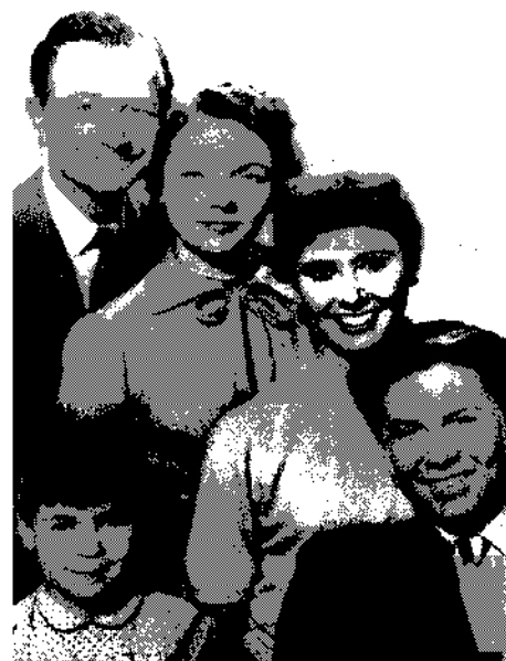
FATHER KNOWS BEST: Robert Young, Jane Wyatt, Eleanor Donohue, Billy Gray, Lauren Chapin.

The big studios looked down their noses at the efforts made by the "little guys" for the little screen. That was until a cartoon-maker named Walt Disney decided that the world needed another amusement park and that the