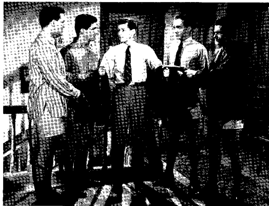
THE FIGHTING SULLIVANS were depicted on the motion picture screen in a 1944 Twentieth Century-Fox film. The movie was the true story of the five brothers who were killed in action when their ship was sunk in the South Pacific during World War II.

the U.S., from President Franklin D. Roosevelt down to ordinary citizens. The Sullivan Brothers and their sacrifice became a rallying cry for the nation at bond drives, war rallies, and on recruiting posters.