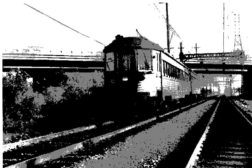
SKOKIE VALLEY ROUTE was a high-speed rail line that enabled the North Shore to lop precious minutes off its schedules — but the Edens Expressway overhead presages the end for this fine railway.

way several miles west of the lake in the Skokie Valley. The new line turned west at Howard Street, then north just west of Cicero Avenue (today's Skokie Highway), permitting a high-speed run through the prairies to what is now Illinois Highway 176 (Rockland Road). Trains turned back east along a part of the branch line from Mundelein to Lake Bluff and rejoined the older route at North Chicago Junction just south of 22nd Street.