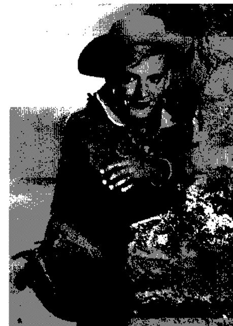
SUGARFOOT: Will Hutchins

CHEYENNE would become the base for a series of cowboy shows produced by the studio, including SUGARFOOT, BRONCO, and the megahit MAVERICK. However, Warner's really struck