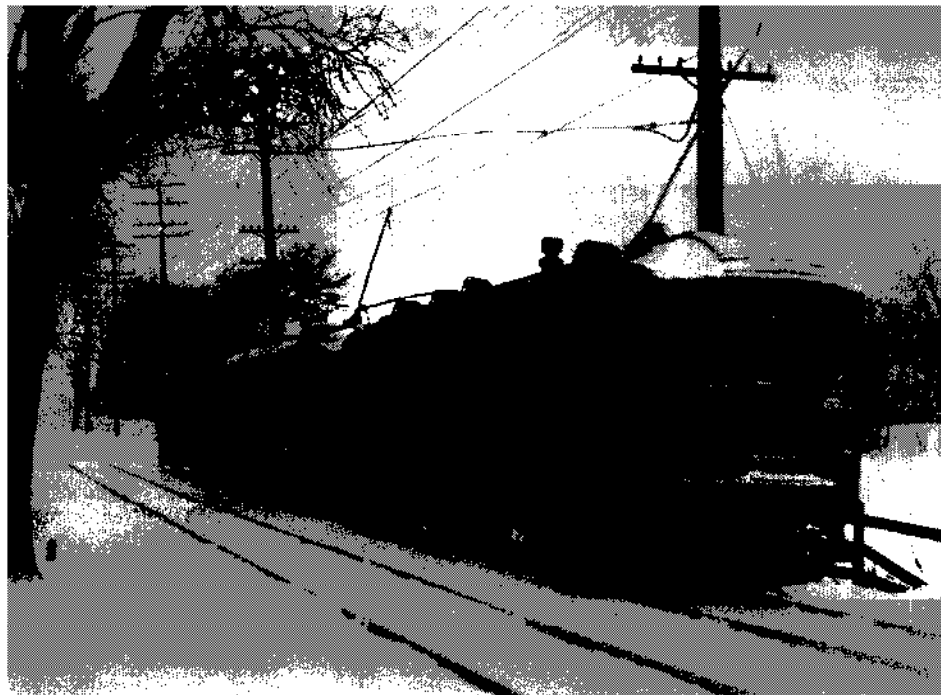
SNOW played an important role in the North Shore's fortunes every winter — but the trains almost always got through, as here along the Shore Line Route in Highland Park in February, 1949.