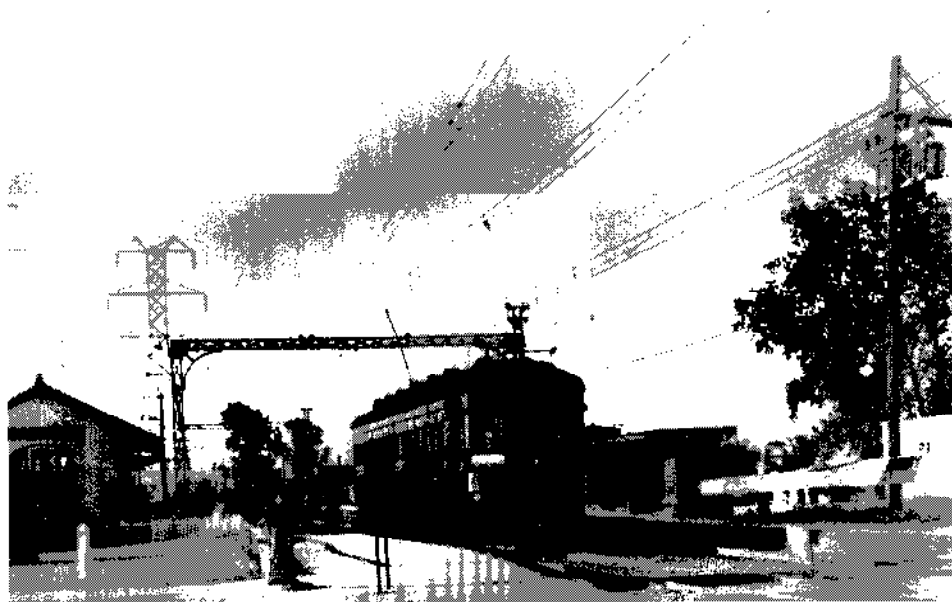
LIGHT TRAFFIC often called for the use of a single car, as here at Northfield on the Skokie Valley Route.

Though financially troubled by the hard economic times of the 1930s, the railway was able to proceed with plans to further modernize its fleet of cars through the purchase of two streamlined, articulated Electroliners in 1941. Each four-section train was 155 feet long, and seated 146; both had a tavern-