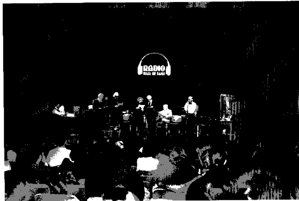
ON THE AIR! A jam-packed audience sat enthralled in the Chicago Cultural Center theatre for the re-creation of The CBS Radio Mystery Theatre. The presentation was taped and will be broadcast at a date to be announced.

Stay tuned for more such events. And take a look at a few scenes we shot during that terrific day.