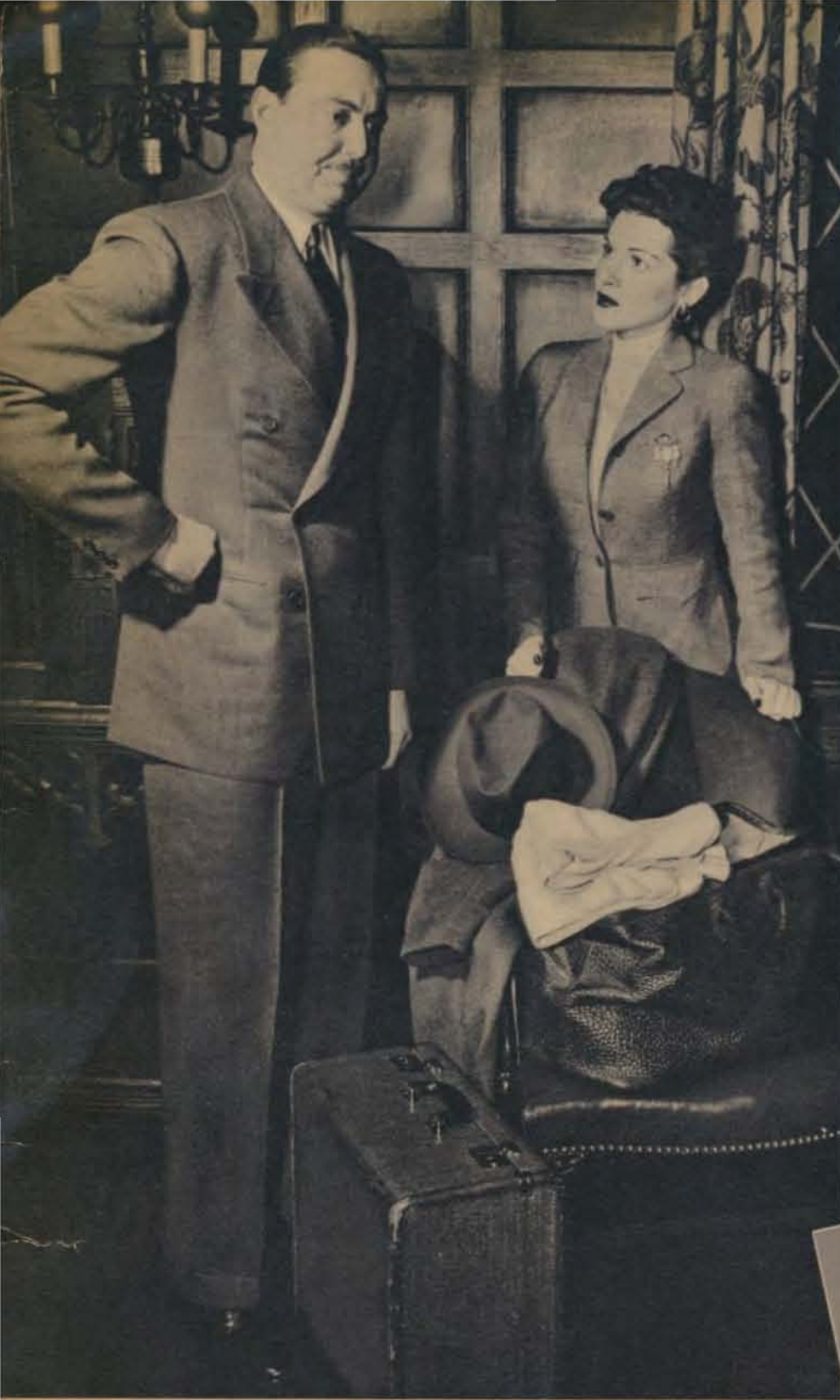
KAY pleads with John not to jeopardize his whole future, not to desert his children. But he insists on leaving home and going to a club to live after their quarrel over the wily Mrs. Hayworth

ing to maintain her home when she sees her husband falling under the influence of another woman. She wondered, too, how John's children—Peg and Bud—would react when they knew the truth.