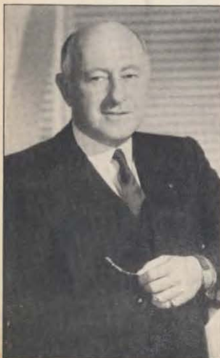
Best Radio Drama: Cecil B. DeMille's