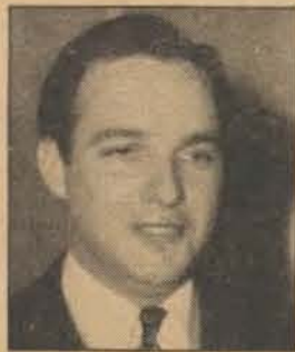
Bob Crosby—Band on "Fitch Bandwagon"

HERE'S a broadcast all radio listeners should be doubly inter-