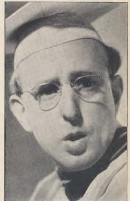
Star Musical Program: Kay Kyser's