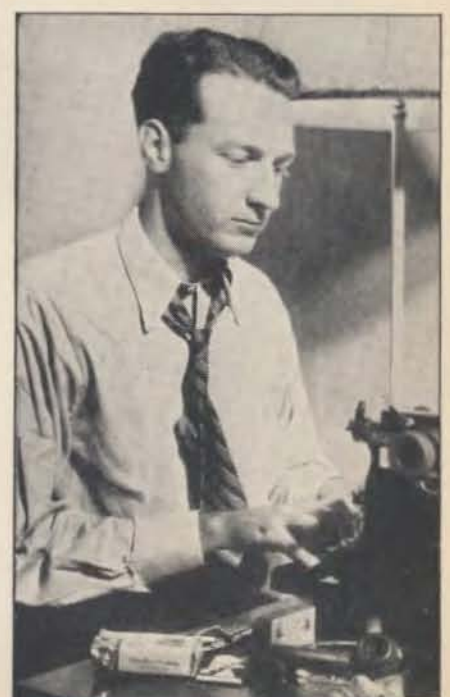
Best Daytime Serial: Paul Rhymer's