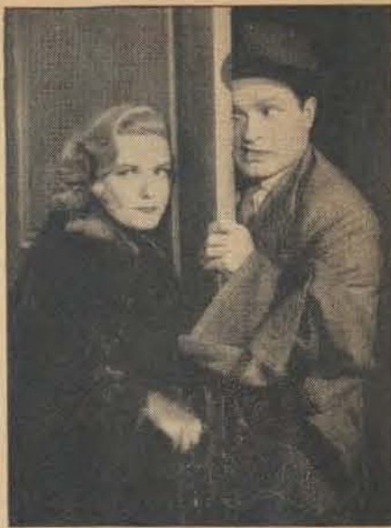
A DAFFY spy plot helps put over Paramount's "My Favorite Blonde," rollicking comedy starring Bob Hope, Madeleine Carroll

Another Hollywood favorite who has been deserting these haunts for a New York radio show and is now back in town is voluble Eddie Cantor. (Continued on Page 32)