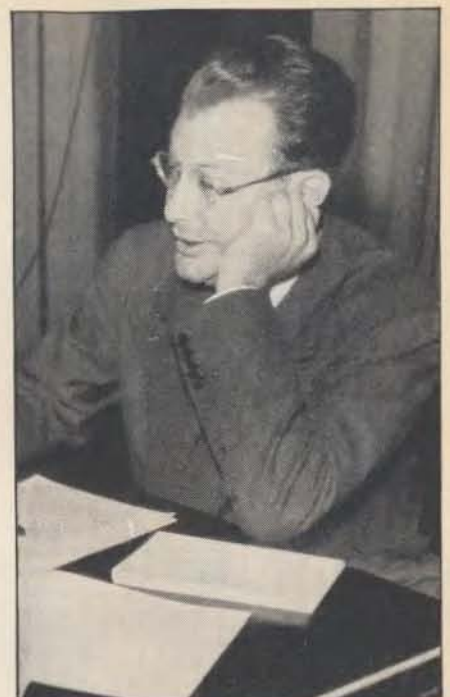
Most Popular Quiz: Clifton Fadiman's

(Ballots tabulated under the supervision of Survey Service.)