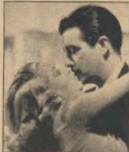
ILL-STARRED LOVERS are Lana Turner and Robert Taylor (above) in scene from M-G-M movie "Johnny Eager"

FANTASIA (VVVV): Walt Disney's short course in music appreciation.—Family.