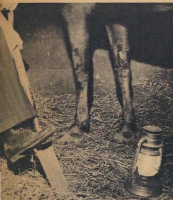
4. THE DIARY tells of a treasure buried years ago beneath a horse-stall by an old man who was dying. Allan puts on old clothes and goes with a lantern into the barn to dig for the treasure