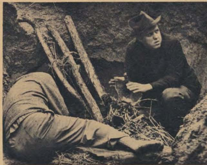
5. THE TREASURE is found there on the great-grandfather's old farm. But near-by bandits learn of the discovery, give chase to Allan and attempt to steal the treasure. With a faithful old Negro, who has been living on the farm, Allan hides out for a week in a damp cave until the bandits have lost the trail and given up the chase