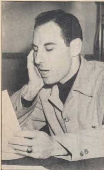
Star Sportscaster: Bill Stern