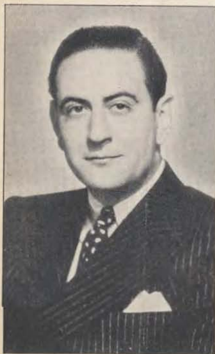
Top Dance Orchestra: Guy Lombardo's