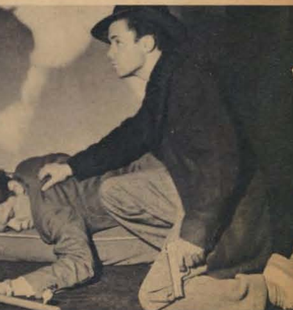
9. DENIED entrance to the den, Philip forces his way in. On guard with gun in hand, he finds Allan, tries to revive him as Yung Si Fu comes upon the scene. Then what? Hear "Dark Fantasy" May 22 for one of the most unusual conclusions even horror fans could want!