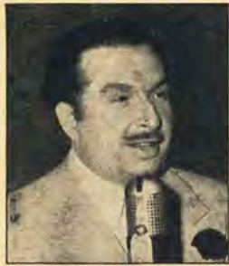
XAVIER CUGAT and his orchestra supply rhythms for the "Camel Caravan"