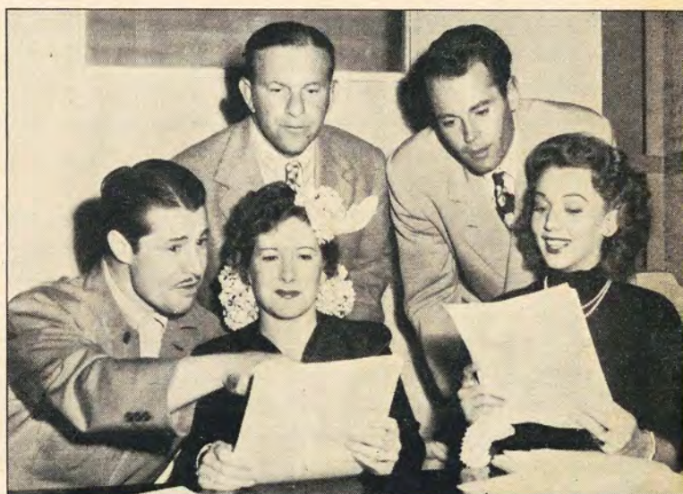
ROSTER of free talent for "Mail Call" programs reads like "Who's Who in Hollywood." At rehearsal above: Don Ameche, Gracie Allen and Carole Landis. Standing: George Burns and Henry Fonda. Look on Ameche's face says plainly that he's struck one of Gracie's gags

"MAIL CALL" is played before a soldier and civilian studio audience every Thursday night at KNX in Columbia Square, Hollywood. Broadcast got its odd, but mighty appropriate, name from the bugle-call sounded in all parts of the world whenever and wherever American troops receive mail. Produced by the War Department, under the direct supervision of U. S. officers, it is not for local listening. Soon as the program is short-waved and transcribed, recordings are rushed by bomber plane to every distant outpost where U. S. troops are stationed. Next to real letter from home, it's tops!