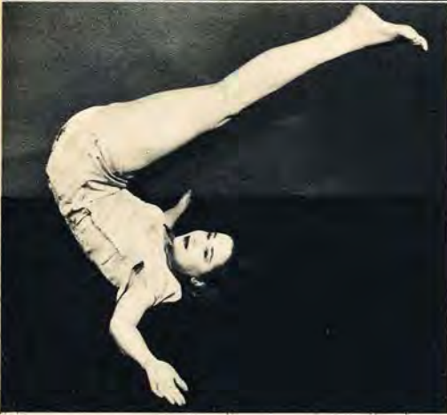
STIR up lazy circulation by extending feet over head, then touch the floor. Next: Go through motions of pedaling an imaginary bicycle rapidly