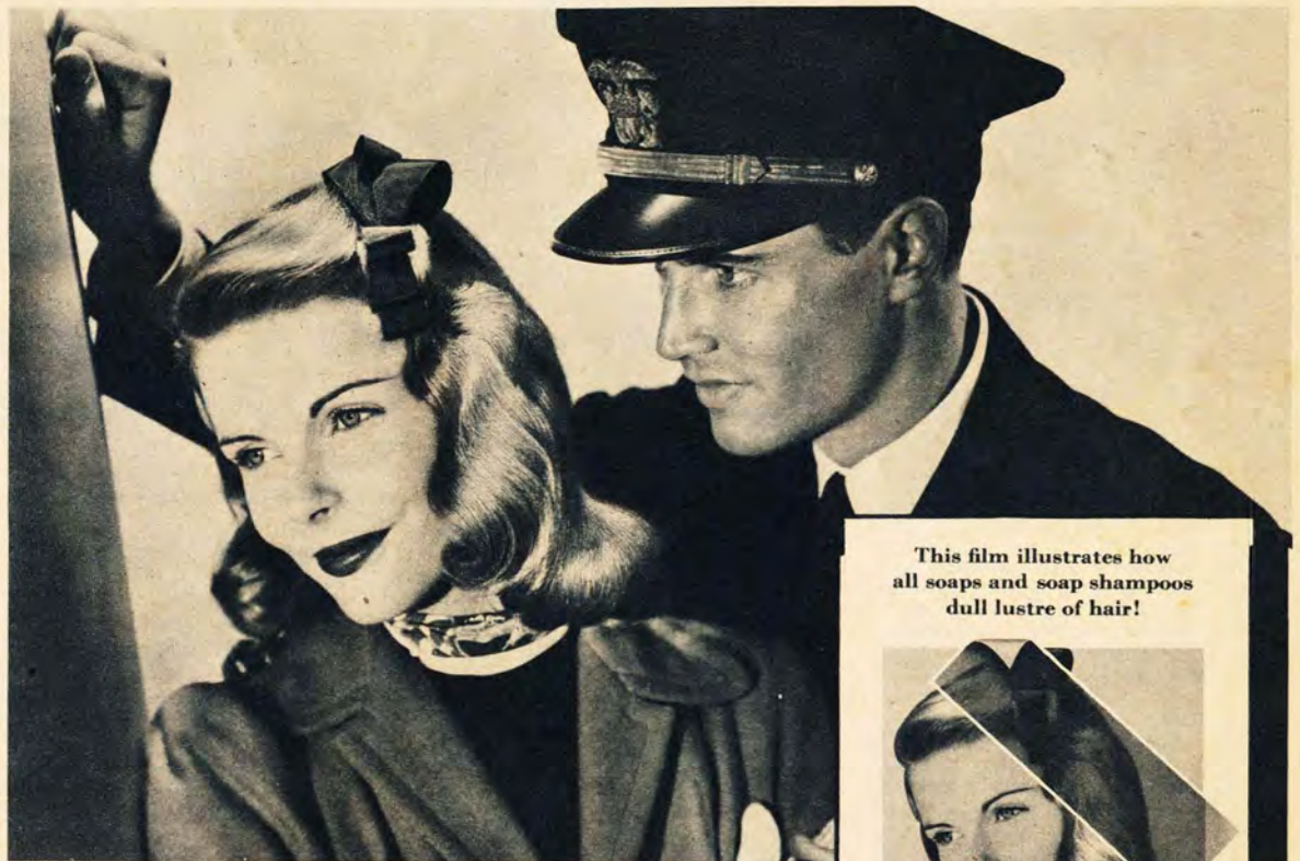
Darling of the Campus! New, well-groomed version of the college casual hair-do with only a slight wave breaking its gleaming smoothness. That smart scarf tucked inside her sweater says "Bundles for America".