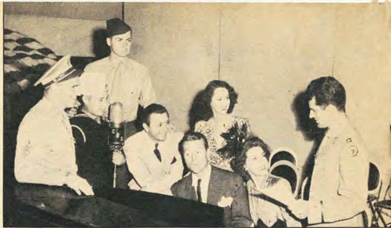
SERVICEMEN on leave always can be found in the studio audience that attends show, which has been tabbed a great morale builder. Above: A trio listens in backstage as Robert Young, Red Skelton, Virginia O'Brien, Marsha Hunt are coached by War Dept. director