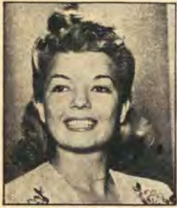
FRANCES LANGFORD warbles on the "Bob Hope Show"