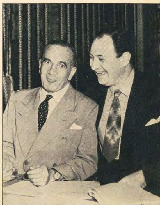
BACK TOGETHER. Al Jolson and his irrepressible stooge, Parkyakarkus (Harry Einstein, right), are teamed up again in Jolson's new program. There's a new character on show, too. Name: Shakyakarkus