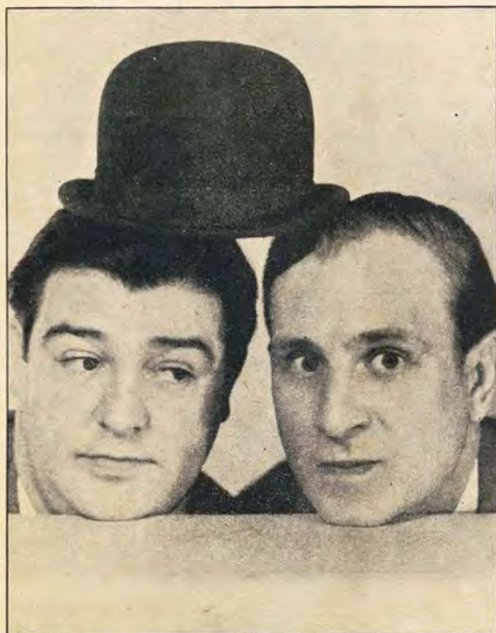
TWO WHIMSICAL 'MADMEN' who need no introduction are Abbott and Costello. Their new Thursday night show brings Bud and Lou back to radio, where the "bbbaad boys" first won national attention

The coop was about six feet square, (Continued on Page Facing 36)