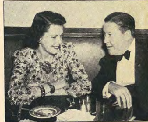
EVER ebullient Jack Oakie with Mrs. Jack at the Brown Derby a few days before they separated