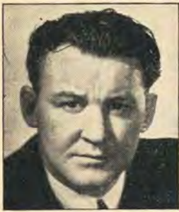
TOM TULLY, character actor on "Grand Central Station" dramas