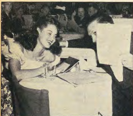
DONA DRAKE dines with candid-camera dodger cartoonist Peter Arno at the Florentine Gardens