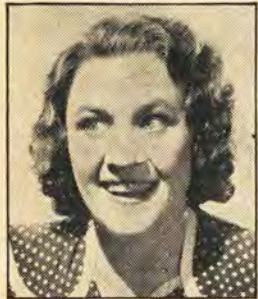
MARIAN JORDAN, one-half of the Fibber McGee and Molly team