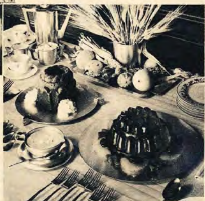
MARGARET SPEAKS, soloist on NBC's "Voice of Firestone," prepares individual salad plates to make her buffet spread tempting