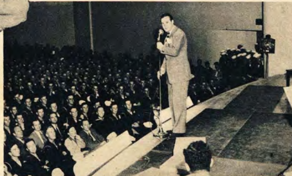
FAREWELL to Mrs. Hope (left) takes place at Burbank airport, just before Bob took off for the far north. Above: Bob gets real satisfaction from the enthusiastic reception he received at Bremerton Navy Yard