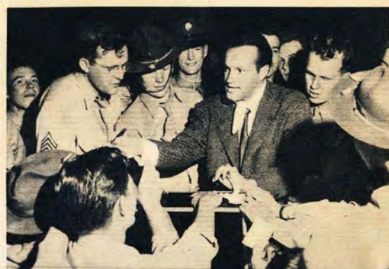
WRITER'S CRAMP threatened Bob Hope when enthusiastic soldiers almost mobbed him in search of autographs after his Fort Lewis show. Above: He tries to meet all requests