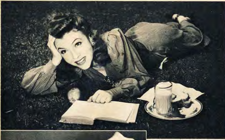
MARGO, star of CBS "Caravan" show, whose voice was voted best on radio. She reduces strain by relaxing during spare moments at lunchtime