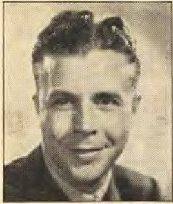
DICK POWELL is star of the "Campana Serenade"