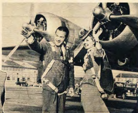
FLYING SONGSTRESS Frances Langford (above) is shown with Bob as they left Fairbanks, Alaska, for an unnamed destination near the front