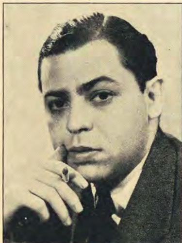
INTIMATE of the late George Gershwin, Oscar Levant (above) may solo in Toscanini offering of the composer's famous rhapsody

concerts is the Cleveland Orchestra under its regular conductor, Artur Rodzinski. This orchestra performed, as you probably remember, in place of the Philharmonic-Symphony on October 11, will be heard again on October 18. But the series arranged for the Clevelanders begins on October 24, for a string of Saturday afternoon events. The orchestra is celebrating its twenty-fifth anniversary.