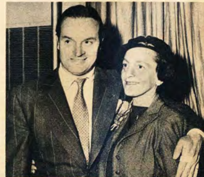
WAR TROUPER number one of the last war, Elsie Janis, gives Bob cheery hug for his splendid work in present world struggle