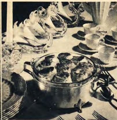
ABOVE: Chicken potpie with baking-powder biscuits makes a perfect main dish for a buffet supper. It looks appetizing, too