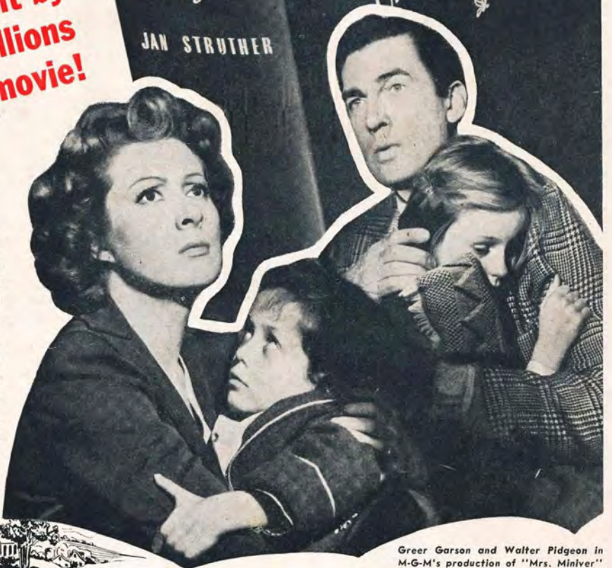
Greer Garson and Walter Pidgeon in M-G-M's production of "Mrs. Miniver"

MAIL THIS COUPON TODAY FREE: "Mrs. Miniver"