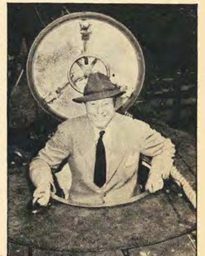
FRAZIER HUNT roams in search of first-hand color for his broadcasts. Here he is shown dropping into the hatch of a submarine