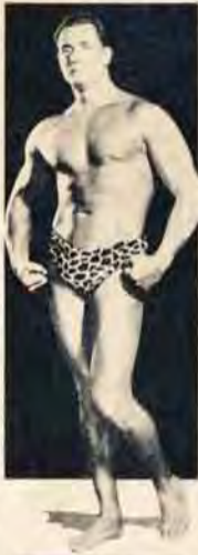
CHARLES ATLAS Holder of title, "The World's Most Perfectly Developed Man"

I KNOW, myself, what it means to have the kind of body that people pity! Of course, you wouldn't know it to look at me now, but I was once a skinny weakling who weighed only 97 lbs. I was ashamed to strip for sports or undress for a swim. I was such a poor specimen of physical development that I was constantly self-conscious and embarrassed. And I felt only HALF-ALIVE.