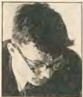
Shostakovich: His seventh was born of battle

New York World-Telegram Music Critic and Associate Program Annotator for Philharmonic-Symphony Society of New York