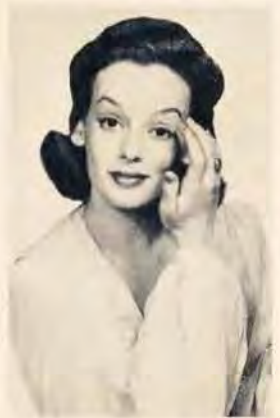
LEFT: Use eye-shadow to define eye—add contrast to whites