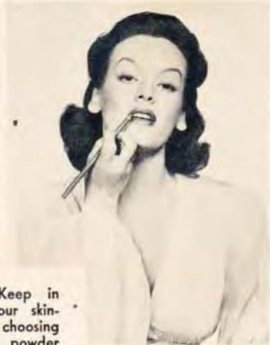
UPPER RIGHT: Never use cheek rouge on lips—or vice versa!