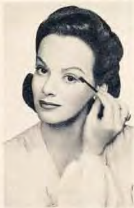
RIGHT: A touch of mascara gives the model that wide-eyed look