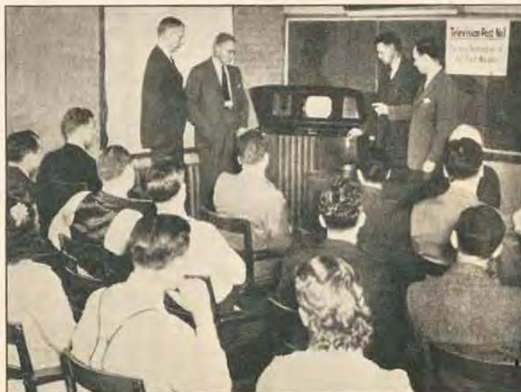
TELEVISION provided effective method of instructing air-raid wardens at Union College, Schenectady, N. Y. Although war-time ban on equipment manufacture won't permit construction of new stations, many that were in operation before the ban are using facilities to promote the war effort

CBS has been making program pick-ups from Chungking, China, at a little after 5:00 a.m. PWT. The Chungking station over which this program may be heard is XGOY (9.635) . . . XGAP (10.24), Jap-controlled station at Peiping, China, broadcasts daily from 2:45 to 9:15 a.m. PWT . . . HSP5 (11.715), Bangkok, Thailand, broadcasts an English commentary near 4:30 a.m. PWT . . . The news in English from Manila may now be heard at 5:30 a.m. PWT, over KZRH (11.62, 9.64, 6.145). The 11.62 frequency is usually best . . . The 3:48 p.m. PWT English transmission from Moscow is now broadcast on 15.23, 15.18, 15.11 and a new frequency of 11.83 megs . . . CR6AA (7.177), in Angola, operates Wednesdays and Saturdays from 1:00 to 3:00 p.m. PWT . . . HP5A (11.70), Panama City, broadcasts news in English from 7:40 to 8:10 p.m. PWT.