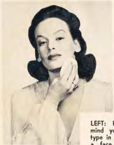
LEFT: Keep in mind your skin-type in choosing a face powder