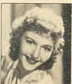
MARY MARTIN sings on "Kraft Music Hall"