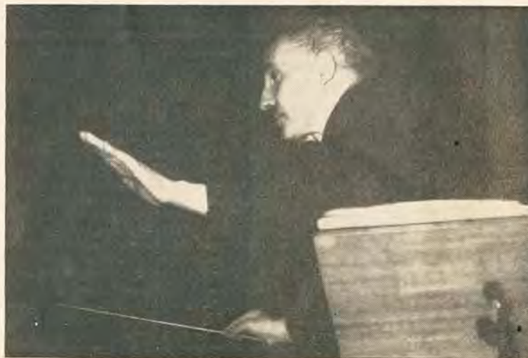
COVETED prize was the privilege of conducting the Western Hemisphere premiere of Shostakovich's "Seventh Symphony." Many noted conductors vied for the glory but it went to Arturo Toscanini, shown above motioning for a moderate pace at rehearsal of the opus by NBC Symphony Orchestra

See the Program Pages for Music Listings and Complete Music Detail