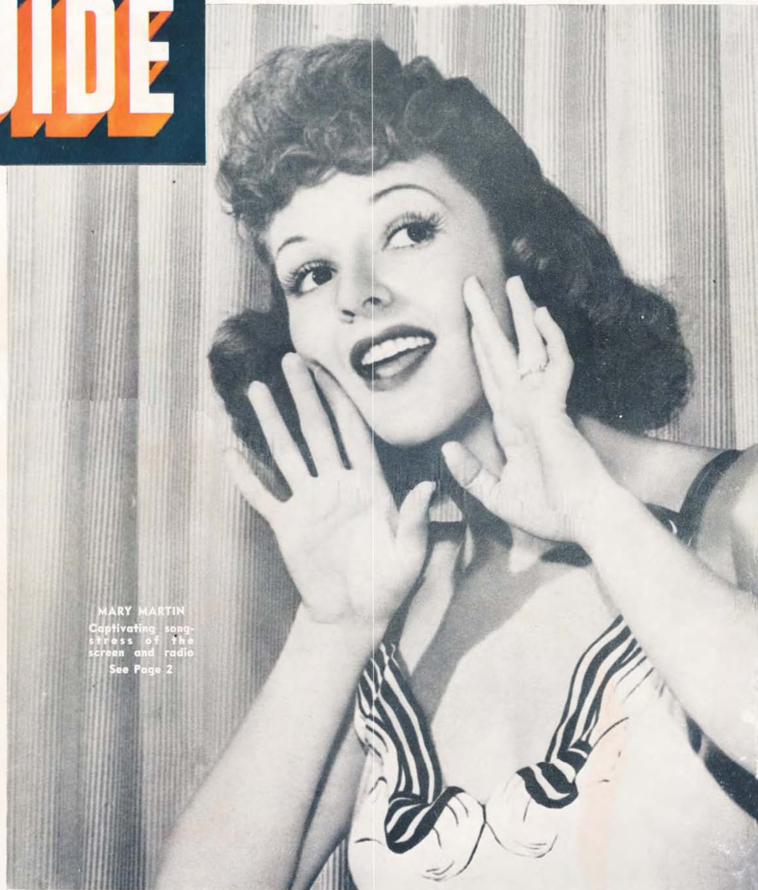
MARY MARTIN Captivating song- stress of the screen and radio See Page 2