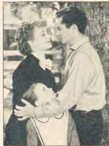
JOAN CARROLL looks glum as Tim Holt romances with Virginia Gilmore in "Laddie." In "The Ambersons" he loves Anne Baxter

COUNTRY FAIR (VVVV): You visit a fair full of talking animals, honest.—Family.