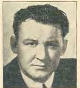
TOM TULLY prominently cast in "Death Valley Days" dramatizations

Amos 'n' Andy: KNX KSL KOIN KIRO KFPY Fred Waring in Pleasure Time: KPO KOMO KOA KDYL KHQ KGHL KTFI KGIR KIDO KGW KSEI Standard Symphony Hour: KFRC KMO KELA KOOS KIT KOL *Earl Godwin, news: KGO KJR KEX KLO KGA KFBB CFCN-O. T. Prgm. CJCA-Musicale CJRM-Popular Music *KFBB-World Today *KGVO-News