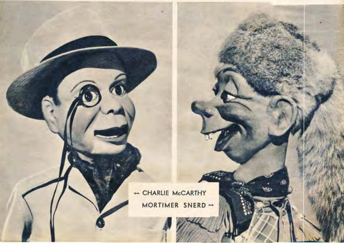
← CHARLIE McCARTHY MORTIMER SNERD →