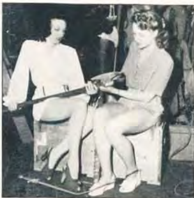
RUBBER battle-axes, DeMille props, went into Victory scrap too!