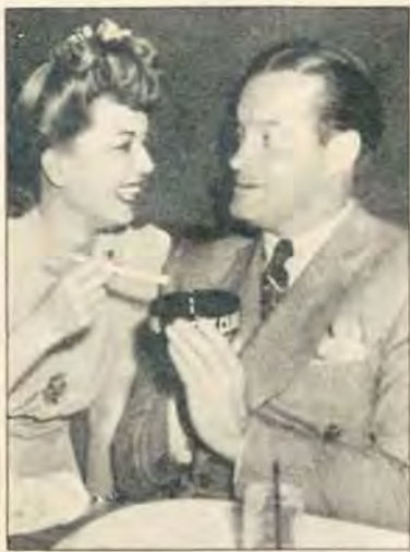
—Stork Club SONGSTRESS Frances Langford gets service with a smile from comedian Bob Hope during a cocktail party at the Stork Club

reading, and to say, save and buy bonds. Save and turn in rubber. Let's do our share to win the war now—TODAY! . . .