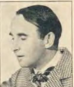
WALTER O'KEEFE emcees "Battle of the Sexes"

11:15 PWT P.M. 12:15 MWT Joe Reichman's Orch.: KPO KGW KHQ KFBB KDYL Dyana Gayle, songs: KNX KIRO CBR KFPY Henry Busse's Orch.: KFRC KOL KIT KMO Bill Sabransky, organist: KEX KGA KJR KGO-Music You Want 11:30 PWT P.M. 12:30 MWT Joe Reichman's Orch.: KOMO Bill Sabransky, organist: KFBB KJR KGA Cab Calloway's Orch.: KIT KMO KEBC KOL *Manny Strand's Orch.; News: KNX KSL KOIN CBR *News: KEX KGW KFPY-Today in Review KIRO-Easy Listening KXA-Silver Serenade