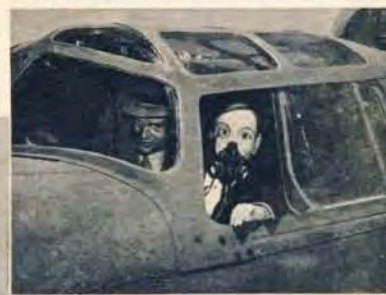
FINALLY MUFFLED, the irrepressible McCarthy posed at the Consolidated plant in a modern oxygen mask of the type used for high-altitude flying. Charlie's bond sales at this aircraft factory paid for half a dozen warplanes