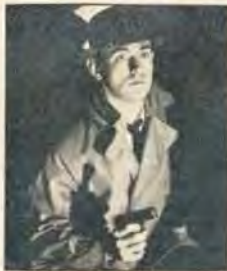
ALAN LADD leaps forward in "This Gun for Hire," Paramount picture starring Veronica Lake

YOKEL BOY (VVV): Based on Broadway play. Joan Davis, Albert Dekker in farce about Public Enemy No. One.—Family.