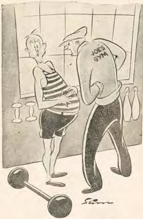
"That medicine ball—you don't EAT it . . . you PLAY with it!!"