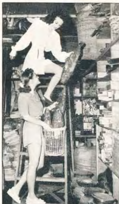
LAST-MINUTE discovery were fish used in "Spawn of the North"