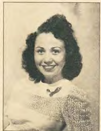
GOOD PICKINGS for anybody's blind date. She's Connie Haines, singing star of the Blue Network's "Your Blind Date" on Mondays