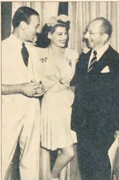
SONG AND DANCE meet on Kostelanetz program and in "You Were Never Lovelier" movie. Songs are Jerome Kern's (r.), and the dancing's by Fred Astaire (l.), Rita Hayworth

Radio will probably be the important factor in putting Stage Door Canteens in the key cities of the United States through the radio program sponsored by Corn Products. The attention of the entire nation is being called to the work done by the tremendously successful New York Stage Door Canteen, which is now enter-