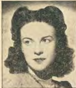
JOYCE HAYWARD femme lead in "The Sea Hound"