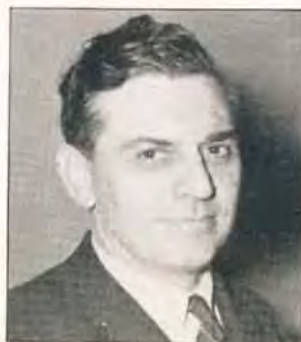
RAYMOND CLAPPER —He never forgets the interests of John Doe

Which brings to mind columnist-commentator Raymond Clapper's sage remark, "Never overestimate the people's knowledge nor underestimate their intelligence," and the fact that it might be mullied—and profitably—by our War Production Board. What's your verdict, readers?—The Editors.