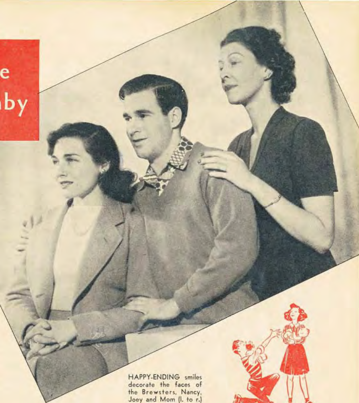
HAPPY-ENDING smiles decorate the faces of the Brewsters, Nancy, Joey and Mom (l. to r.)