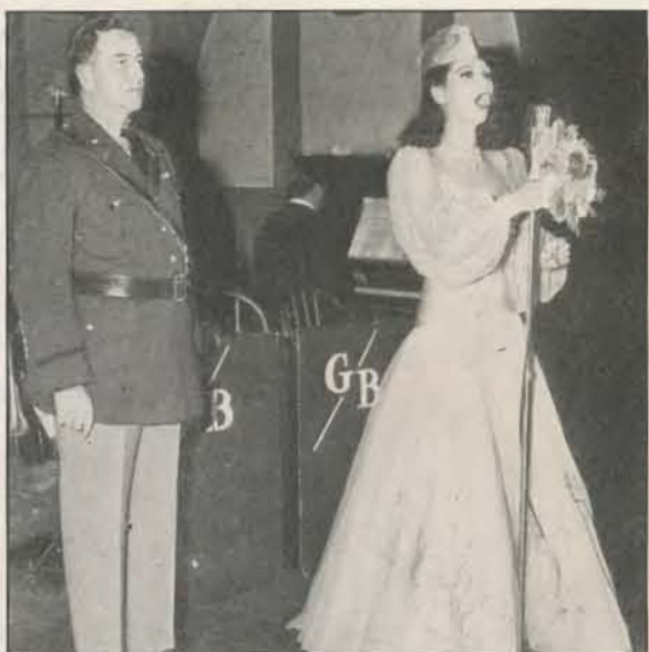
CEREMONY over, Dinah sang regiment's official song, "Wearing of the Gray," sung by Jenny Lind ninety years before. Entire regiment, all guests, rose and joined Miss Shore in song