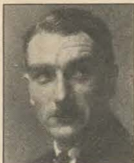
Boake Carter—program changes time

EASTER Sunrise Services from Arlington National Cemetery, un-