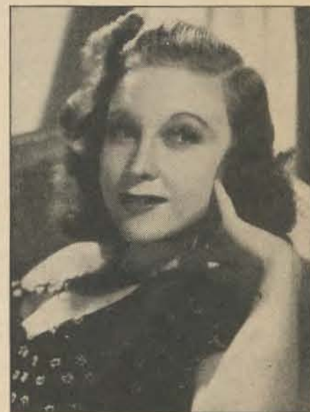
LURENE TUTTLE plays Judy Price, "Dr. Christian's" secretary. Her role must be written into "Dr. Christian" contest dramas

The opportunity-laden "Dr. Christian" competition for playwrights is drawing near its close, which is May 1. So, polish up those plots and get the manuscripts in the mail. Already the contest has turned up over 30,000 potential radio writers, according to the number of requests for contest rules received by the officials. Here are a couple of last-minute tips from Jean Hersholt himself (he's Dr. Christian): "Scripts may be written in pencil, but we prefer that they be typed. And remember, suspense should