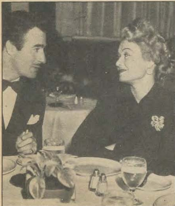
WHILE on short Manhattan jaunt, Constance Bennett, screen star, and actor-husband Gilbert Roland dropped in for supper at the Waldorf-Astoria's Wedgwood Room, enjoyed the floor show, and Dinah Shore's songs specially

Contracts and casting: Olivia de Havilland will be Jack Benny's leading lady in "George Washington Slept Here" . . . Elmer winner Fredric March heads the cast of Thorne Smith's "I Married a Witch" opposite Veronica Lake . . . D. O. Selznick wants Cary Grant to play David in "David and Claudia" . . . Diana Barrymore will play in Univers-1's "Love and Kisses" ("Boy Meets Baby") opposite Robert Cummings, who will be a papa soon . . . She's also the lead opposite Bob Stack in "Eagle Squadron," which cast includes Jill Esmond, ex-wife of Laurence Olivier . . . Mary Martin will go back to work with Rudy Vallee and Dick