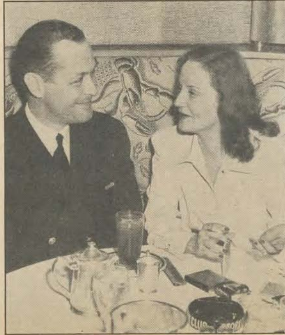
LIEUT. Robert Montgomery, now in Morale Division of Navy, steps out for an evening at New York's Stork Club, chats with Tallulah Bankhead (above). One of first movie stars to enlist, Bob's stationed in nation's capital