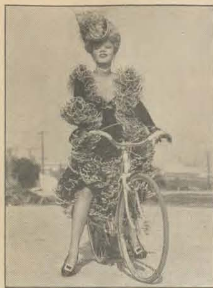
GIBSON GIRL get-up for her role in Universal's "The Spoilers" doesn't keep Marlene Dietrich from between-scenes cycling on lot