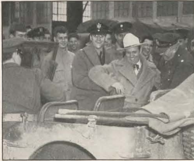
WHEN Gene Autry, Republic movie star, visited Ellington Field, world's largest multi-motor flying-school, he first toured field in an Army "jeep"