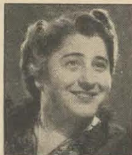
Gertrude Berg—new time for "Goldbergs"

GLORIA WARREN, screen starlet now appearing in "Always In My Heart," will make her radio debut on the Rudy Vallee program this Thursday. Also in the cast will be Hattie McDaniels and Nicodemus, NBC. Eastern 10:00 p.m. Central 9:00 p.m. Mountain 8:00 p.m. Pacific 7:00 p.m.