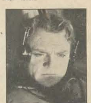
TAILOR-MADE for star Jimmy Cagney is Warner Bros. picture, "Captains of the Clouds," in color

MR. AND MRS. NORTH (VV): Gracie Allen detects murderer without George Burns' help.—Adult.