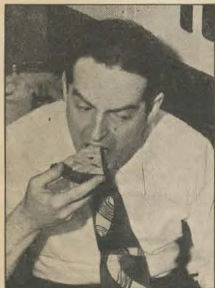
FRED WARING is always so busy he grabs lunch while working. His latest project is a contest for college glee clubs

Here's news of a big new contest that isn't open to everyone, but it's a mighty worth-while project that everyone should be glad to hear about. It's a mammoth competition for college men's glee clubs, originated and directed by Fred Waring, whose own