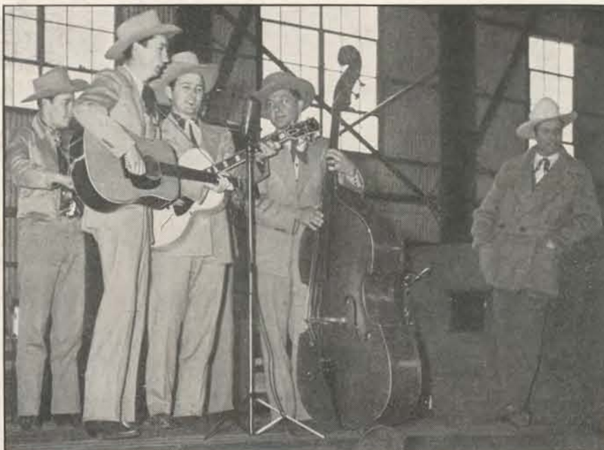
JAM-PACKED with aviation cadets and enlisted air corps men was huge hangar at Ellington Field, Texas, when Autry and his CBS Sunday "Melody Ranch" entertainers obliged with some popular sing-swing tunes