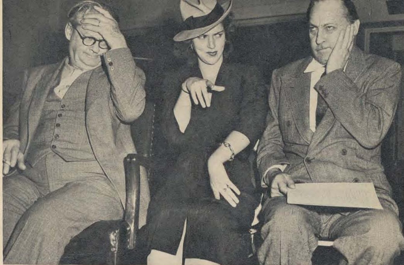
Three of a Kind: There are some mischievous corpuscles that seem invariably to crop up in the dramatic blue blood of the Royal Family of the Theater. Case in point: Above, the three Hollywood Barrymores are in a unanimous gagging mood, as they appeared together on the Rudy Vallee show recently. Lionel (left) and John agonize as John's daughter, Diana (now under contract to Universal Studios, and making "Eagle Squadron"), does an imitation of Papa in one of his more dramatic poses. At the show's rehearsal all three utilized their drawing talent making caricatures of each other and their co-workers