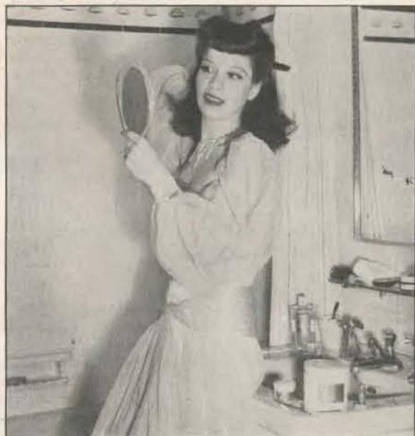
THRILLED was Dinah Shore when she was named Queen of 7th Regiment at annual New York State Guard ball, held at the regiment's armory on Park Ave., N. Y. City, primed for the occasion

Dinah Shore Shares a Unique Honor With Famous Singer Jenny Lind, Who Was Inducted Into 7th Regiment Ninety Years Ago