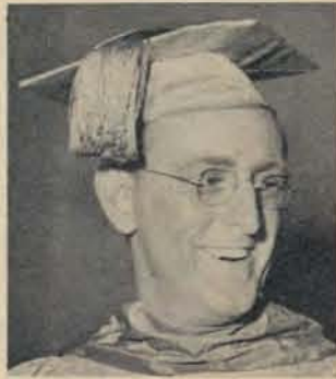
KAY KYSER, of “College of Musical Knowledge”

From “Kay Kyser's College of Musical Knowledge” (NBC, Wed., 10 p.m. EWT)