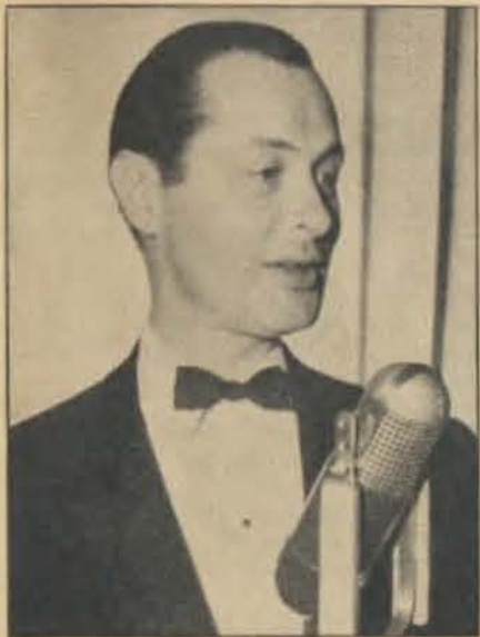
LIEUTENANT Robert Montgomery, U. S. Navy, did a smashing job as narrator of the initial broadcast of "This Is War" series

A few Thursday nights ago we dropped in at one of our favorite air shows, the "Duffy's Tavern" program. It was apparent that Ed Gardner, who portrays Archie, wasn't too happy.