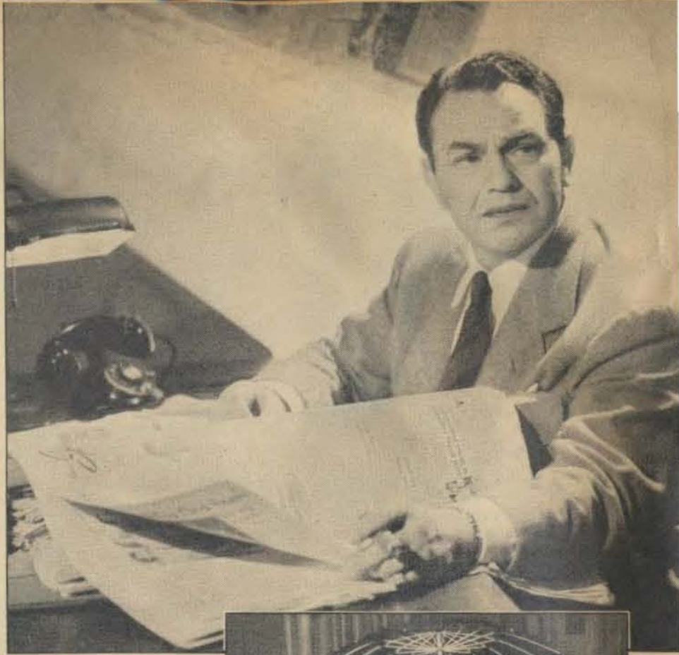
SOFT-SPOKEN and genial in real life, Mr. Robinson presents a contradictory front as hard-boiled editor of the "Illustrated Press," Steve Wilson (above), who snaps orders, and is poison to law-breakers. Service men, others attend his broadcasts in droves

In the present season, although Steve Wilson (Edward G. Robinson) is still a crusader, he centers his editorial policy on the parade of headlines that deal with national defense, other problems of nation-wide interest, with only an occasional detour onto the old stamping ground of sawed-off shotguns and "pineapples."