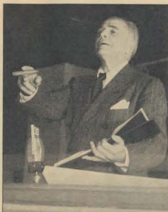
PRODUCER-DIRECTOR and editor of the "Big Town" programs is Crane Wilbur, whose business always has been show business, both on Broadway and in Hollywood. Wilbur has written, starred in and produced many plays