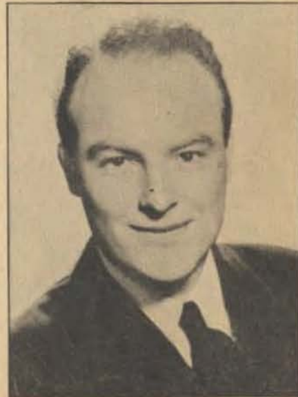
RALPH EDWARDS, master of the "Truth or Consequences" reveals, offers money for questions and tips for consequence stunts

Now a few closing sidelights on this outstanding contest. Operettas representing the American spirit and achievement were submitted from every corner of the United States and many from Canada. Illinois furnished