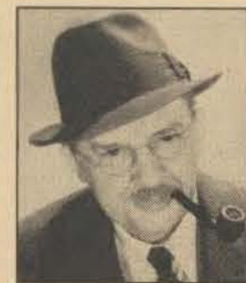
Jean Hersholt—he's the "Dr. Christian"

SHIRLEY TEMPLE, the growing-up girl, gets a role tailor-made to suit her in her new radio