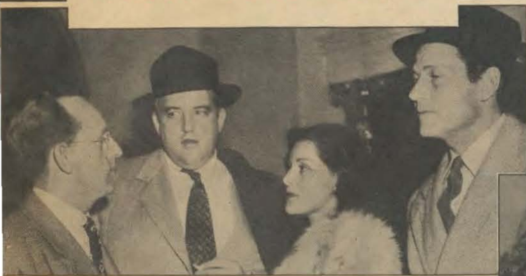
GUILD MEMBERS (left to right) Kay Kyser, Laird Cregar, Frances Dee and hubby Joel McCrea are others in pool to aid war effort with free talent