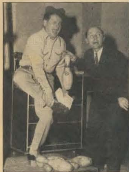
AL PEARCE (Thursday, NBC) has to be "on his toes," or Ray Erlenborn, his dead-pan stooge and sound-effects technician, will be!