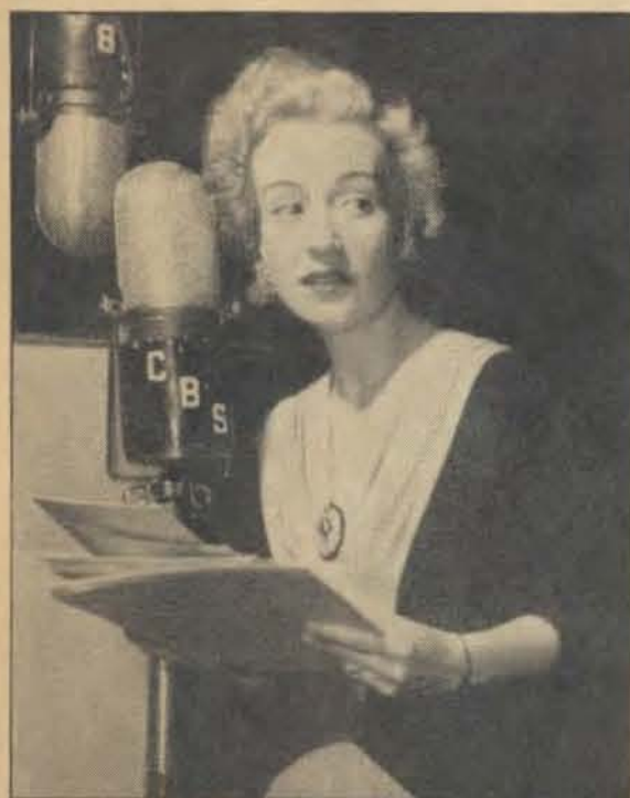
ONA MUNSON, who has played the part of Lorelei Kilbourne, ace reporter on the "Big Town" "Illustrated Press" for the past three seasons (above), registers fear in a tense moment during one of the show's rehearsals