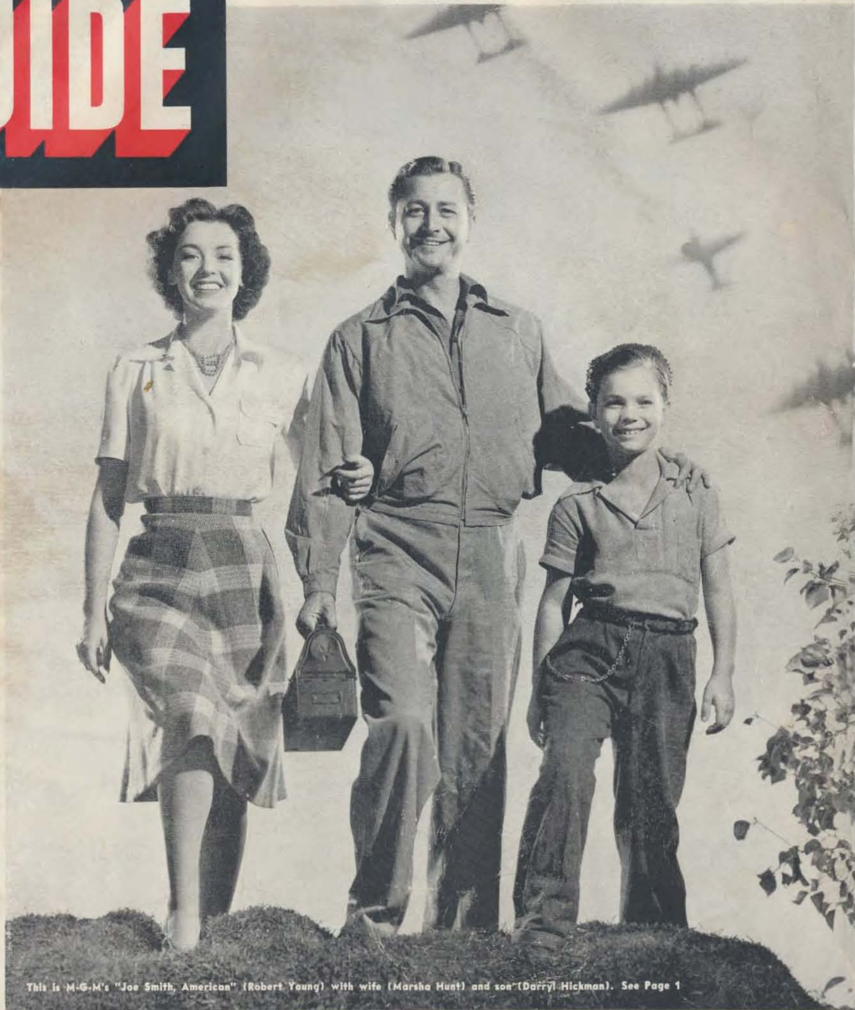
This is M-G-M's "Joe Smith, American" (Robert Young) with wife (Marsha Hunt) and son (Darryl Hickman). See Page 1

Meet the Real "Joe Smith, American": Aircraft Worker This and Every Week: Complete Radio Program Listings