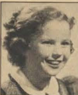
Shirley Temple—begins new series Wed.

MAXWELL ANDERSON, writer or collaborator on such plays as "Winterset," "What Price Glory," "Elizabeth, the Queen" and "Mary of Scotland," will contribute the dramatization, etching the role of America in the current world upheaval, on "This Is War." Fredric March is