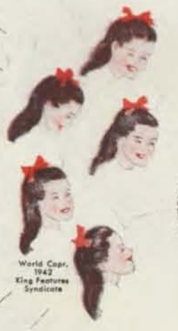
World Capr. 1942 King Features Syndicate

Five little princesses—all in a row. BABY RUTH is the first and only candy ever given to the famous Quintuplets.