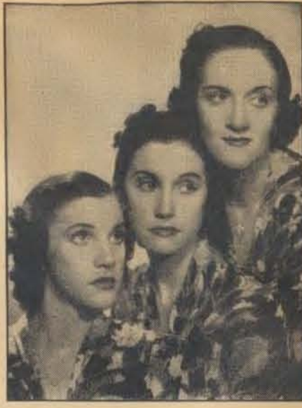
ANDREWS SISTERS, noted for their close harmony "swing" on the radio, have swung to straight ballads for a Decca record