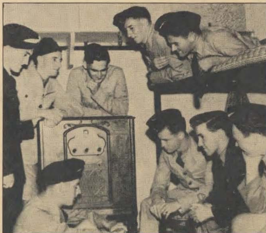
EMPIRE AIR SCHEME trainees in Canada are ardent short-wave listeners. Above: A group of the trainees, composed of Australians and New Zealanders, crowd around the radio, listen to a news bulletin from home