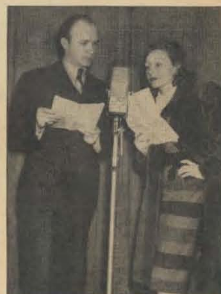
"THIN MAN" star Les Damon and actress Elizabeth Bergner recently co-starred in a dramatic sketch on "Listen, America" (Sun.)