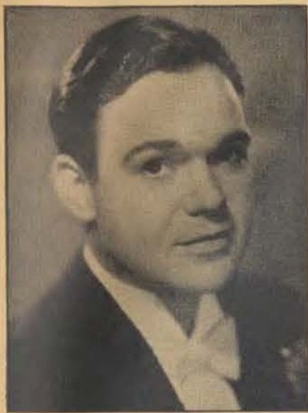
JAMES MELTON, via NBC's "Telephone Hour," will sing Air de Lenski from the popular three-act Russian opera "Eugen Onegin"

and to my mind they are worth more than the reality whose beauty often deadens thought." Though he wrote most of "La Mer" ("The Sea") in Paris, he put the finishing touches to it at the smart English watering-place of Eastbourne. Serge Koussevitzky, who conducts the Philharmonic-Symphony broadcast, is a noted interpreter of Debussy's fanciful score.