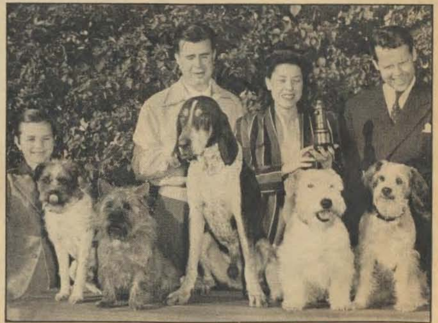
HERE'S the quintet of canine stars that won the 1941 "Boscar" awards. Best tragic, dramatic, comic and character roles were honored at home of comedian Ken Murray, shown behind sad hound above, with little Darryl Hickman, Judy Canova, Arthur (Dagwood Bumpstead) Lake