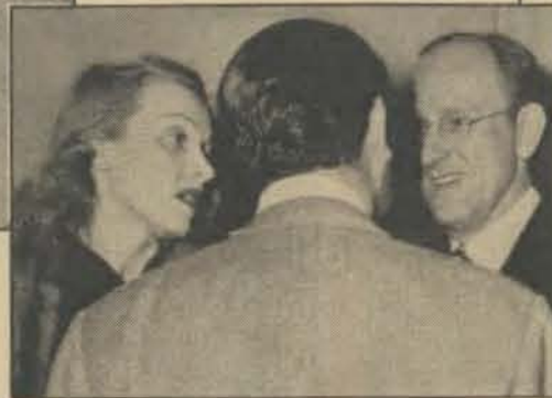
THIS IS THE PLEDGE stars signed. Volunteers will fill any request for free service authorized by the committee