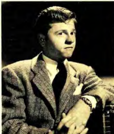
IT SHOULD not be forgotten, though, that Mickey is fast growing up to adulthood in acting-power, eagerly, confidently awaits heavier dramatic work