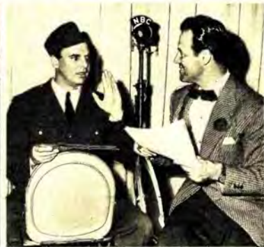
THE SOLDIER who earned a fortune as a kid actor won ten silver dollars for his answers when he appeared on Horace Heidt's "Treasure Chest" show as a highlight of his day off