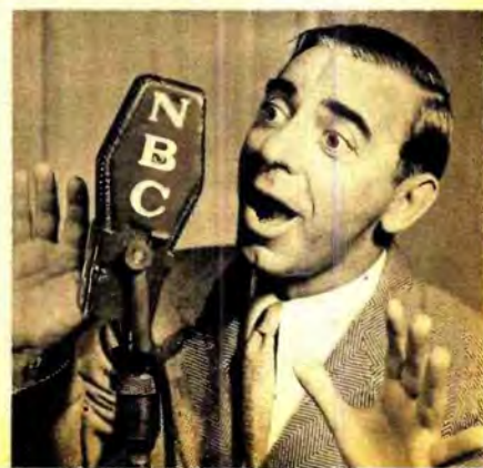
BEING BACK ON BROADWAY has its thrills and nostalgic satisfactions, but Eddie Cantor keeps his eyes on millions of radio listeners who ↓ tune him in every Wednesday night, on NBC