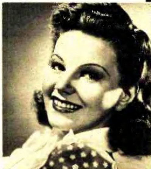
JANE FRAZEE : Universal's singing starlet. Has had bright career singing in theaters and cafes; sang on commercial radio show with Larry Clinton's band. Her work in "Buck Privates" won her stardom in "Sing Another Chorus." Auburn hair, green eyes

during 1941. Maybe you like twenty-three-year-old, red-haired Nancy Coleman. Like Dorothy Lamour, she rose from an elevator-operating job, getting her first professional dramatic experience in radio in San Francisco. Perhaps Peggy Drake, who was born Liese Lotte in the enchanting Vienna, Austria, of other days, appeals to you. Undoubtedly you've seen dozens of alluring photographs of Jane Russell these past few months, and she could quite conceivably be your pick. Of course, there's Veronica Lake, she of the blond, slender seductiveness. You might be inclined to the wavy-haired, hazel-eyed type of Anne Baxter, who, by the way, was high in the running for the lead role in "Rebecca." Perhaps you like the smile of Janet Blair, a colleen whose real name is Martha Lafferty. There's winsome, warbling little Mary Lee; and black-haired, blue-eyed Ann Ayars; and auburn-haired, green-eyed Jane Frazee. Exciting Gene Tierney has scored in "Tobacco Road" and "Sundown." A ballot is printed herewith for your use in helping to pick and boost the future winners among the current starlets.