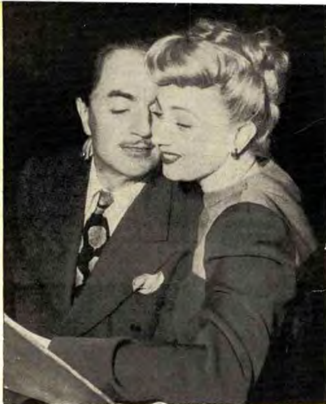
ABOVE: Emoting at the microphone in realistic Hollywood style, William Powell and Ann Southern struck this romantic pose while interpreting their roles in "My Life With Caroline," radio version of the film of that title, on "Screen Guild Theater" Dec. 14 on CBS

NEW YORK.—The "Hit Parade," perennial favorite of music-minded listeners, has undergone an alteration. The program now presents guest stars as an added attraction. The first guest under the new policy was Kate Smith, who appeared on the program Janu-