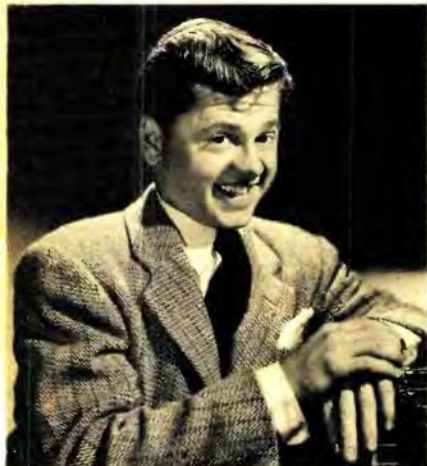
WHAT MARRIAGE will do to Mickey's puckish humor and typical-boy screen personality, expressed in above pose, is a puzzle to many