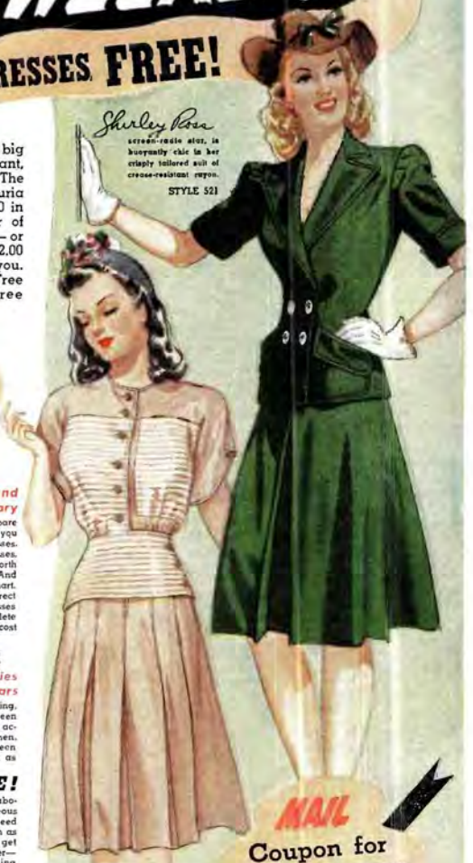
Shirley Ross screen-rodie star, is luxuriously chic in her striking tailored suit of crease-resistant rayon. STYLE 513

WRITE for Complete Portfolio of Smart, New ADVANCED, 1942 SPRING DRESSES many as low as 2 for $3.98