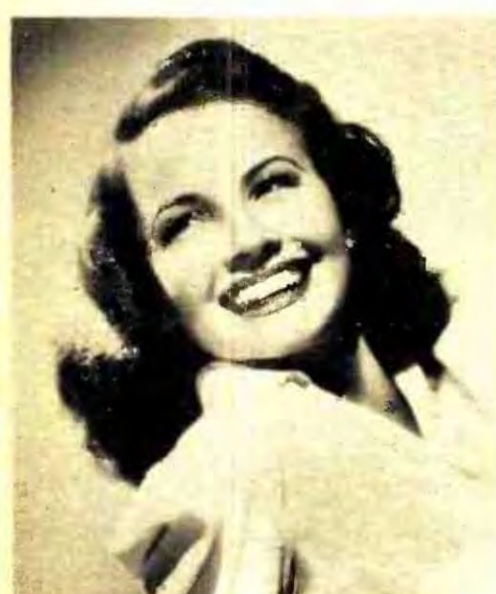
JANET BLAIR : Was vocalist with the late Hal Kemp's band before Columbia signed her for pictures. Has enticing, throaty singing voice. Five feet four, 110 pounds, chestnut hair, brown eyes. She will be seen in "Trinidad" with Pat O'Brien and Brian Donlevy

THERE may be shortages in some commodities, but there's no current scarcity in the visual luxury of lovely young femininity decorating the silver screen. And no scarcity in acting talent among those youthful visions of delight. Every year American moviegoers are confronted with the pleasing process of film neophytes making their initial bid for success, some with accompanying publicity splurges, some with not so much press notice. Every year the movie fans find interest in watching the development of the beginners, in picking their personal favorites, predicting success for individual stars and seeing how their prophecies turn out. And each year producers of pictures have a problem of determining which of the beginners show most promise of reaching the higher levels of performance and box-office appeal. Putting these facts together this year, MOVIE-RADIO GUIDE decided to do something—both to help fans get a more purposeful kick out of their personal opinions and to assist producers in gauging the popular estimates of the new feminine candidates for stardom and glamorization. On these two pages is a gallery of the girls who have already forged to the front