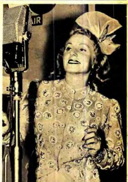
FOR THOUSANDS of listeners, Jessica Dragonette epitomizes all the glamour and early nostalgic thrills of radio. She dramatizes her exquisite soprano voice with gracious gestures, great personal charm, never uses sheet-music on broadcasts