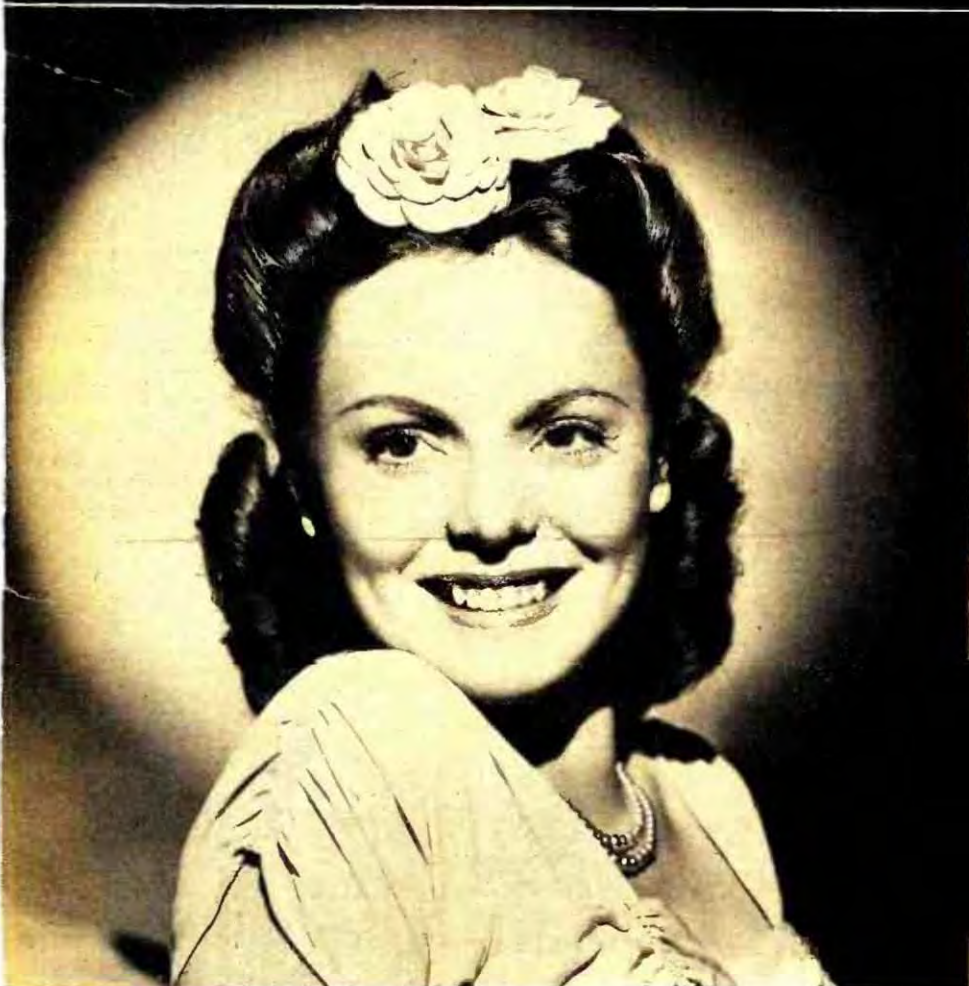
NANCY COLEMAN (above): Warner Bros. starlet; has important part in "Kings Row." Learned much from Gertrude Lawrence while playing in "Susan and God." Five feet six, 120 pounds, red hair