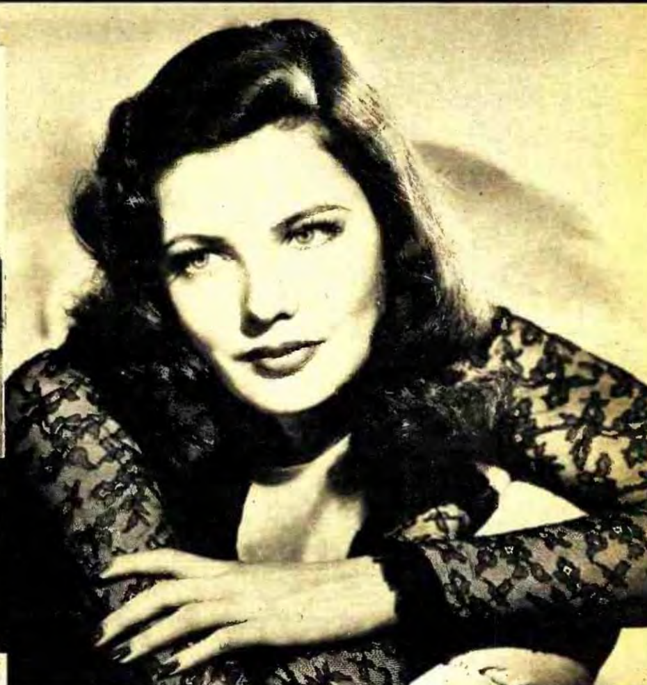
GENE TIERNEY : Came to Hollywood via the stage from eastern society. Made screen debut in "The Return of Frank James." Also clicked in "Tobacco Road" and "Sundown." Five feet five, reddish-brown hair, green eyes. Miss Tierney caused widespread talk and friction in her own family by eloping with Count Oleg Cassini last summer. She will be seen next in "Son of Fury"