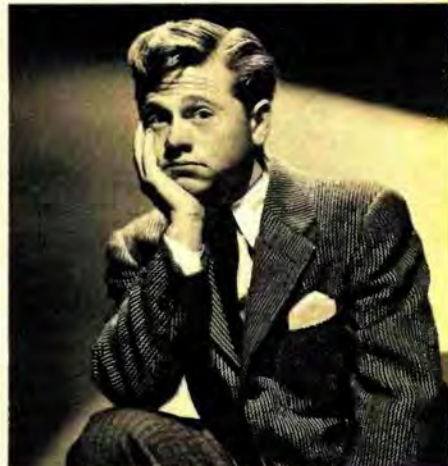
MARRIAGE is likely neither to hasten nor retard his normal dramatic development. He's still Andy Hardy for fans. He can be much more