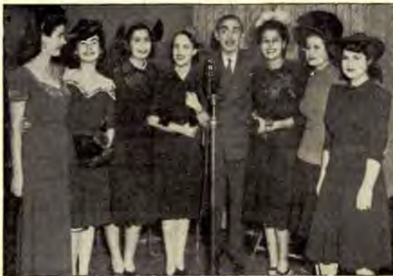
NBC International recently interviewed in its Radio City studios seven Pan-American Coffee Queens representing Brazil, Cuba, El Salvador, Colombia, Venezuela, Costa Rica and Mexico. Above: Eddie Cantor and Queens

ing out a prize batch of yarns these days as Axis powers try to frighten us out of our wits. Radio Tokyo released a couple of dandies the other day. The first was their claim that one hundred Japanese nationals were seized from the Malay city of Ipoh by the British before its capture by the Nipponese troops, taken to the city of Kuala Lumpur and shoved (by the British) into burning oil tanks under bombardment by Japanese bombers. Radio Tokyo went on to report that during the evacuation of Penang by the British, Chinese coolies who were attempting to board the evacuation boats were shot and killed by the British to make room for white passengers. Only the fiendishly sadistic mind of a Japanese Oriental could conceive such yarns.