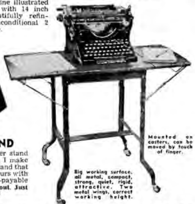
Mounted on casters, can be moved by touch of finger.

Same as machine illustrated but equipped with 14 inch carriage. Beautifully refinished and unconditional 2 year guarantee.