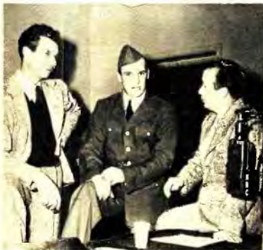
AFTER HEARING a broadcast from mythical Pine Ridge, Coogan told "Lum and Abner"—Chet Lauck (left) and Norris Goff (right)—about Port of Stockton, where he's stationed