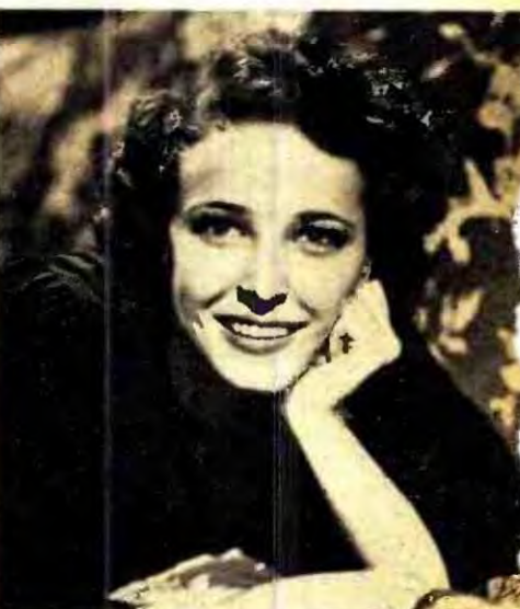
LARAINÉ DAY : Young in years and in length of screen experience, she looms as a potential big star by virtue of her work in "My Son, My Son," "Foreign Correspondent," "Doctor Kildare" series, other films. Five feet five, 112 pounds, brown hair

THERE may be shortages in some commodities, but there's no current scarcity in the visual luxury of lovely young femininity decorating the silver screen. And no scarcity in acting talent among those youthful visions of delight. Every year American moviegoers are confronted with the pleasing process of film neophytes making their initial bid for success, some with accompanying publicity splurges, some with not so much press notice. Every year the movie fans find interest in watching the development of the beginners, in picking their personal favorites, predicting success for individual stars and seeing how their prophecies turn out. And each year producers of pictures have a problem of determining which of the beginners show most promise of reaching the higher levels of performance and box-office appeal. Putting these facts together this year, MOVIE-RADIO GUIDE decided to do something—both to help fans get a more purposeful kick out of their personal opinions and to assist producers in gauging the popular estimates of the new feminine candidates for stardom and glamorization. On these two pages is a gallery of the girls who have already forged to the front