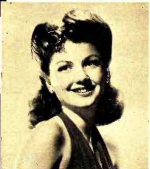
ANNE BAXTER : 20th Century-Fox starlet; has appeared in "Twenty Mule Team," "The Great Profile," "Charley's Aunt," other pictures. Five feet three, 111 pounds, hazel eyes, chestnut hair. She likes to walk and she likes to eat. She's a Hoosier