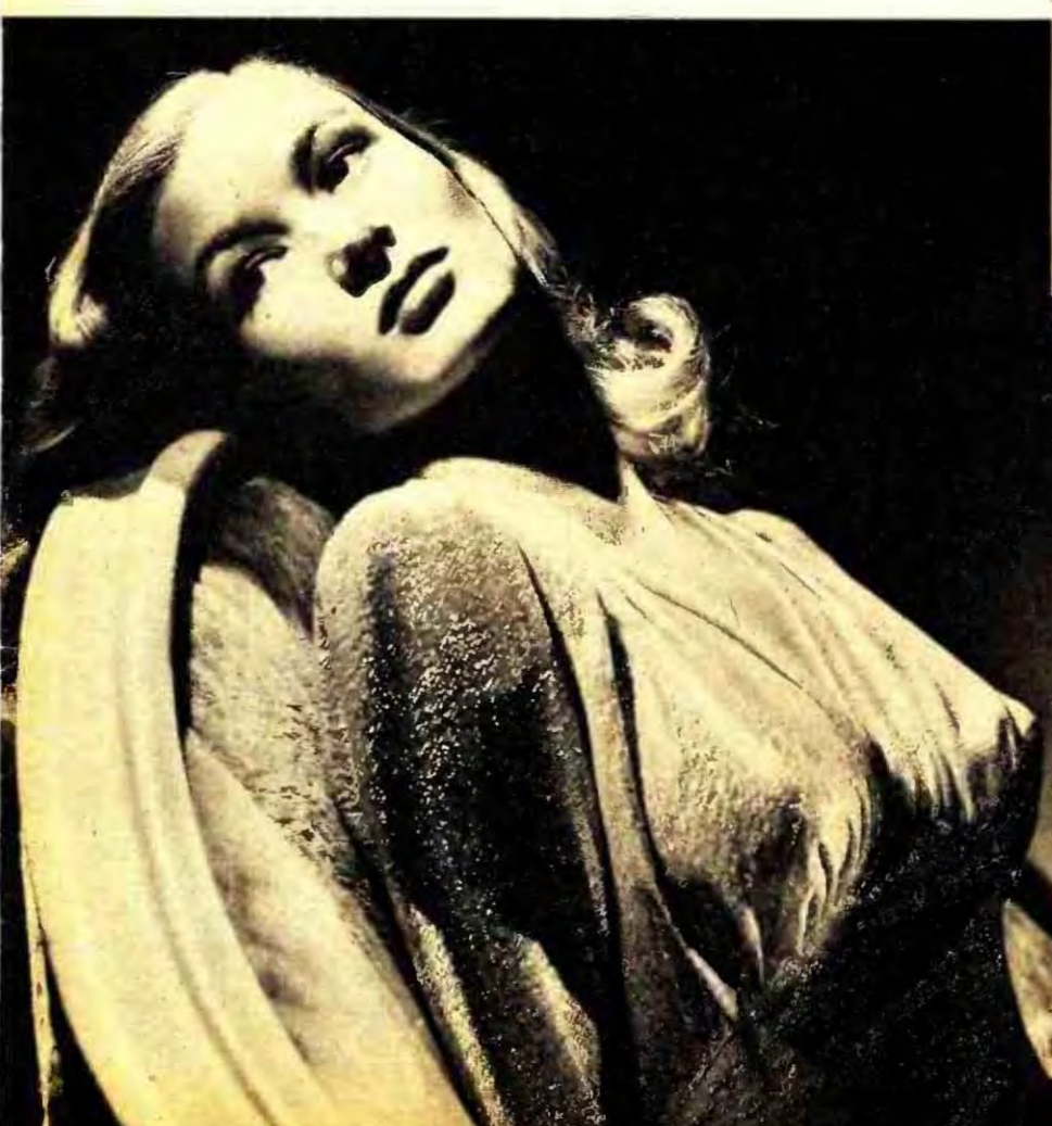
VERONICA LAKE (below): Also the object of powerful publicity as Paramount's blond bombshell. Gained film prominence by her siren role in "I Wanted Wings." Waxen blond hair, 98 pounds