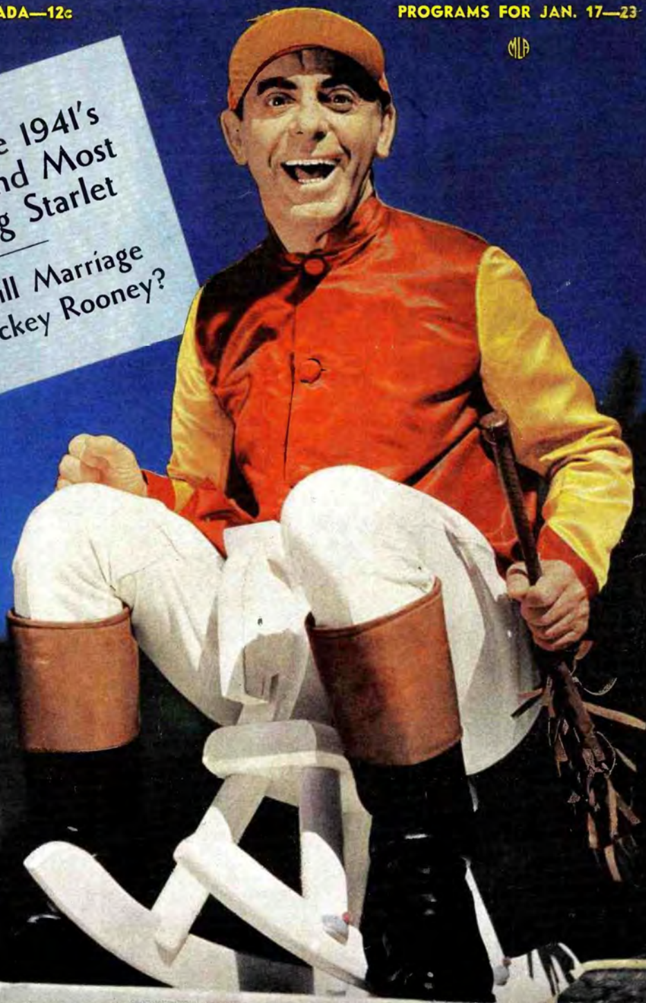
EDDIE CANTOR "Time to Smile," NBC