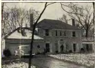
LEFT: From the door-step of his new Winnetka, Ill., home, Don McNeill looks out over the wooded property. Above, left: While waiting for an inspiration in his home study, McNeill, a former cartoonist, cuts out caricatures. Statuette on shelf is Movie-Radio Guide award