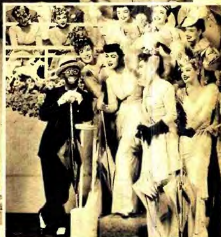
↑ GIRLS, GIRLS, GIRLS—and Eddie's big orbits don't miss a trick in scene from the finale. Cantor-owned, Cantor-produced, Broadway show "Banjo Eyes" is all Cantor at his rollicking best