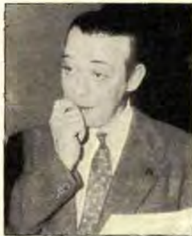
ABOVE: Try conducting a quiz show for the first time yourself if you wonder at this bewildered expression of Phil Baker as he took over "Take It or Leave It" show