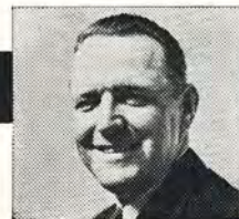
FATHER, AGED 43