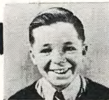
SON, AGED 9