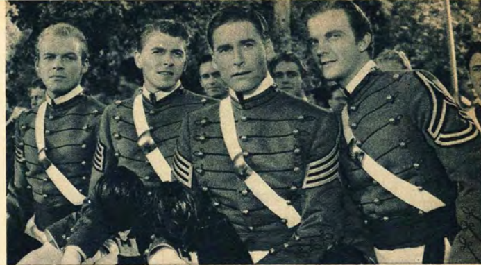
FELLOW CADET George Custer (Ronald Reagan, second from left) accompanies Stuart west and, falling in love with Kit also, becomes Stuart's rival