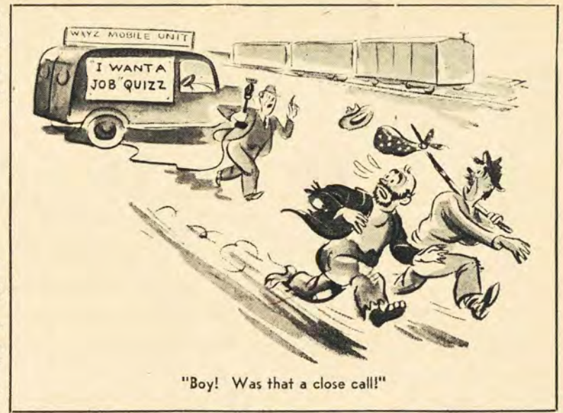
"Boy! Was that a close call!"