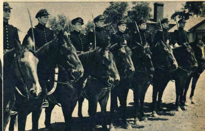
IN KANSAS the young troopers, in addition to love, find plenty of action in the bloody warfare being waged by the zealot, John Brown (Raymond Massey)