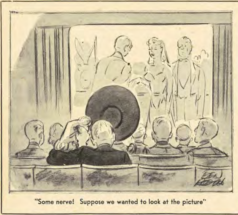
"Some nerve! Suppose we wanted to look at the picture"