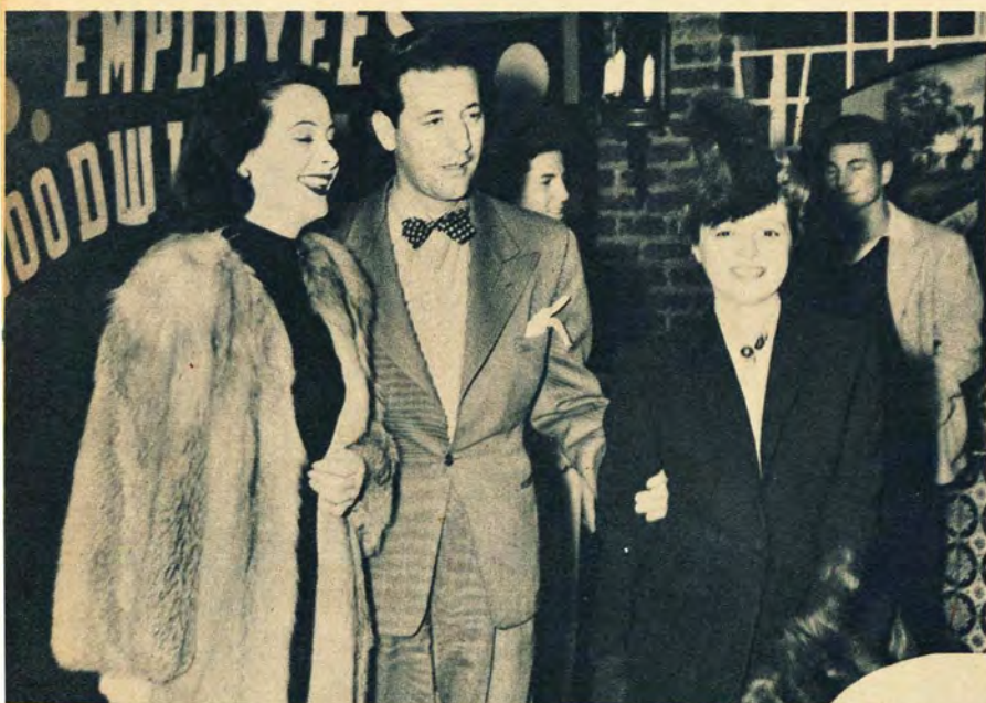
HEDY LAMARR, with the Adrians (she's Janet Gaynor), attends the preview of "Comrade X," in which Hedy does a piece of acting to make Gable, her co-star, groggy