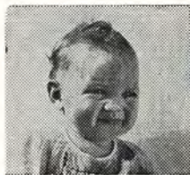
BABY, 6 MONTHS