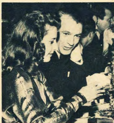
BARBARA STANWYCK, with hair grown long for "The Lady Eve," chats with Gary Cooper