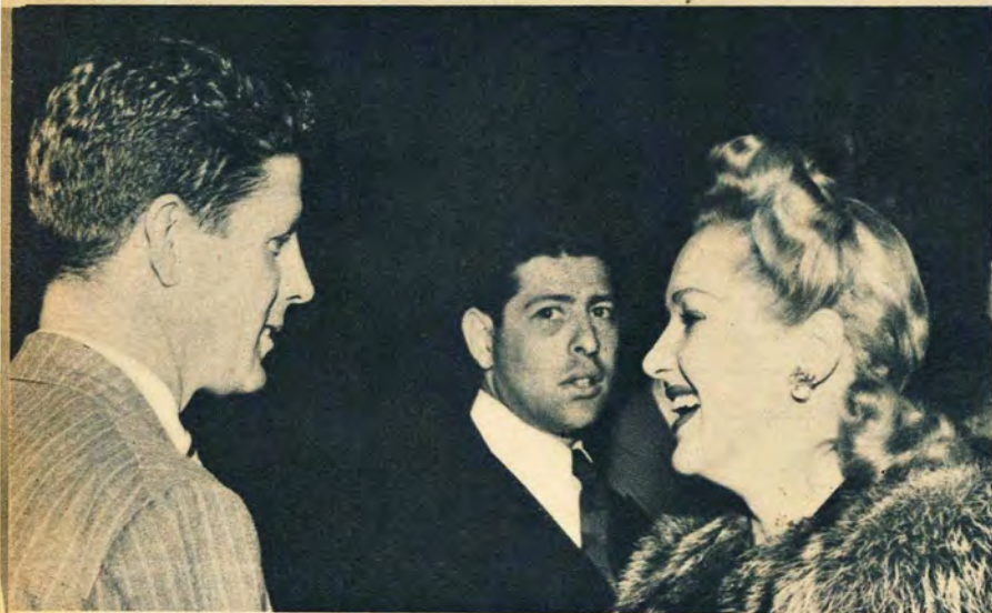
BETTY GRABLE does no moping on the Hollywood scene while steady boy friend Vic Mature is busy in New York. The lovely dancing star, now making a grand comeback in films, goes places with bandleader Rudy Vallee