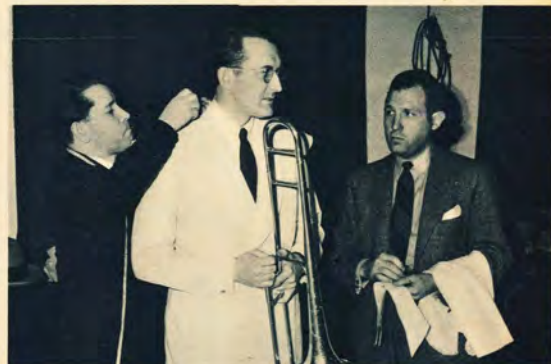
ABOVE: Business-minded Tommy Dorsey, measured by tailors at recording date here, promotes own disks, has made several selling 200,000. Hits: "Marie," "Song of India"