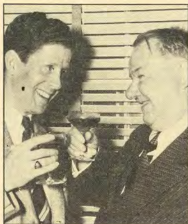
AMONG PARTY'S self-appointed entertainers, W. C. Fields won easy honors, which Rudy bestowed