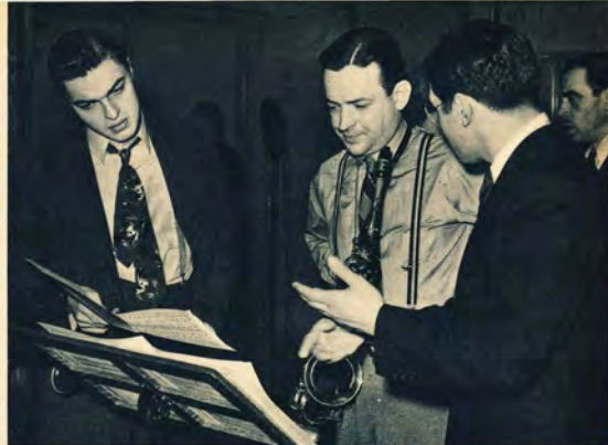
ALL-IMPORTANT —to maestro and record companies—is selection of tunes, arrangement. Stumped over these problems here are singer Bob Eberle with Jimmy Dorsey, whose waxings are consistently good Decca sellers. Like most bands, Jimmy's records from four to six sides [two to three records] in a session. Bands get up to $1,000 a side plus royalties