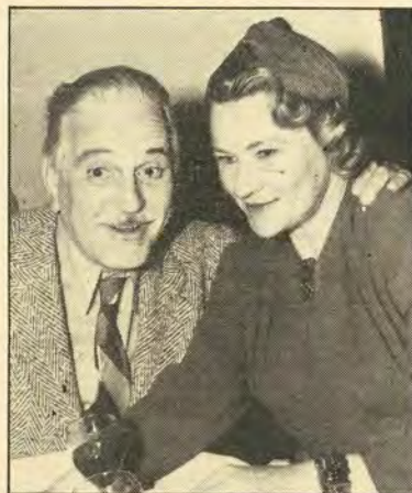
FRANK MORGAN, now returned to air for Maxwell House Thursdays, was present with his wife