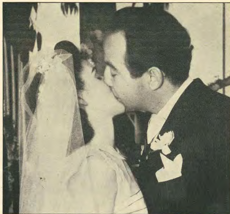
NEWLYWEDS Broderick Crawford and Kay Griffith (they were married Thanksgiving) posed for a "kiss" picture following ceremony. Here it is!

Clark Gable and Bette Davis were the most popular actor and actress for 1940, according to the movie trade-journal, Boxoffice , announcing its annual poll of what cinema stars produced the most business. For the fourth consecutive year, Gene Autry was named as the top western actor. Runners-up in the general division, in order, were Spencer Tracy, Mickey Rooney, Judy Garland and Myrna Loy. Box-office champs of 1939 were Miss Davis and Mickey Rooney. "Boom Town" is believed to have raised the stock of Gable. Another magazine ( Redbook ) selected Sol Lesser's production "Our Town" as the "most distinguished contribution to the art of motion pictures for 1940" and made the award presentation on the "Screen Guild Theater" broadcast of December 29. Now Hollywood is waiting to see what and whom the Academy of Motion Picture Arts and Sciences selects for the presentation of the annual selection of "Oscars" at the Academy's banquet early in February.