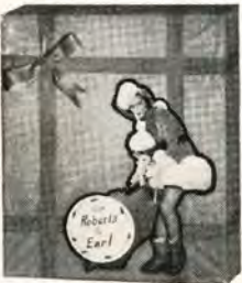
Novel Christmas Tag

MOVIE-RADIO GUIDE (Trade Mark Registered U. S. Pat. Office). Volume X, Number 14, Week of January 11-17, 1941. Published weekly by the Ceelia Company, 731 Plymouth Court, Chicago, Illinois. Entered as second-class matter at the Post Office, Chicago, Illinois, February 21, 1910, under the act of March 3, 1879. Authorized by Post Office Department, Ottawa, Canada, as second-class matter, Copyright, 1941, by the Ceelia Company. All rights reserved. Unsolicited manuscripts should be accompanied by stamped, self-addressed envelope for return. Ten cents per copy in the United States. Subscription rates in the U. S. and possessions and countries of the Pan-American Postal Union: six months, $2.50; one year, $4.00; two years, $6.00; three years, $8.00. Subscription rates in foreign countries: six months, $3.50; one year, $6.00. Remit by postal money order, express money order or check drawn to order of Movie-Radio Guide . Currency sent at subscriber's risk. Please allow four weeks for change of address. Be sure to give both old and new address. PRINTED IN U. S. A.