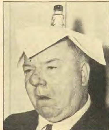
CONVIVAL MR. FIELDS stopped the show with this impersonation of dowager Queen Victoria

Academy-Award-winner Hattie McDaniels . . . Five Hollywood-produced programs head the list of the latest Crossley radio popularity survey. The toppers with their audience percentage points are, Jack Benny, 42; Charlie McCarthy, 41; Fibber McGee and Molly, 33.6; and next in order, "Lux Radio Theater" and Bob Hope's Pepsodent show . . . Burns and Allen, with Artie Shaw, will take their program to New York February 1 for three shows, then do one from Chicago.