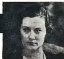
MOTHER, AGED 40