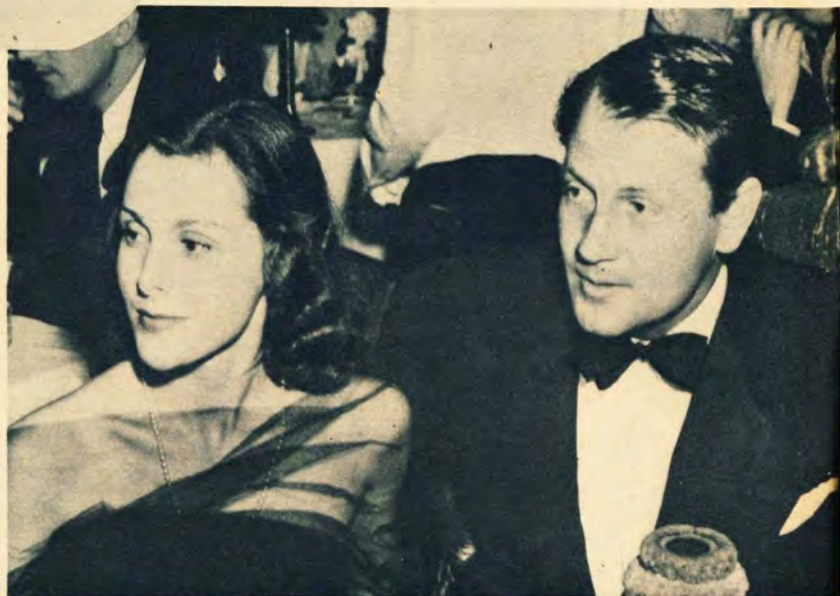
THE JOEL McCREAS (she's Frances Dee) are among the Hollywoodites seldom seen in night-spots. Significantly, a recent check-up revealed, Mr. McCrea was among the half-dozen wealthiest actors in Hollywood