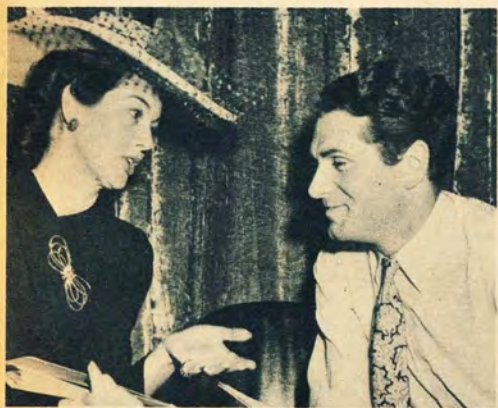
ROSALIND RUSSELL provokes a smile from Laurence Olivier during a "Lux Radio Theater" appearance