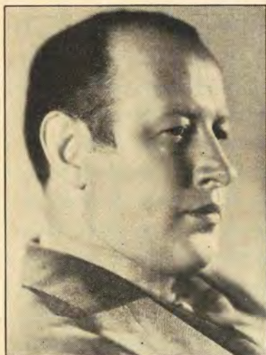
EUGENE GOOSSENS, English musician, is current guest conductor of "Ford Sunday Evening Hour"