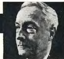
GRANDFATHER, AGED 72