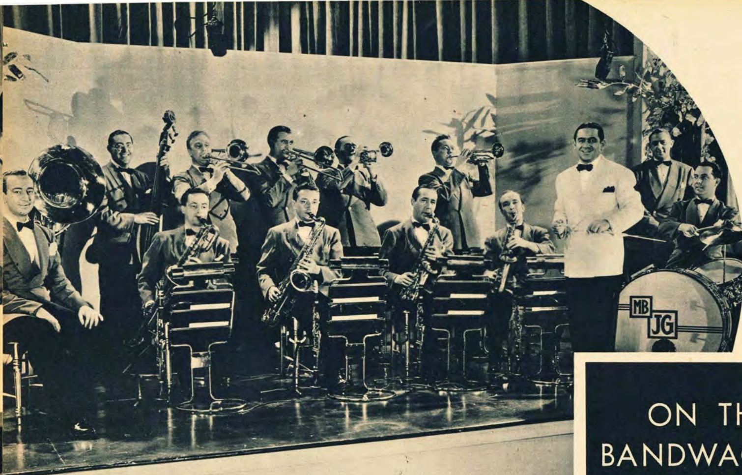
NOMINATED AS BAND OF THE WEEK is Jan Garber, famous "Idol of the Airlines," and his orchestra, pictured here. One of the oldest bandleading favorites, Garber once led small ensembles, specializing in hot novelty numbers, still favors a relatively small group. Members of his twelve-man band are identified in the story below