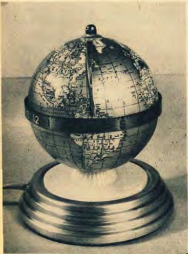
—Gustave W. Gate

WHY NOT SPEND your Christmas check on this radio clock? It tells time for the whole world