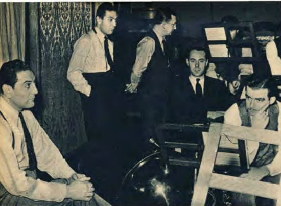
QUIET, PLEASE —Guy Lombardo, extreme left, and his brother bandmen strain to catch every flaw as they listen to playback of test recording. They know one hit record is worth as much as six months on the air. The Royal Canadians arrived long ago, but nowadays a single disk—and radio—is behind almost every new band that clicks