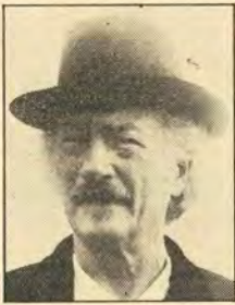
Ignace Jan Paderewski

He sat quietly up in his suite on the fifth floor. What his thoughts were on this Christmas Eve only he could tell. But that they were not happy is certain. The blue eyes that once gleamed fiery and brilliant are pale and dimmed. The mane of red-gold hair that once crowned the proud head is now a soft, silky fringe of white, straggling over his coat collar. His face is waxen pale and sad. The slender, beautiful hands, whose magic power once bewitched millions of people, are quiet and move only to turn the pages of a book, light a cigarette, sign a letter. No longer do they glide over the piano keys. For until Poland is free again, Ignace Jan Paderewski will not play.