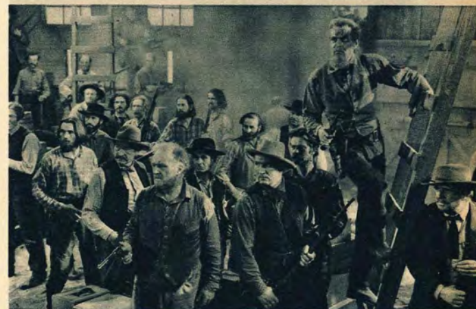
THE LOVE-STORY is played against the epic backdrop of a nation in the making. Above, the capture of Brown at Harpers Ferry is dramatically reenacted