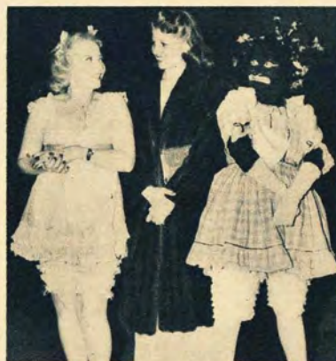
THE DUNCAN SISTERS, with Rita Hayworth (center), as they appeared on a recent benefit