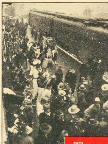
A CROWD of ten thousand fans and a young blizzard turned out at Santa Fe to greet stars