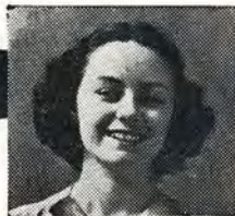
DAUGHTER, AGED 18