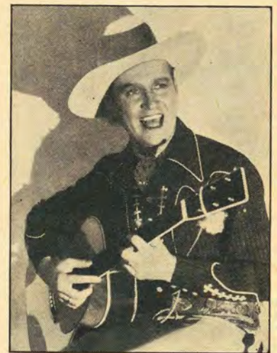
GENE AUTRY (Sun.) is a member of ASCAP, but BMI has a large library of western and hillbilly tunes

FOR MORE DETAILS ABOUT MUSIC AND DRAMA OFFERINGS SEE PAGES 14 AND 15, RESPECTIVELY.