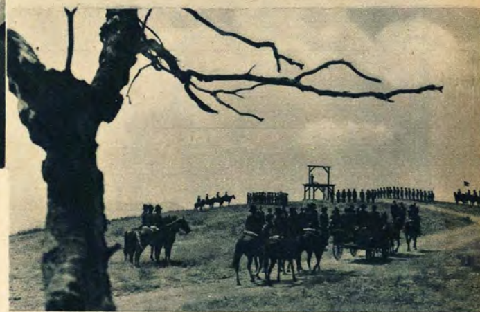
THROUGH THE extraordinary heroism of Stuart and Custer, Brown is captured and hanged. Meanwhile, Kit, choosing Stuart, is married to the young officer