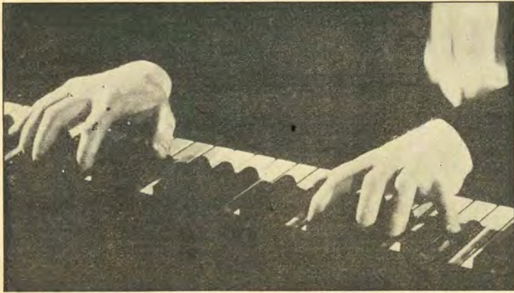
BLEEDING POLAND engages the remaining powers of aging Paderewski. His piano is unimportant so long as his fatherland is enslaved