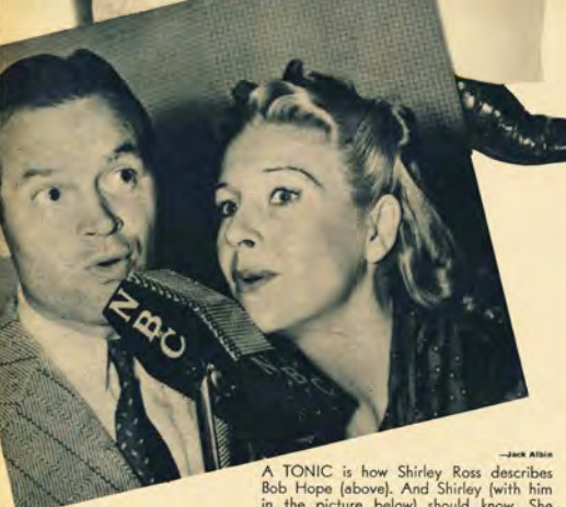
A TONIC is how Shirley Ross describes Bob Hope (above). And Shirley (with him in the picture below) should know. She introduced him to movie-goers in 1938