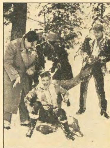
NOVELTY for the stars was the snow party. Above: Jean Parker grounded by snowballs