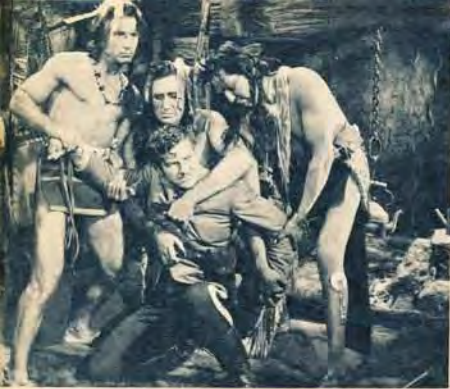
ROBERT PRESTON, as Constable Ronnie Logan, is captured by Indian friends of Louvette (Paulette Goddard), his lover, who believes she is saving his life in taking him from danger