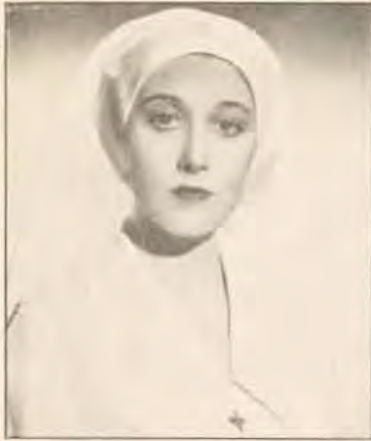
ARDENT RED CROSS worker is Vivian Fridell, star of NBC's veteran serial, "Backstage Wife"