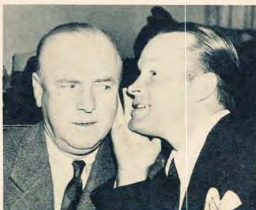
S-S-S-SHHH! This isn't romance. And judging from the apprehensive expression on the face of William Frawley when the camera snapped, it isn't a new Bob Hope wisecrack, either. Which leaves one alternative: Bob is trying to stick Frawley with the dinner-check!