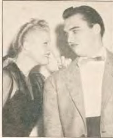
NOT MAD, just playful here are Glenn Miller ace vocalists Marion Hutton and Ray Eberle