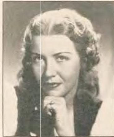
THIS IS VERA VAGUE, nee Barbara Allen, appearing in films now as she is really—a glamour gal