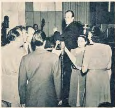
BOB also works on "Plantation Party," "Wings of Destiny," "Knickerbocker Playhouse," other shows