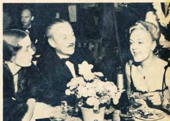
VIRGINIA FIELD, whose hot performance as the burlesque queen in "Dance, Girls, Dance," will not soon be forgotten, is being very, very proper as hostess to the socially prominent Rhinelanders Stewarts, of New York, when they visited Hollywood recently. Miss Field's handsome fiance, Richard Greene, is away to the wars