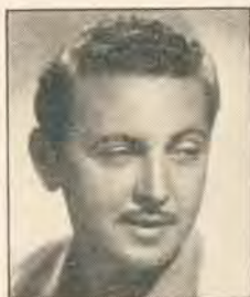
ALLAN JONES sings and romps through the zany comedy of "One Night in the Tropics"

Cast: Allan Jones, Nancy Kelly, Bud Abbott, Lou Costello, Robert Cummings, Mary Boland, William Frawley, Peggy Moran, Leo Carrillo, et al. A Universal picture, directed by A. Edward Sutherland, who also directed "The Boys From Syracuse."