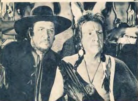
FOR PERSONAL INTERESTS, the whisky-smuggler, Corbeau (George Bancroft), followed Riel. With Bancroft above is the noted Shakespearean actor, Walter Hampden, as Chief Big Bear