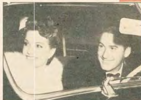
IT'S NEWS when the Errol Flynns (Lili Damita) have a date together, but here they are leaving Ciro's.