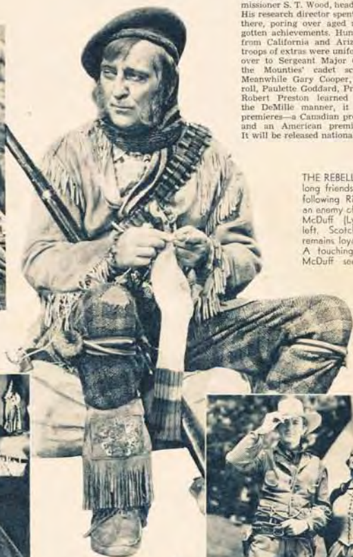
GARY COOPER is a Texas Ranger who comes into Canada seeking Corbeau. A rivalry flares between Cooper and Preston Foster, Mountie Sergeant, over the hand of April Logan (Madeleine Carroll), as well as over who will be the first to arrest Corbeau

THE REBELLION breaks life-long friendships, and Duroc, following Riel, finds himself an enemy of his friend, Todd McDuff (Lynne Overman), left, Scotch trapper who remains loyal to the Crown. A touching scene is when McDuff sees Duroc killed