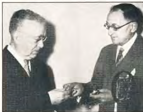
20 YEARS AGO Dr. Frank Conrad (left) gave radio's first newscast. Above: Receiving service emblem from Westinghouse official