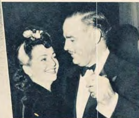
EX-MRS. DAN TOPPING, JR. (Arline Judge) celebrates her return to films after deserting them for marriage, by dancing with her friend, silent-screen star Antonio Moreno. Break up of the marriage gave Arline back to films