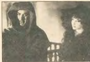
TYRONE POWER, Linda Darnell co-star in remake of Douglas Fairbanks' hit, 'The Mark of Zorro'