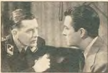
"ESCAPE" has Robert Taylor as the son of imprisoned Emmy Ritter, Philip Dorn as Nazi doctor