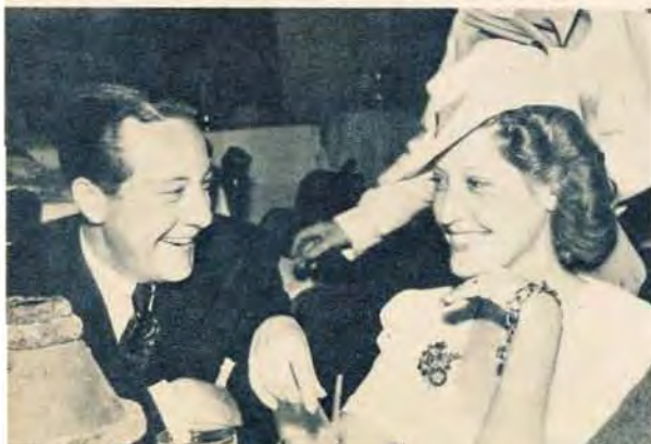
THE GENE RAYMONDS (Mrs. Raymond is Jeanette MacDonald) gave a surprise party recently for Gene's brother and Jeanette's sister, whose birthdays fell, oddly, on the same date. Real surprise of the party was when Gene turned up with brunette hair, which Jeanette smilingly approves above