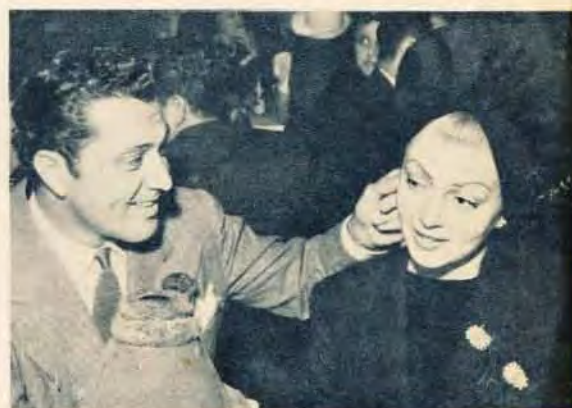
TONY MARTIN AND LANA TURNER are another pair seen often about the Hollywood night-spots at the moment. Tony is playfully chucking Lana under the ear to give her a slight idea of what Hollywood masseurs will be doing to her shortly when they go to work on her excess poundage before her next film starts