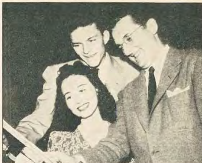
SEEN WITH SINGERS Connie Haines and Frank Sinatra, Tommy Dorsey (right) is out to discover unknown, unsung song-writers

And—wave a flag for radio—it also promises to inject some new blood, more originality, new ideas into the rather static thoroughfare known as Tin Pan Alley that, like a giant phonograph record, has been going around and around in a circle for years. Old, white-haired songs get revived; the masters are robbed of whole passages—camouflaged and injected with the goat glands of swing; and, over it all, is the inescapable fact that "love" still rhymes with "above."