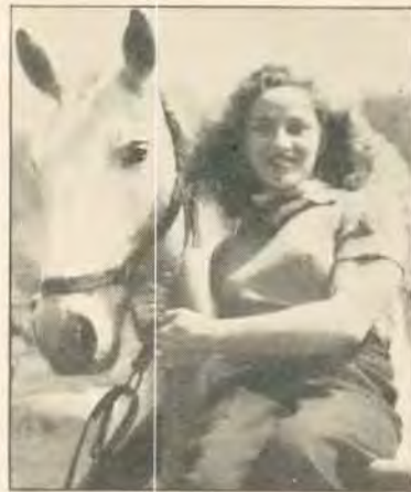
PLUCKY HEROINE OF RADIO, Connie Boswell is now singing on Bing Crosby's Thursday "KMH"