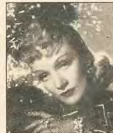
MARLENE DIETRICH plays a rowdy cafe singer again in the riotous "Seven Sinners"

Cast: Marlene Dietrich, John Wayne, Albert Dekker, Broderick Crawford, Anna Lee, Mischa Auer, Billy Gilbert, Richard Carle, Samuel S. Hinds, Oscar Homolka, et al. A Universal picture, produced by Joe Pasternak and directed by Tay Garnett.