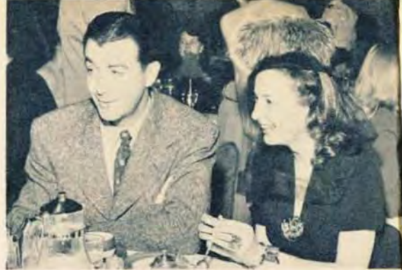
NIGHT OUT for the Robert Taylors (Barbara Stanwyck), who spend most of their time quietly at their San Fernando ranch home, finds them dining at Ciro's with their close friends and frequent dinner partners, the Jack Bennys (not shown). Ladies, note Barbara's matching costume jewelry—clip, bracelet and ring-set