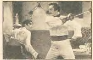
THE DUEL between Tyrone Power and Basil Rathbone in 'The Mark of Zorro' is realistic, spectacular