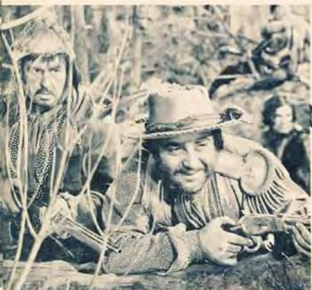
DANGER was inherent in the Mounties' efforts to quell the Riel Rebellion, a revolt of French, Scotch and Indian trappers. Duroc (Akim Tamiroff) was a patriot following Riel in revolt