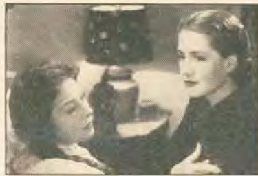
NAZIMOVA is a stirring Emmy Ritter and Norma Shearer is the American-born German countess