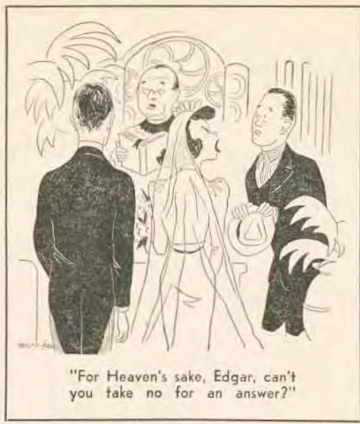
"For Heaven's sake, Edgar, can't you take no for an answer?"

NBC-John's Other Wife, sketch: WJZ WHAM WEBR WBAL KDKA WJAS WSYR (su-15-33-9.5)