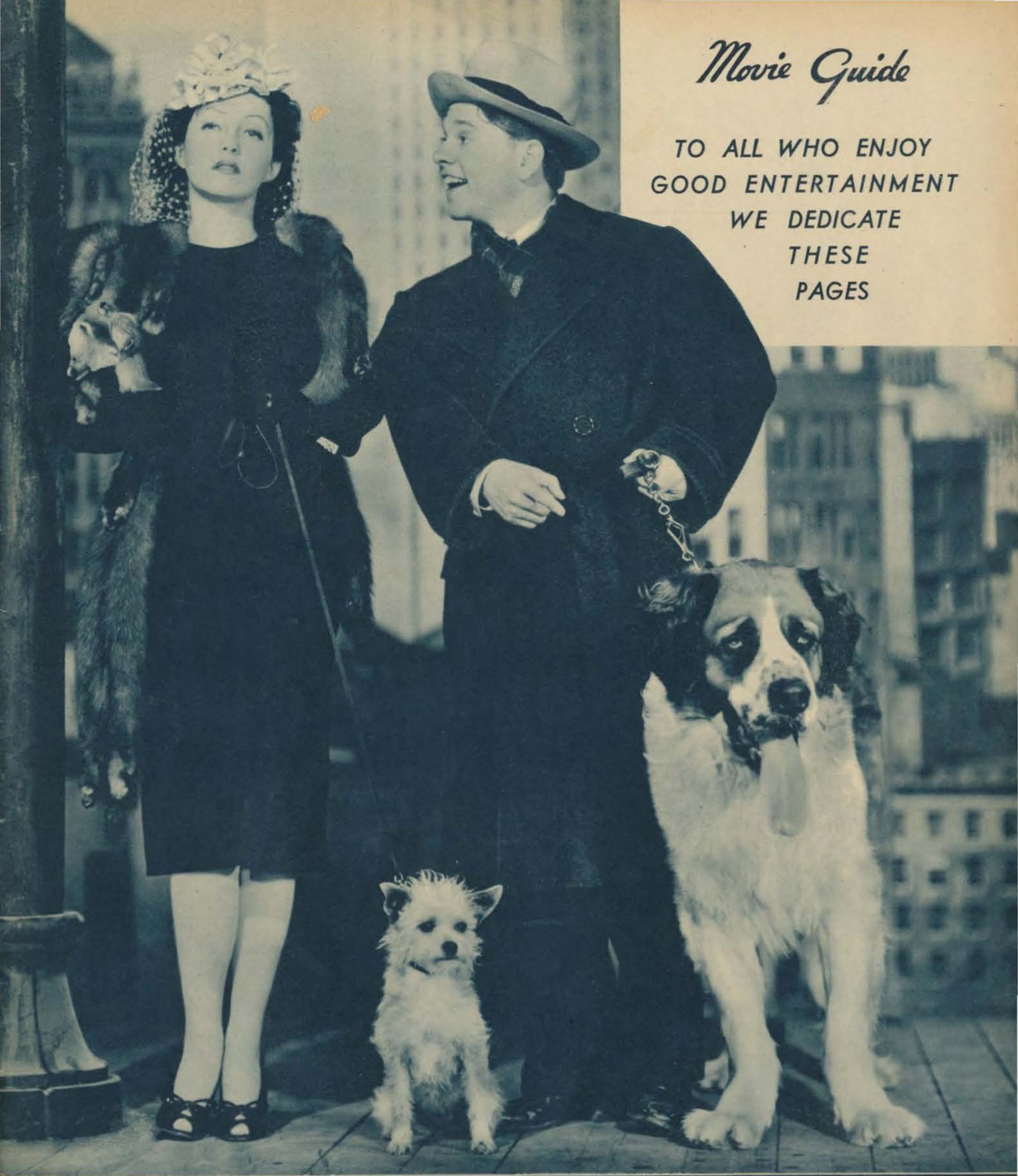
MICKEY ROONEY and DIANA LEWIS ... ANDY HARDY WORKS FAST

TO ALL WHO ENJOY GOOD ENTERTAINMENT WE DEDICATE THESE PAGES