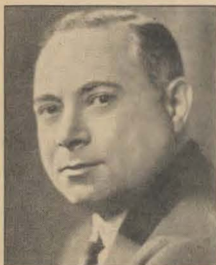
RCA President David Sarnoff is a sponsor of National Music Week, observed on the air starting May 5