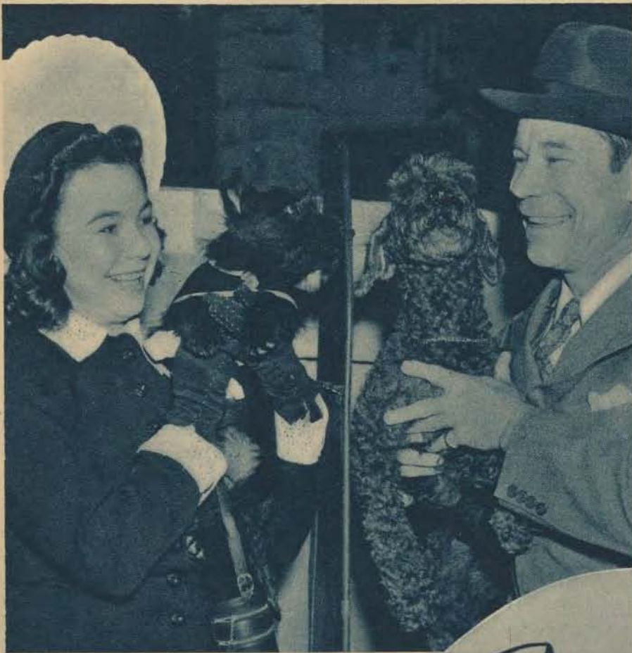
"THE BISCUIT EATER" premiere gave Hollywood stars a chance to parade their own pups. Jane Withers is as proud of "Whiskers" as Joe E. Brown is of "Gypsy"