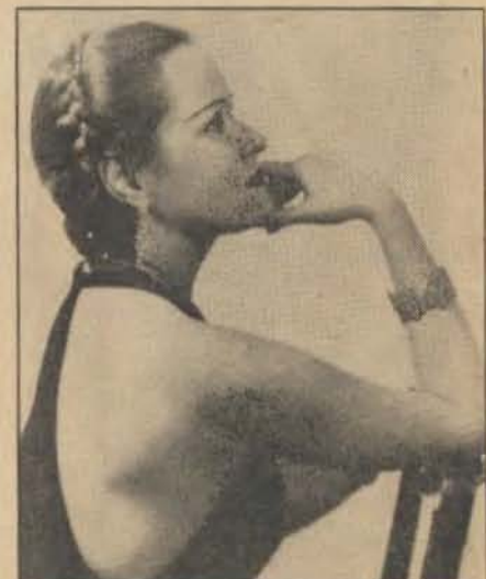
Bidu Sayao, well-known soprano, will be guest on the "Ford Sunday Evening Hour" (CBS) this week