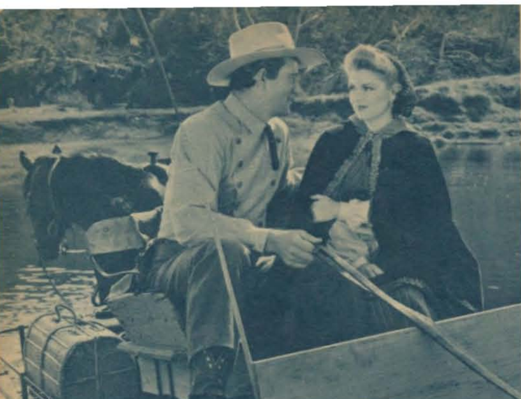
"THE DARK COMMAND"—John Wayne (as the Texas Marshal) and Claire Trevor (Cantrell's wife) realize the tragedy of her marriage to the guerrilla chieftain