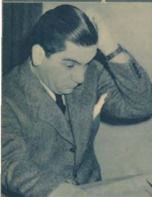
"TAKE IT OR LEAVE IT" is witty quizmaster Bob Hawk's name for his new CBS puzzler

SEE PAGE 17 FOR NEWS OF THIS WEEK'S IMPORTANT PROGRAMS AND GUESTS