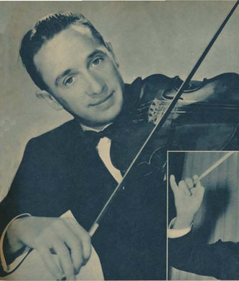
MATTY MALNECK, once Whiteman's ace violinist, now heads one of radio's sensational swing bands, is heard Sun. (NBC)