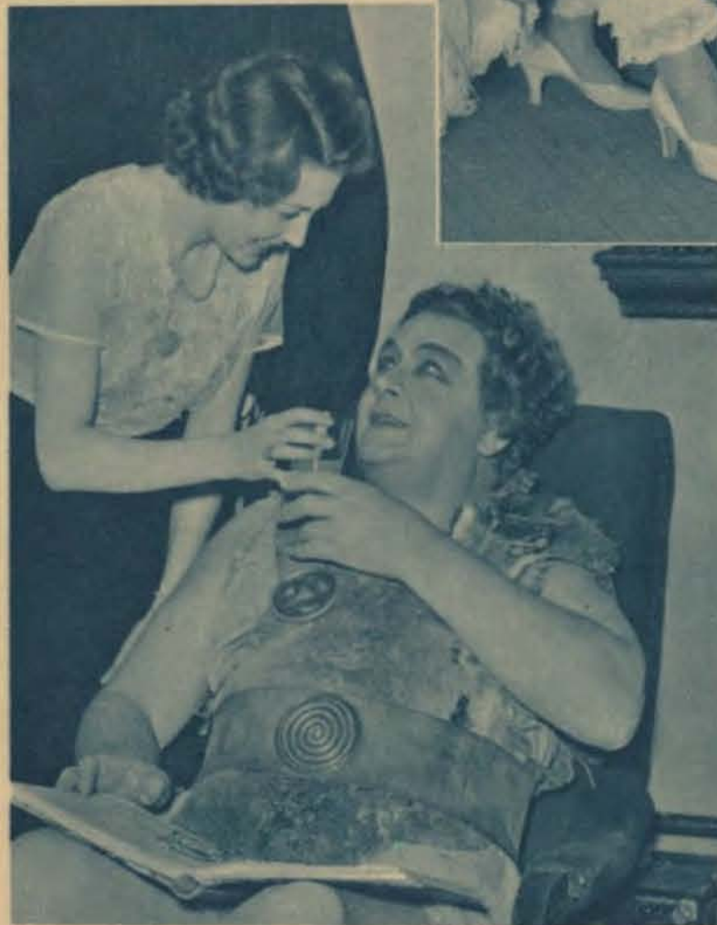
ALTHOUGH SUMS like $6,000 and $8,000 a performance once paid Caruso are only a memory today, salaries are still an enormous drain on the Met. Above: Expensive Lauritz Melchior with wife

Where do radio and its monetary aid fit into this uneasy picture? A good many thousand people have the right to ask because they have been solicited for funds over the air. Their love of opera and the weekly Metro-