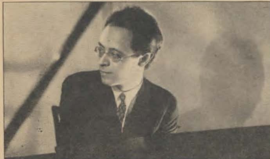
Rudolf Serkin, famed concert pianist, will be guest soloist with the New York Philharmonic Sunday. Serkin made his first appearance with the Vienna Symphony at twelve, was first heard in America five years ago

Eastern Daylight 8:30 p.m. Central Daylight 7:30 p.m. Mountain 5:30 p.m. Eastern Standard 7:30 p.m. Central Standard 6:30 p.m. Pacific 4:30 p.m.