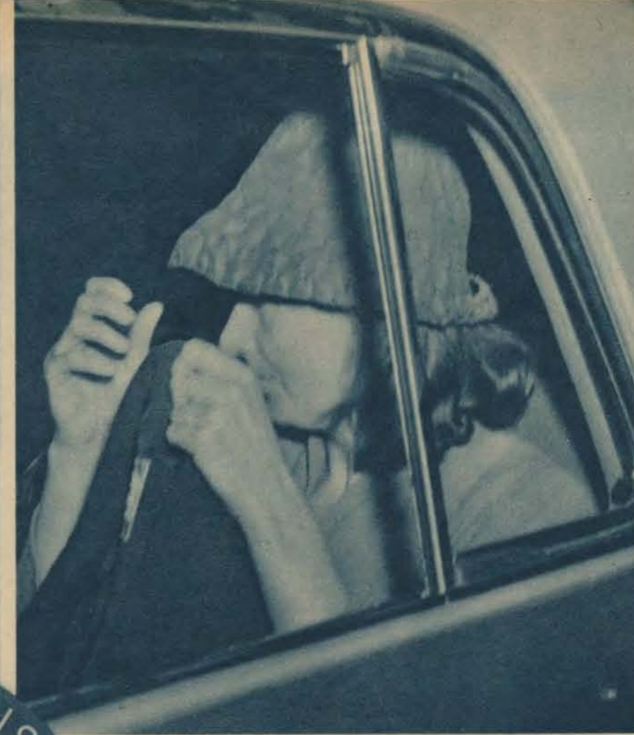
CAUGHT BY THE CAMERAMAN before she could pull the coat in her lap up before her face, Garbo looks bent and haggard in this close-up. Hollywood cameramen say that if Garbo would not attempt to elude them, her off-screen photos (of which there are few) would not be so unflattering

"LILLIAN RUSSELL" will have a twin premiere, 20th Century-Fox officials have announced. On the same day, premiere showings will be held in Clinton, Iowa, where Miss Russell was born, and in Pittsburgh, Pa., where