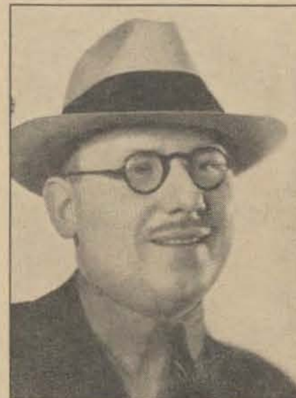
Carlton E. Morse Author of "One Man's Family"