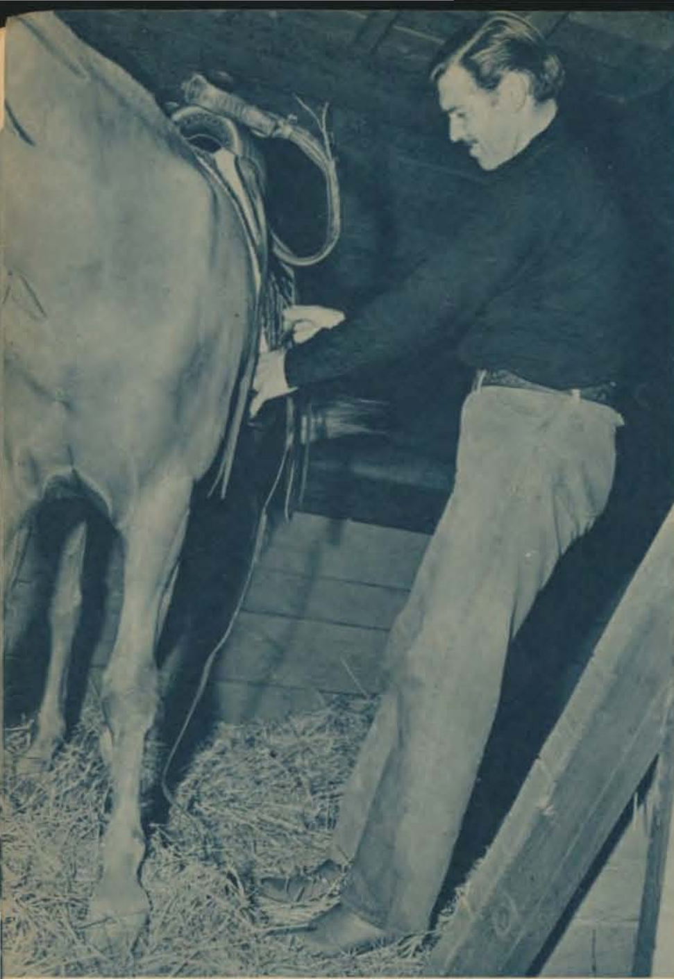
THE KID FROM CADIZ, our own Clark Gable, leads an outdoor life in which horses play a vital part. Here he is shown saddling his favorite mount, Tony, a palomino which he trained himself

CLARK GABLE, ESQ., the mule, mutt and musket man, was standing there in a tub of bona-fide Hollywood mud which was just like any other mud until he sloshed his feet in it. Then it became royal mud, as sacred to the Gable subjects as the Ganges is to the Hindus. For Clark Gable, the kid from Cadiz, is the crown prince of the fantastic kingdom of Graustark, where producers are kings and where mud often is used to throw at folks as well as to stand in.