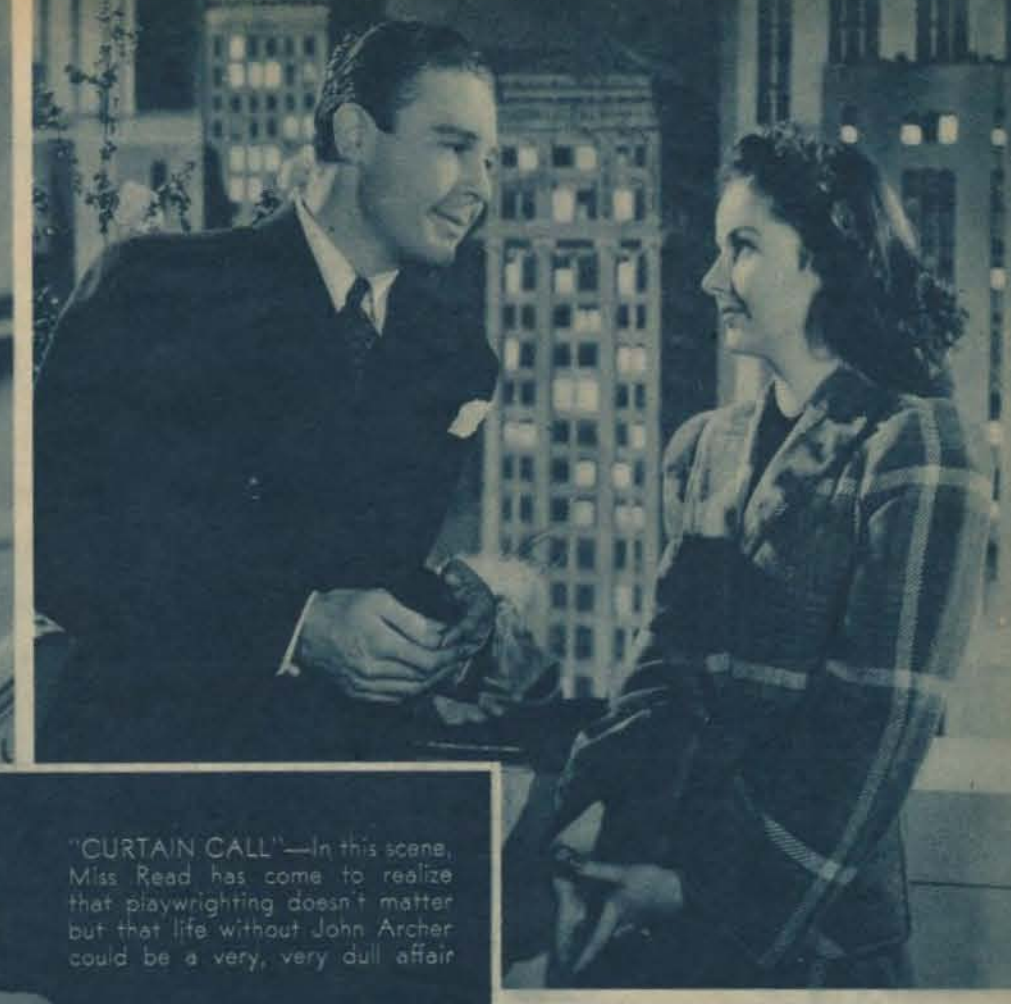
"CURTAIN CALL"—In this scene, Miss Read has come to realize that playwrighting doesn't matter but that life without John Archer could be a very, very dull affair