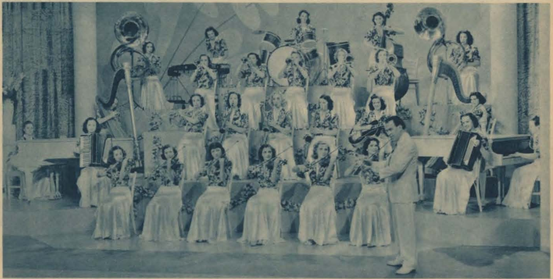
CHOSEN AS BAND OF THE WEEK, Phil Spitalny's unique All-Girl Orchestra is composed of twenty-eight musical charmers,

is currently heard Sunday nights over NBC. For a complete roster of the "Hour of Charm" girls, see column one, below