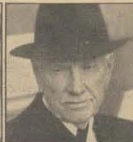
Col. E. R. Bradley, owner of Bimelech