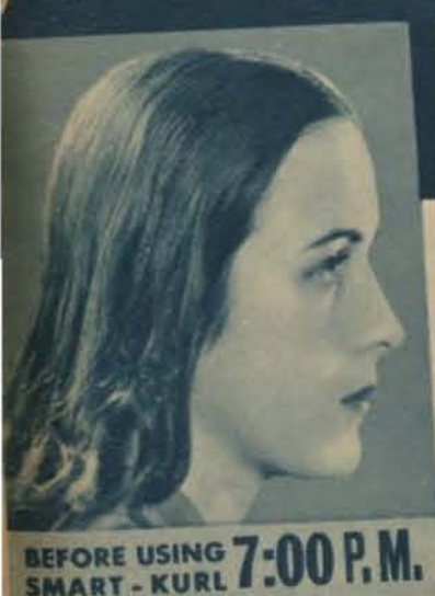
BEFORE USING SMART - KURL 7:00 P.M.