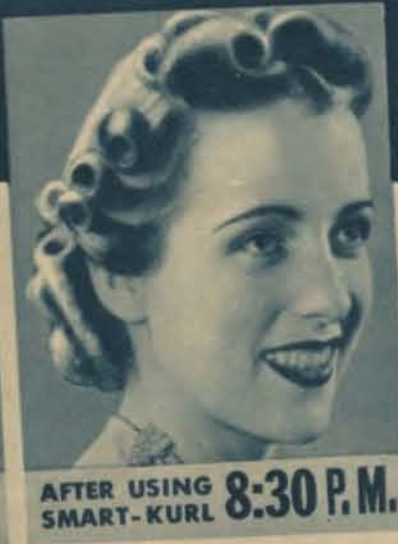
AFTER USING SMART-KURL 8:30 P.M.